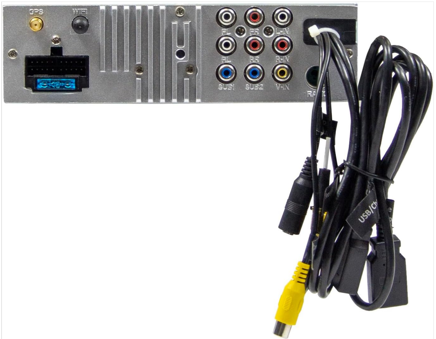
Image: Rear connections of the VMX1000DAB unit.