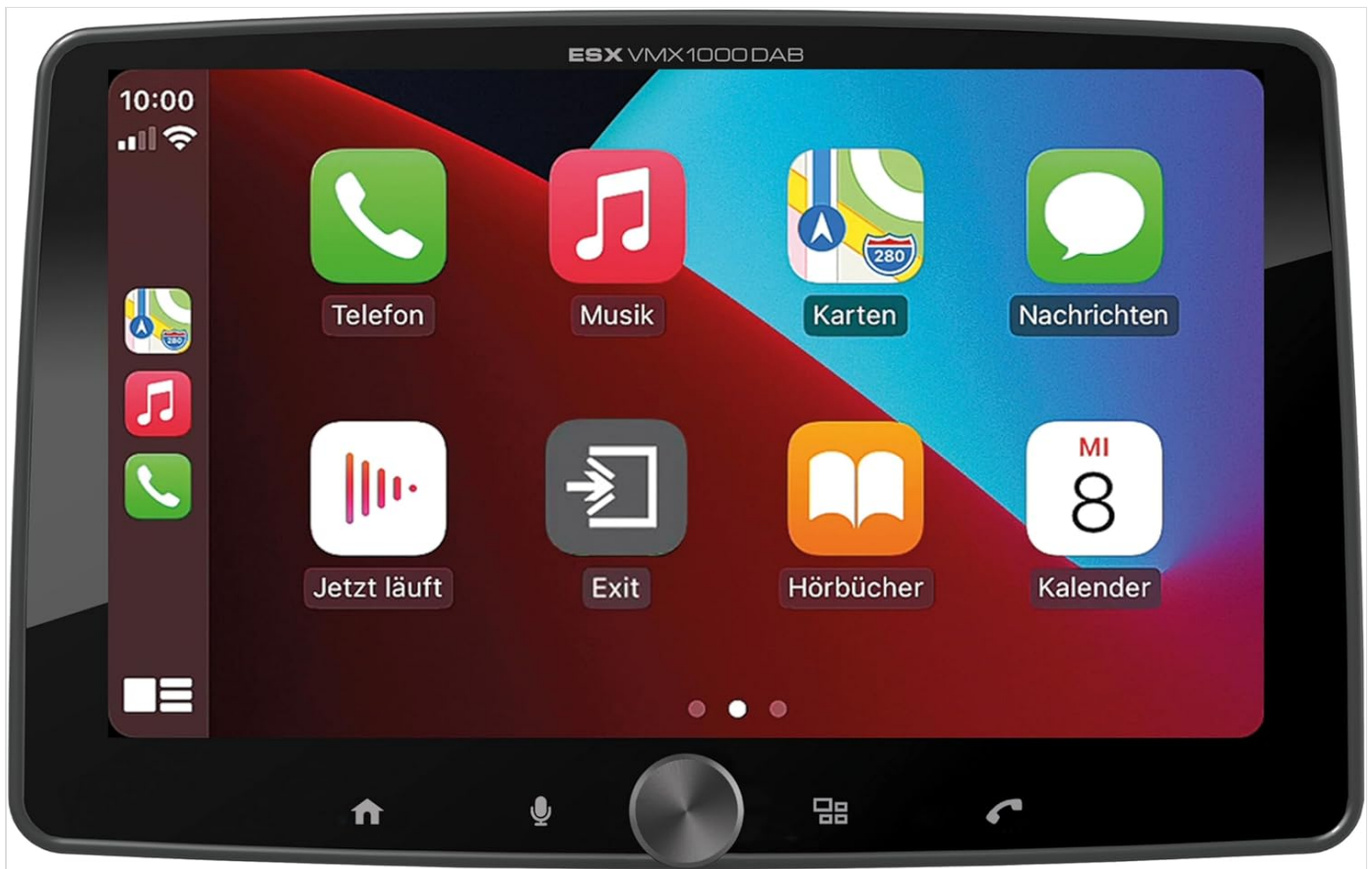
Image: Apple CarPlay interface on the VMX1000DAB.