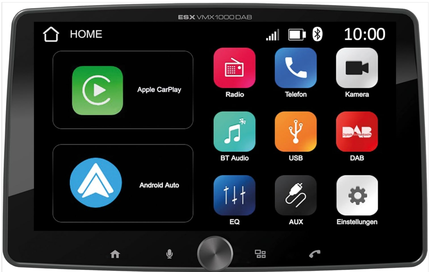
Image: VMX1000DAB Home Screen with various application icons.