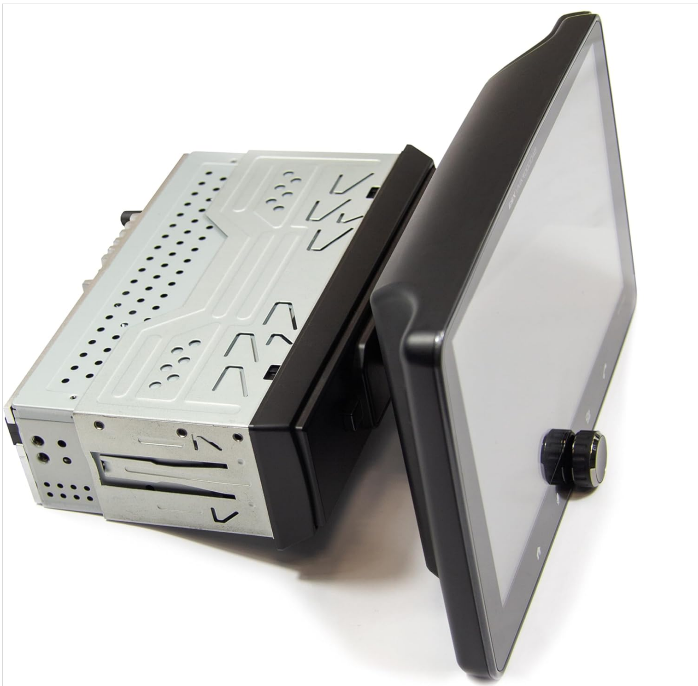
Image: The VMX100DAB unit with its detachable monitor.