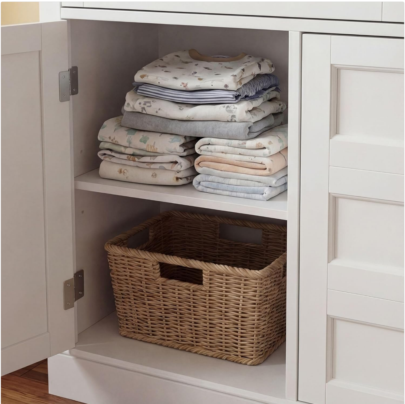
Image: Close-up of a cabinet interior, demonstrating storage for folded clothes and baskets.