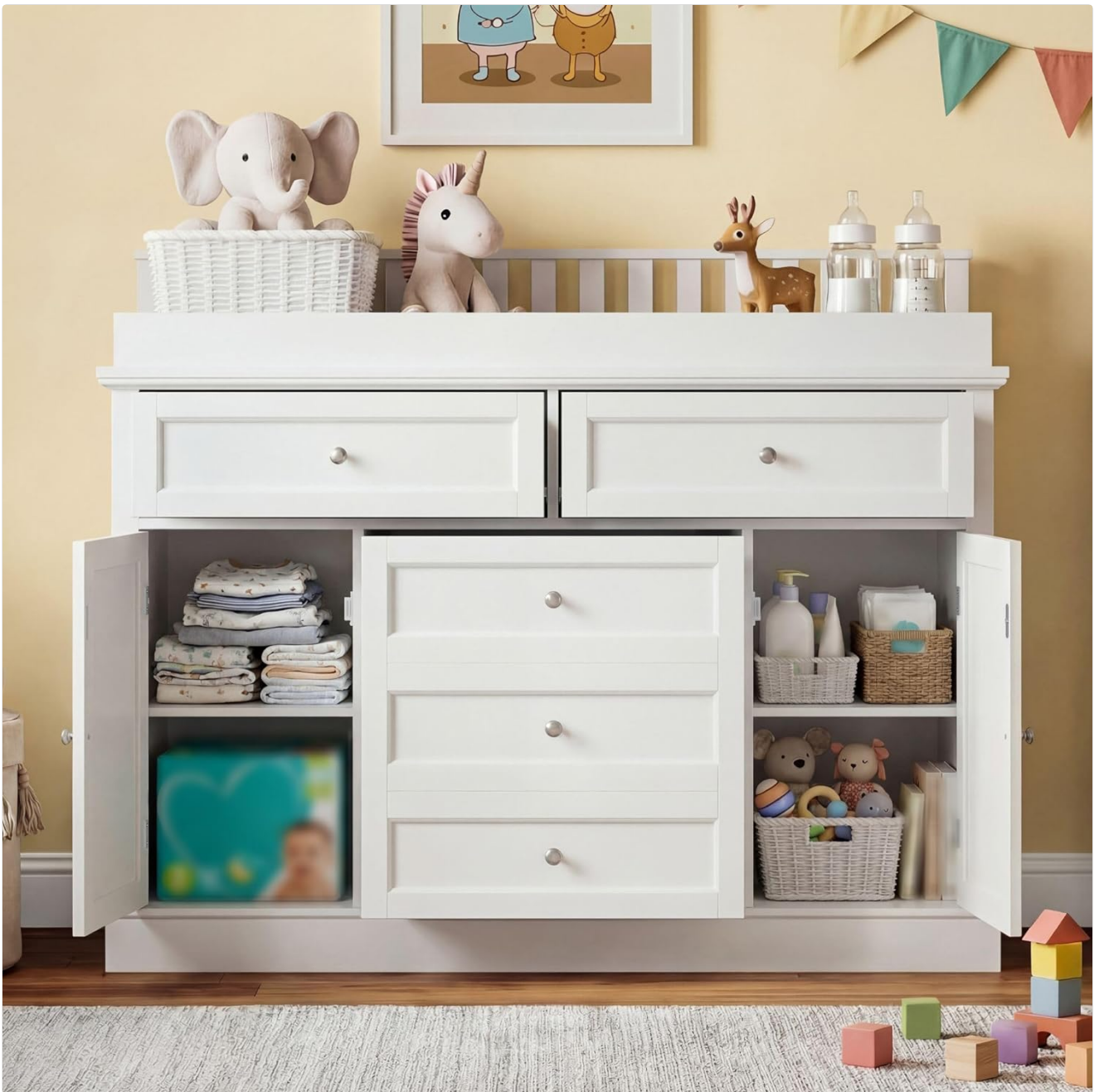
Image: The dresser with drawers and cabinets open, showcasing organized baby items.