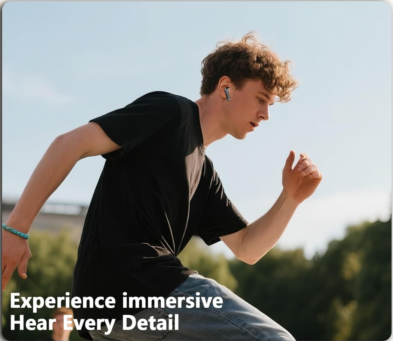
Image: Earbuds are ideal for sports and active lifestyles due to their water resistance.

43% enhanced bass with 80% background noise cancellation