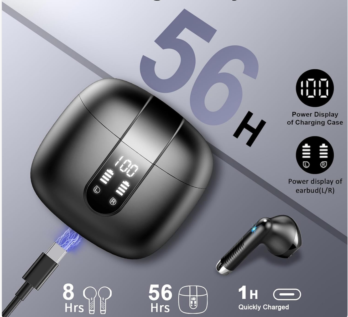
Image: Charging case displaying battery status for both the case and individual earbuds.