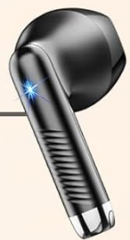
Image: Universal compatibility of Drsaec J55 earbuds with various operating systems.