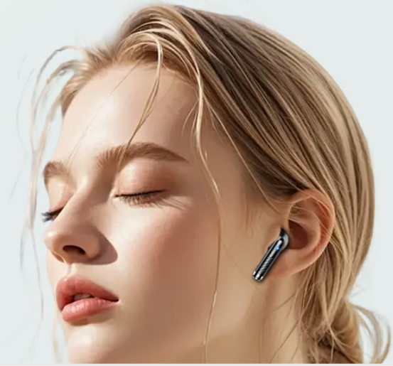
Image: Bluetooth 5.4 technology benefits, including stable and seamless connection.