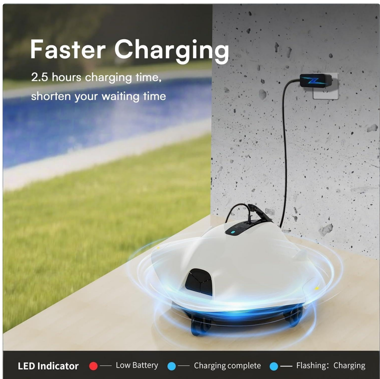
Image: The Lydsto S2 cleaner connected to its charger, with an illuminated LED indicator, highlighting its fast charging capability of 2.5 hours.