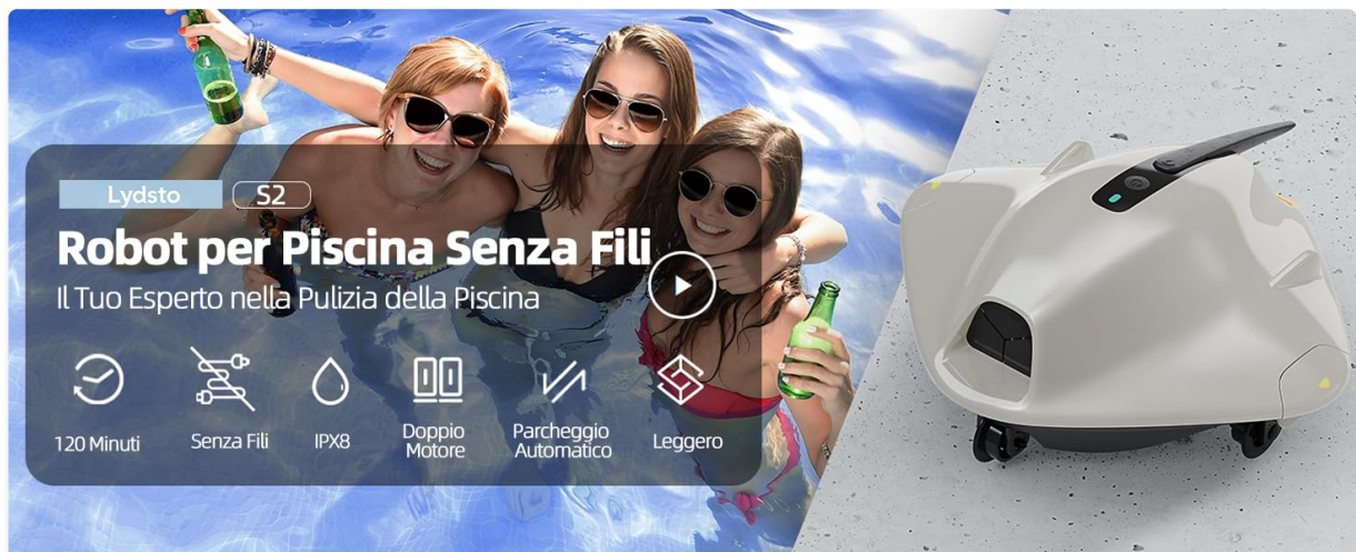
Image: Lydsto S2 Cordless Robotic Pool Cleaner banner highlighting key features such as 120-minute operation, cordless design, IPX8 waterproofing, dual motor, automatic parking, and lightweight construction.

Thank you for choosing the Lydsto S2 Cordless Robotic Pool Cleaner. This manual provides essential information for the safe operation, maintenance, and troubleshooting of your device. Please read it thoroughly before use and retain it for future reference.