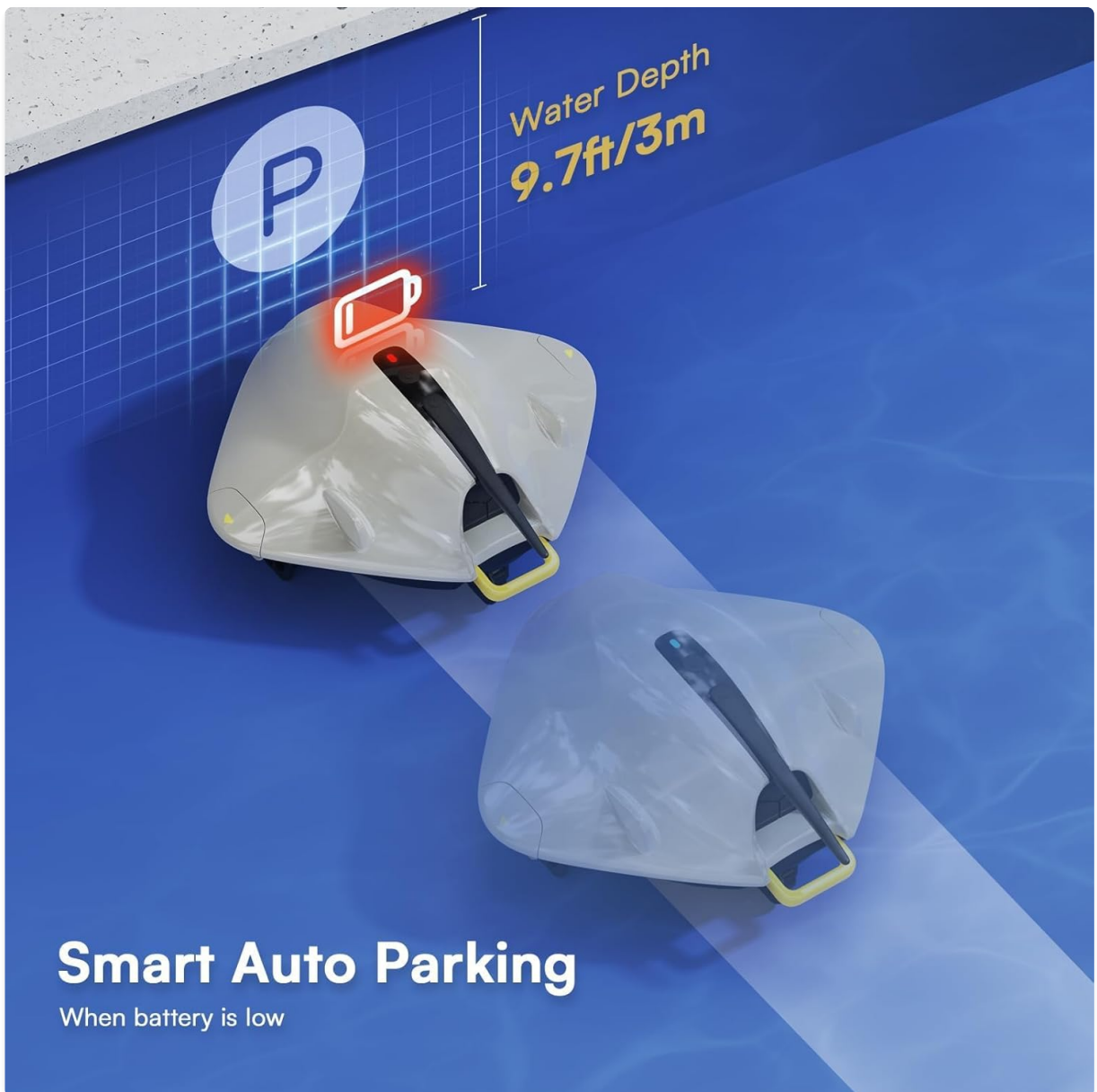
Image: The Lydsto S2 cleaner is depicted with a low battery warning, showcasing its smart auto-parking feature that guides it to the pool edge for easy retrieval when power is low.