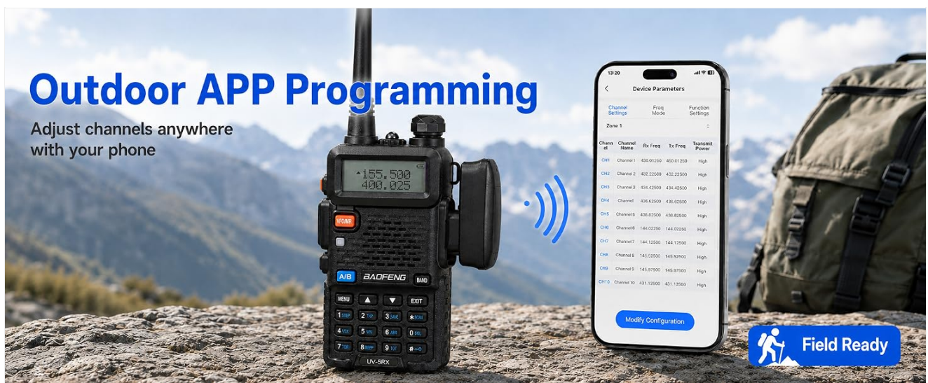
Image: Outdoor APP Programming, demonstrating the ability to adjust channels anywhere with your phone.