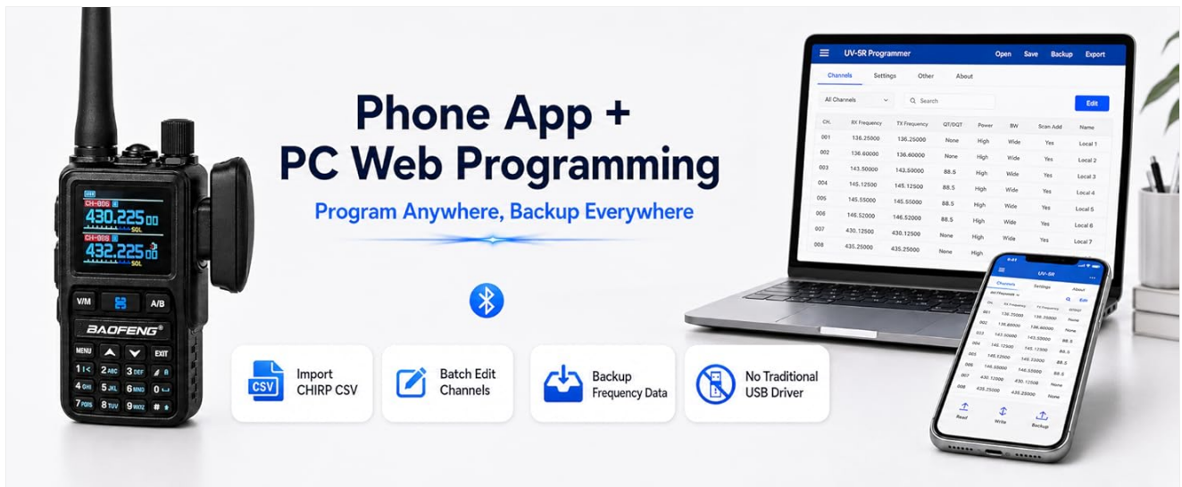
Image: Programming your radio by phone using the Ola Radio app to read, write, and backup channels.