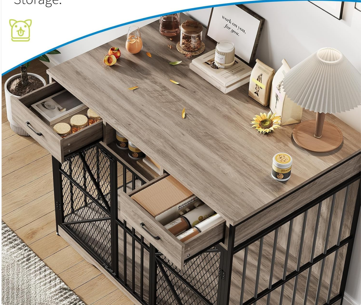
Figure 4: The spacious tabletop and storage drawers provide convenient space for pet supplies and other items.