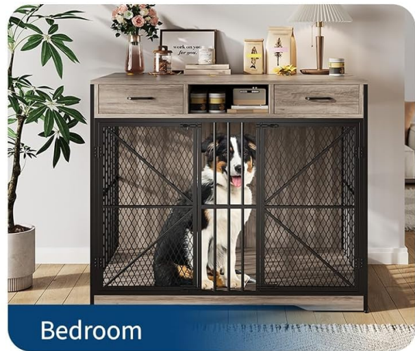
Figure 5: The dog crate furniture integrated into a living room, providing a comfortable space for a pet.