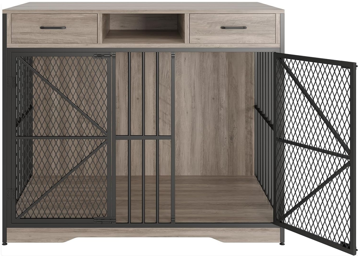
Figure 3: The crate with both doors open, illustrating the double-door design for easy access.