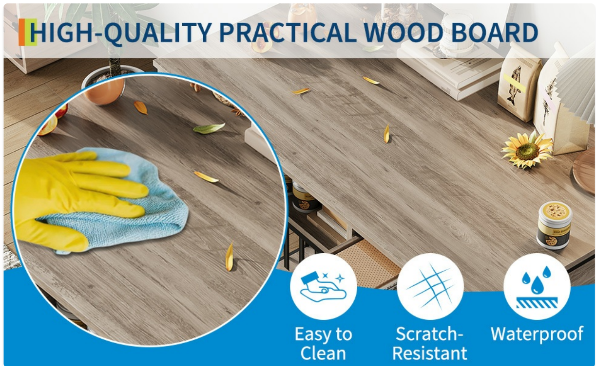
Figure 6: The wooden surfaces are designed for easy cleaning with a soft cloth.