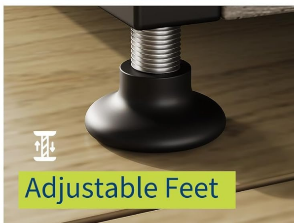
Figure 7: Details of the secure door latch and adjustable feet, important for stability and door alignment.