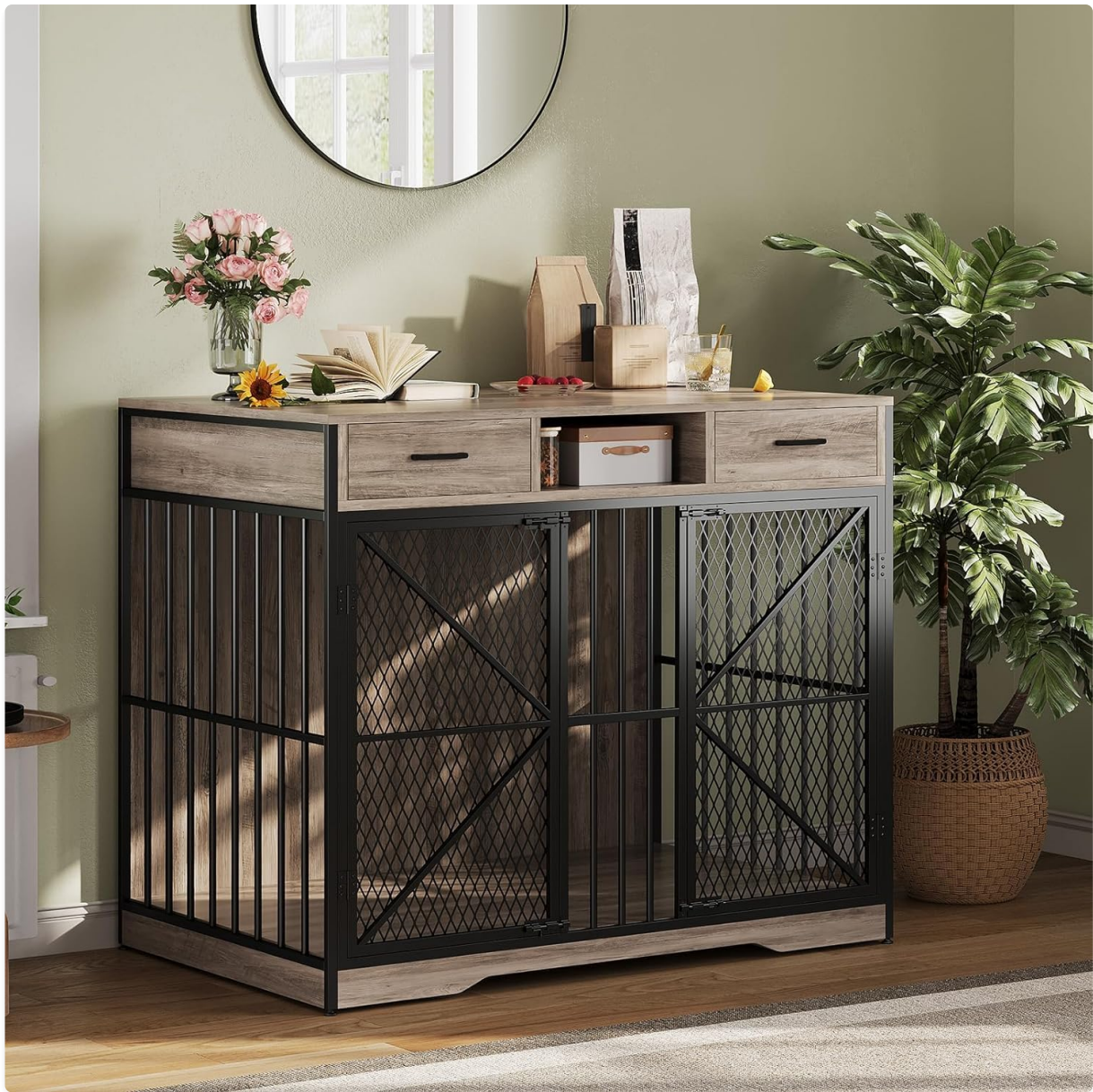
Figure 1: The IDEALHOUSE 44 Inch Wooden Dog Crate Furniture.