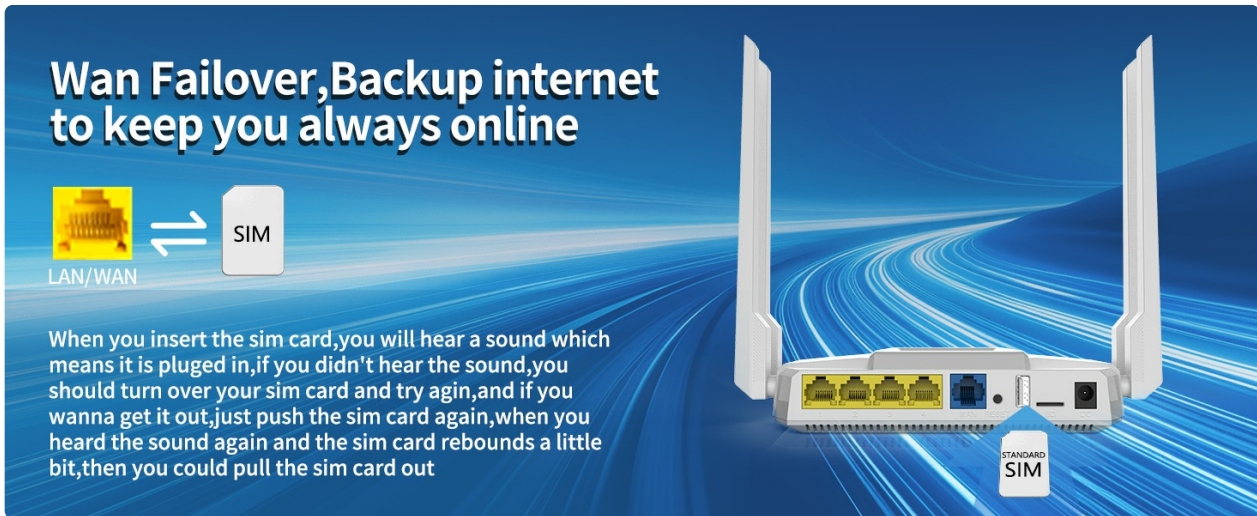
Illustration of the WAN Failover feature, where the router switches from a wired WAN connection to the 4G LTE SIM card for uninterrupted internet.

The router can be configured to use the 4G LTE connection as a backup internet source if the primary WAN (Ethernet) connection fails. This ensures continuous internet access.