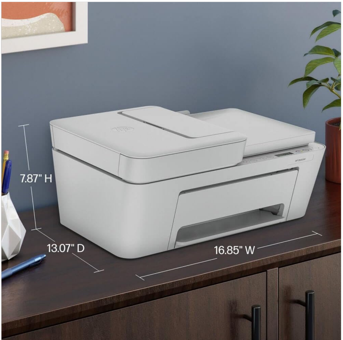
Figure 4: Printer Dimensions. This image provides a visual representation of the HP DJ4227e printer's approximate dimensions for placement planning.