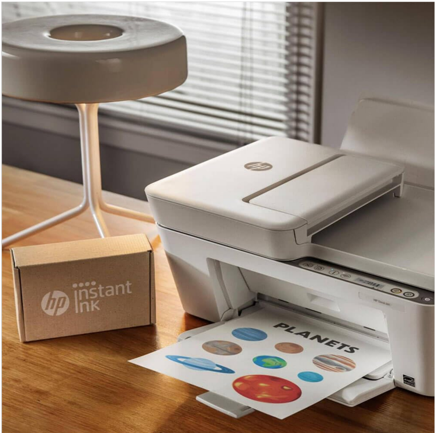
Figure 3: HP Instant Ink Service. This image shows an HP Instant Ink box, indicating the availability of a subscription service for automatic ink delivery, next to the printer in operation.