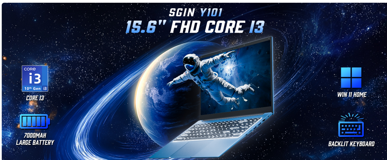
Image: SGIN Y101 Laptop highlighting its Core i3 processor, Windows 11, 7000mAh battery, backlit keyboard, WiFi 6, 180-degree hinge, 16GB RAM, and 1024GB SSD.

The SGIN Y101 is a 15.6-inch laptop designed for everyday computing tasks, featuring a Core i3 processor, 16GB RAM, and a 1024GB SSD. It operates on Windows 11 Home and includes a backlit keyboard, WiFi 6 connectivity, and a 180-degree hinge for flexible use.