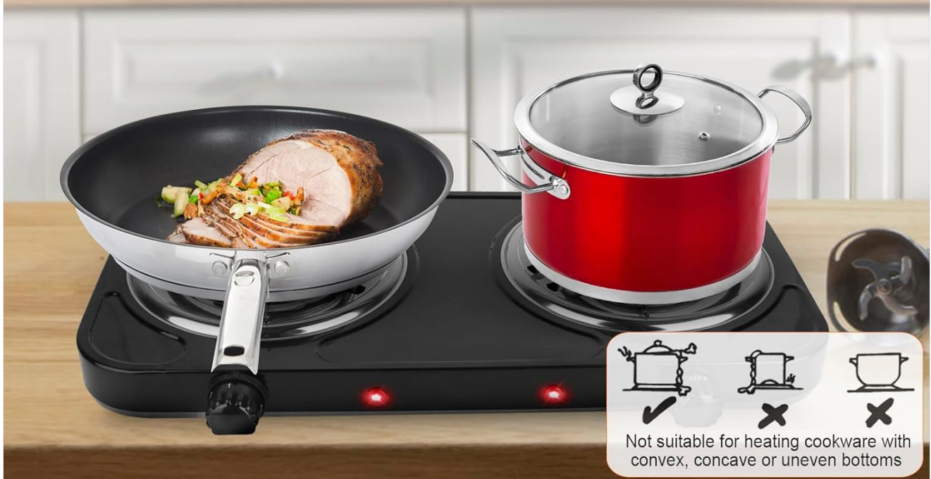
Figure 4.2: Examples of compatible cookware for the hot plate.