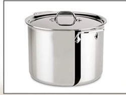
Stainless Steel Pot