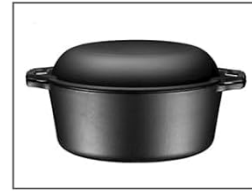
Cast Iron Pan