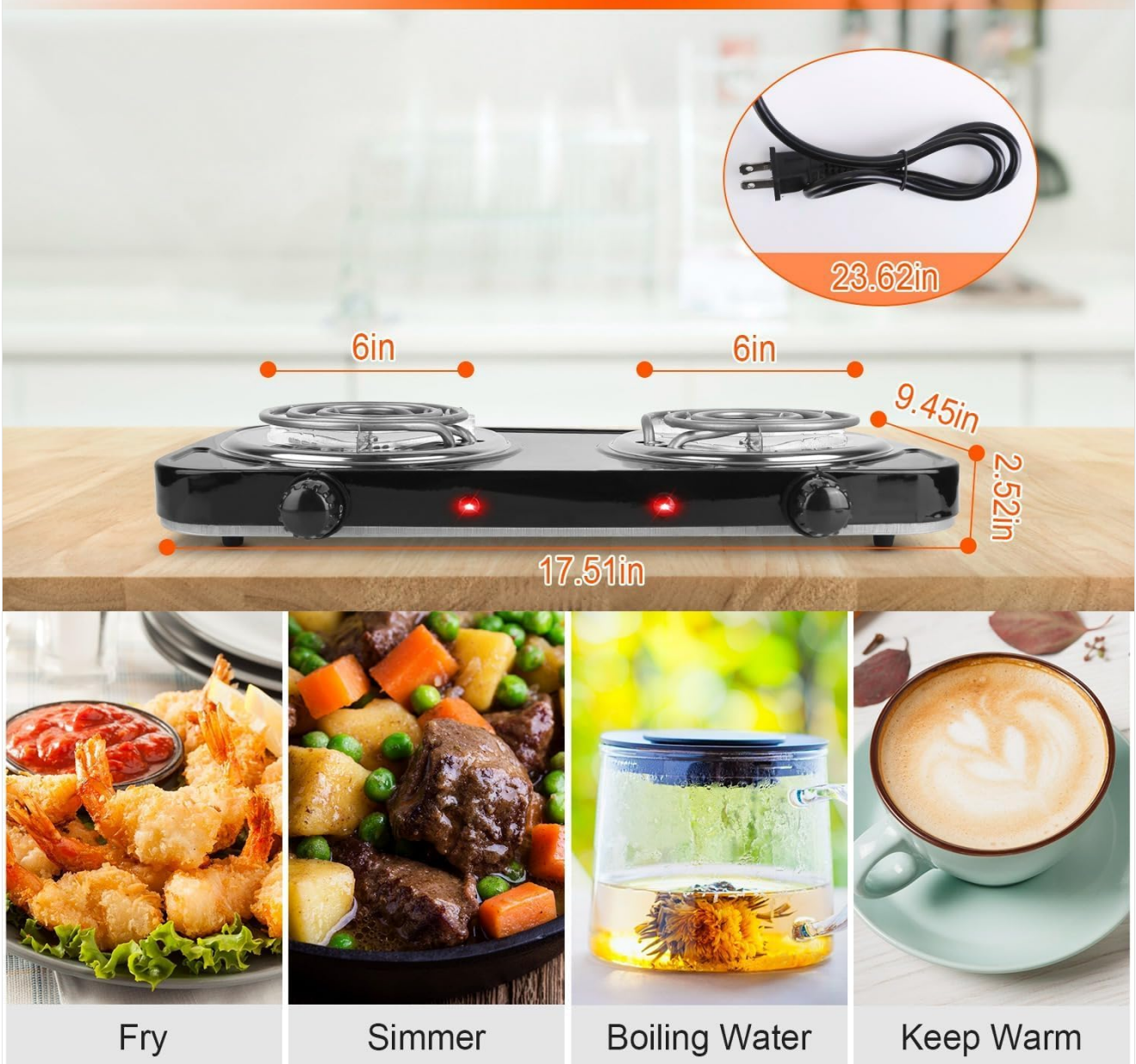
Figure 7.1: Product dimensions and versatile cooking applications.