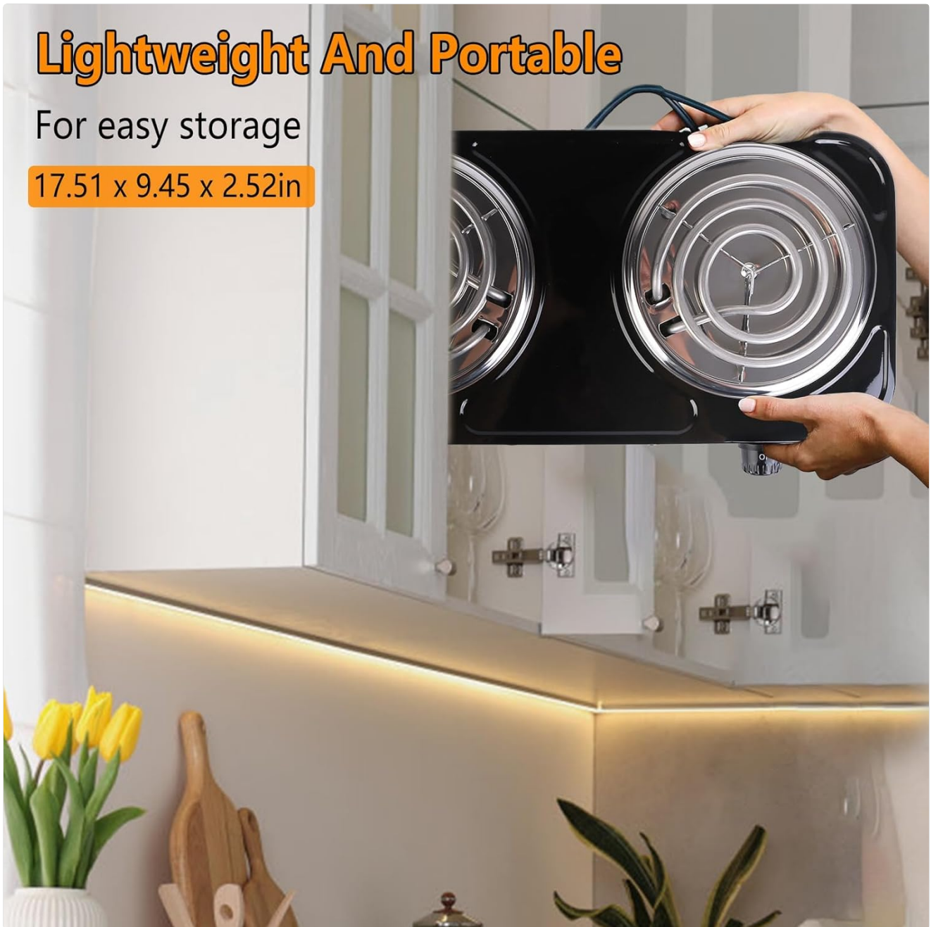
Figure 3.1: The compact design allows for easy storage in small spaces.