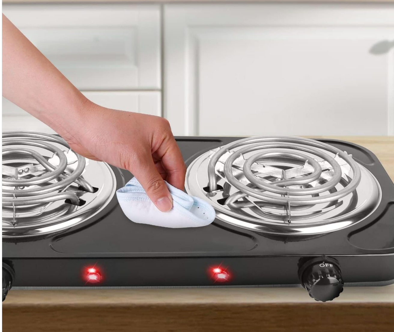
Figure 5.1: Cleaning the hot plate with a damp cloth.

Simply wipe with a damp sponge or wet cloth for easy cleaning after cooling down completely. When the hot plate is not in use, be sure to slide the switch to the "off" position and unplug the plug.