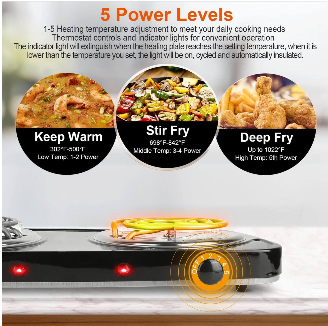
Figure 4.1: 5 Power Levels and their recommended uses.

The red indicator light will illuminate when the burner is actively heating. It will extinguish once the set temperature is reached and cycle on and off to maintain the desired heat level.