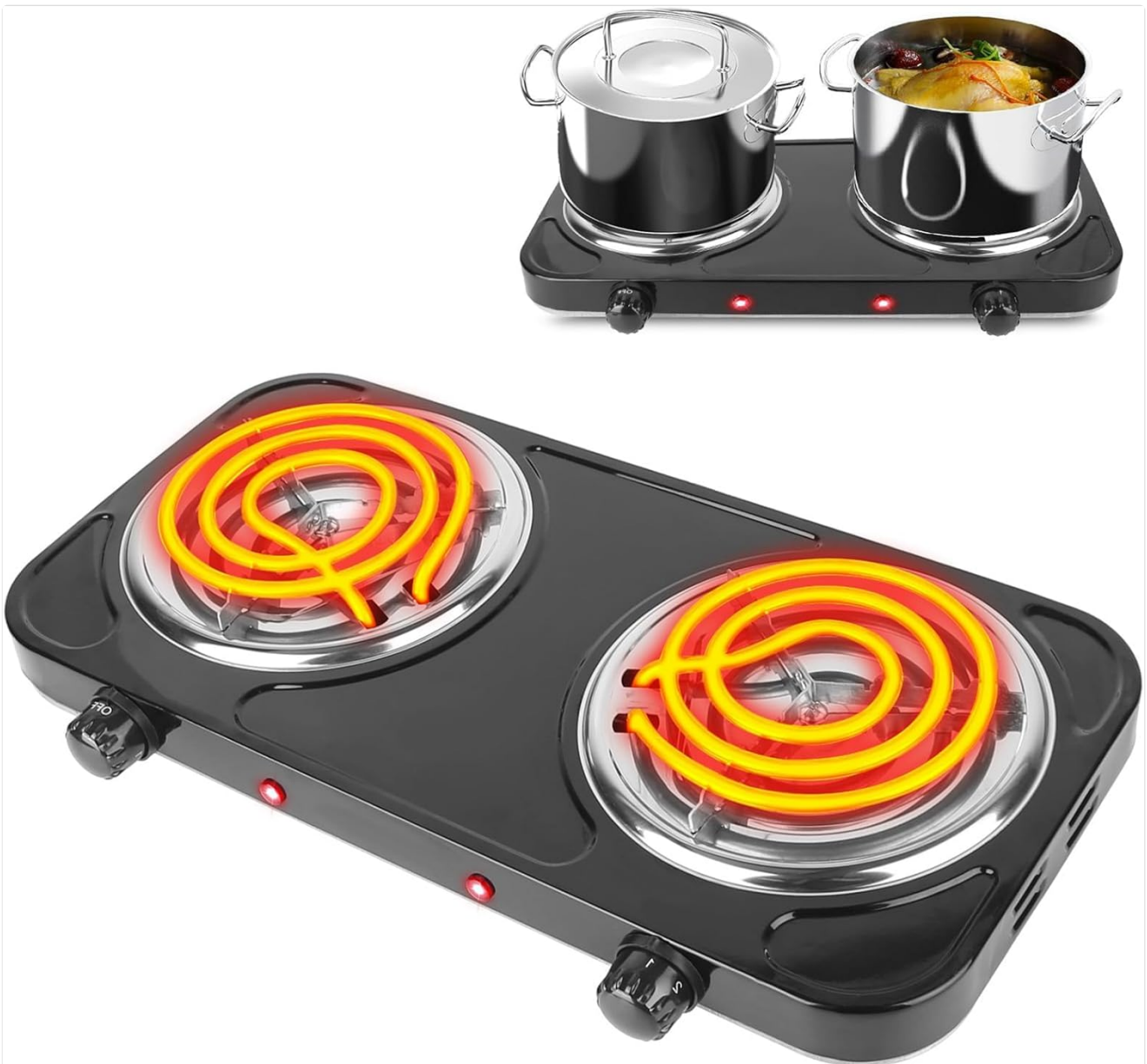
Figure 2.1: TeqHome 2000W Portable Electric Double Coil Hot Plate.