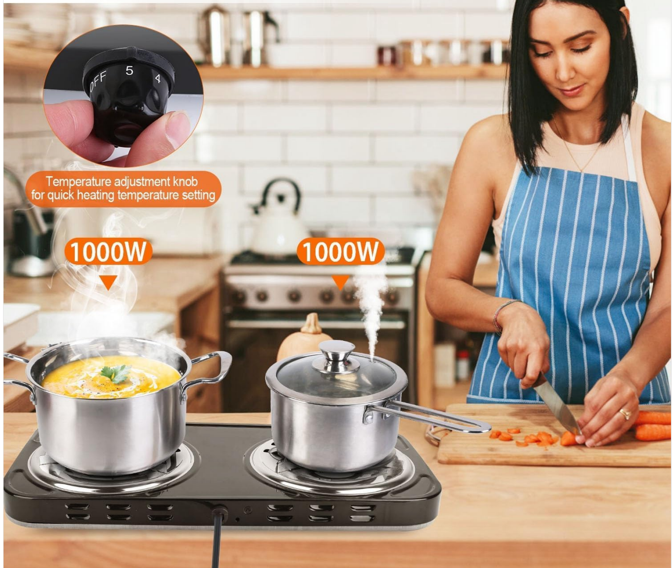
Figure 4.3: Hot plate in use with various cooking tasks.

Powered by 1000W per plate, heat up fast and efficiently Dual plates allow you to use both sides simultaneously