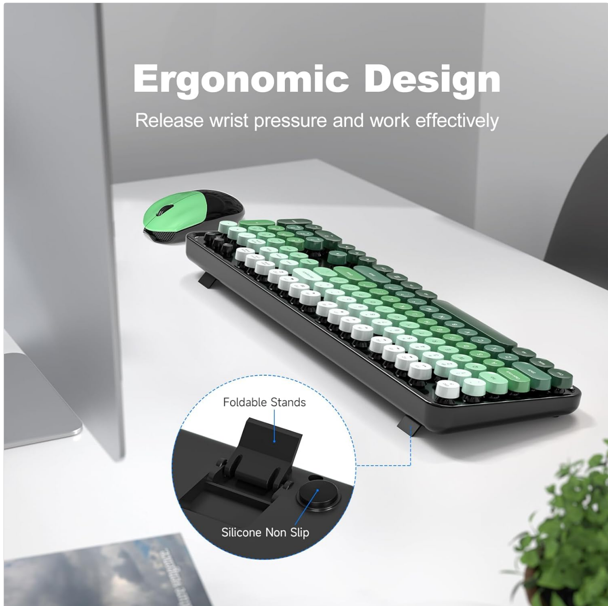
Image: The MOFII Wireless Keyboard showcasing its ergonomic design with foldable stands and silicone non-slip pads, designed to release wrist pressure.