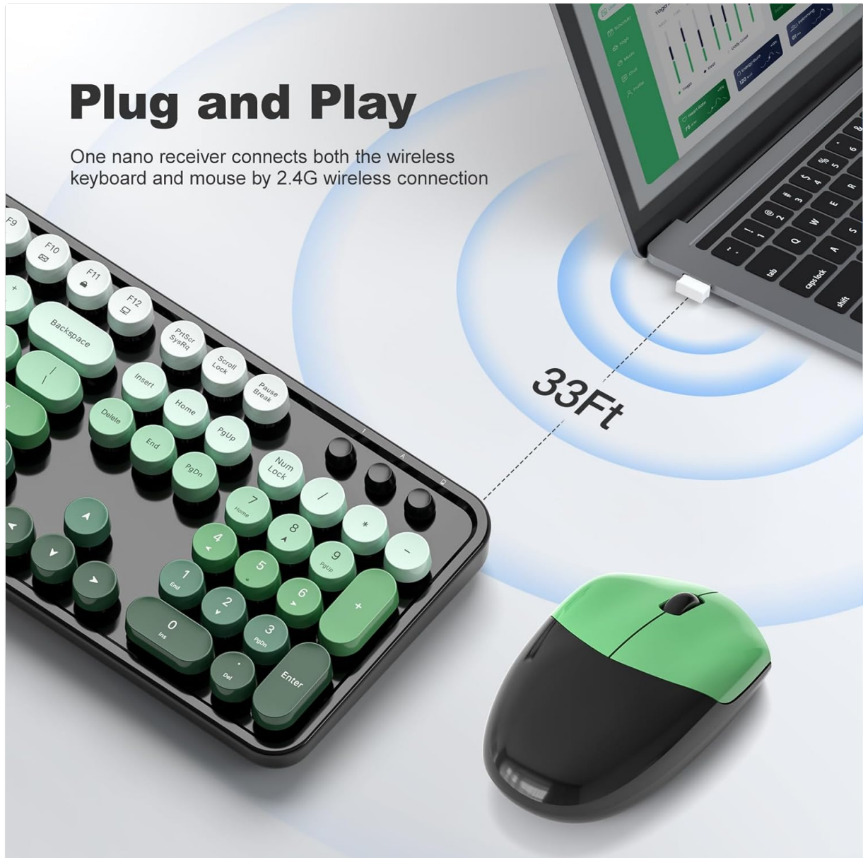
Image: The MOFII Wireless Keyboard and Mouse Combo demonstrating its 2.4G plug-and-play connection with a laptop via a USB nano receiver, showing a range of up to 33 feet.