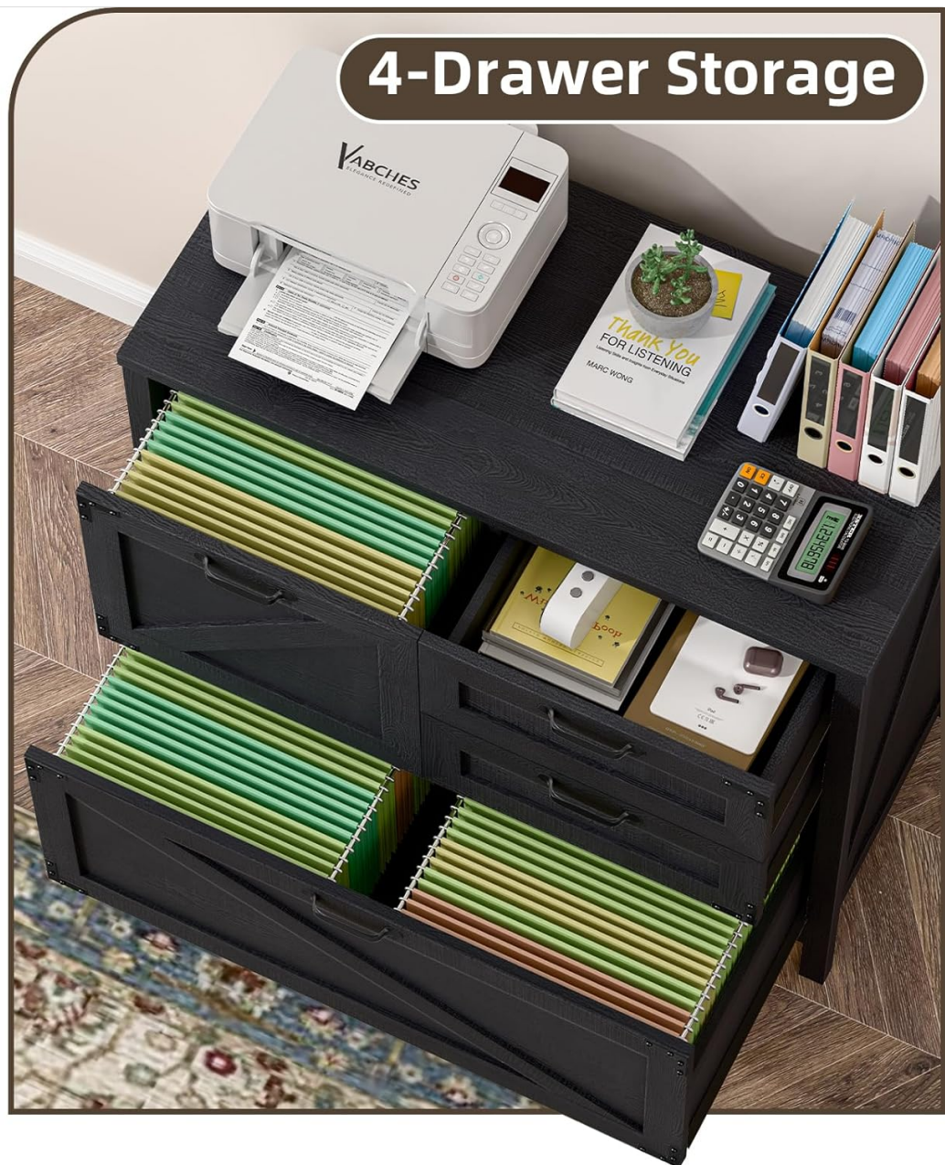
Figure 5: Visual representation of the cabinet's versatile storage for various items.