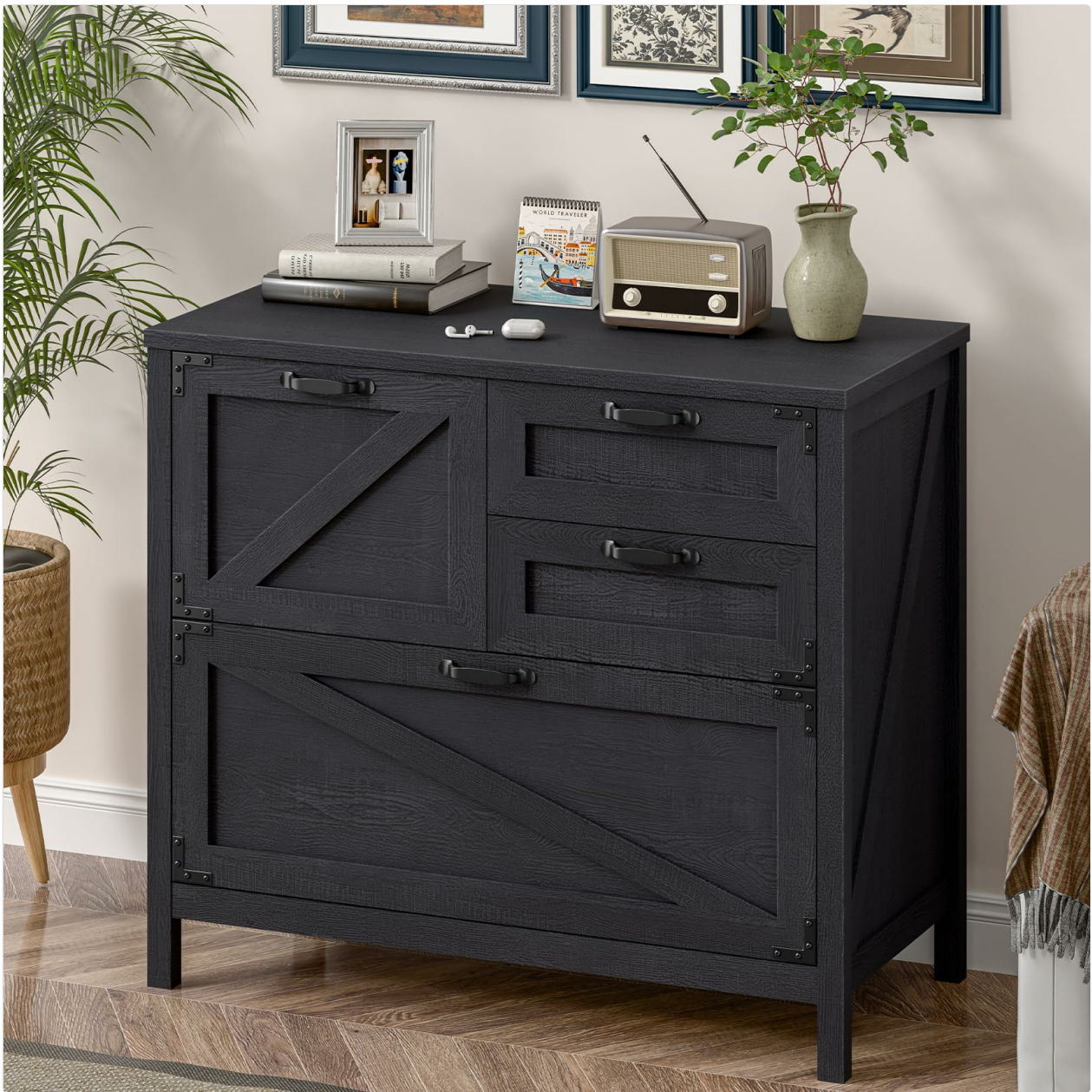
Figure 2: Fully assembled Befrases Farmhouse Lateral File Cabinet in Rustic Black.