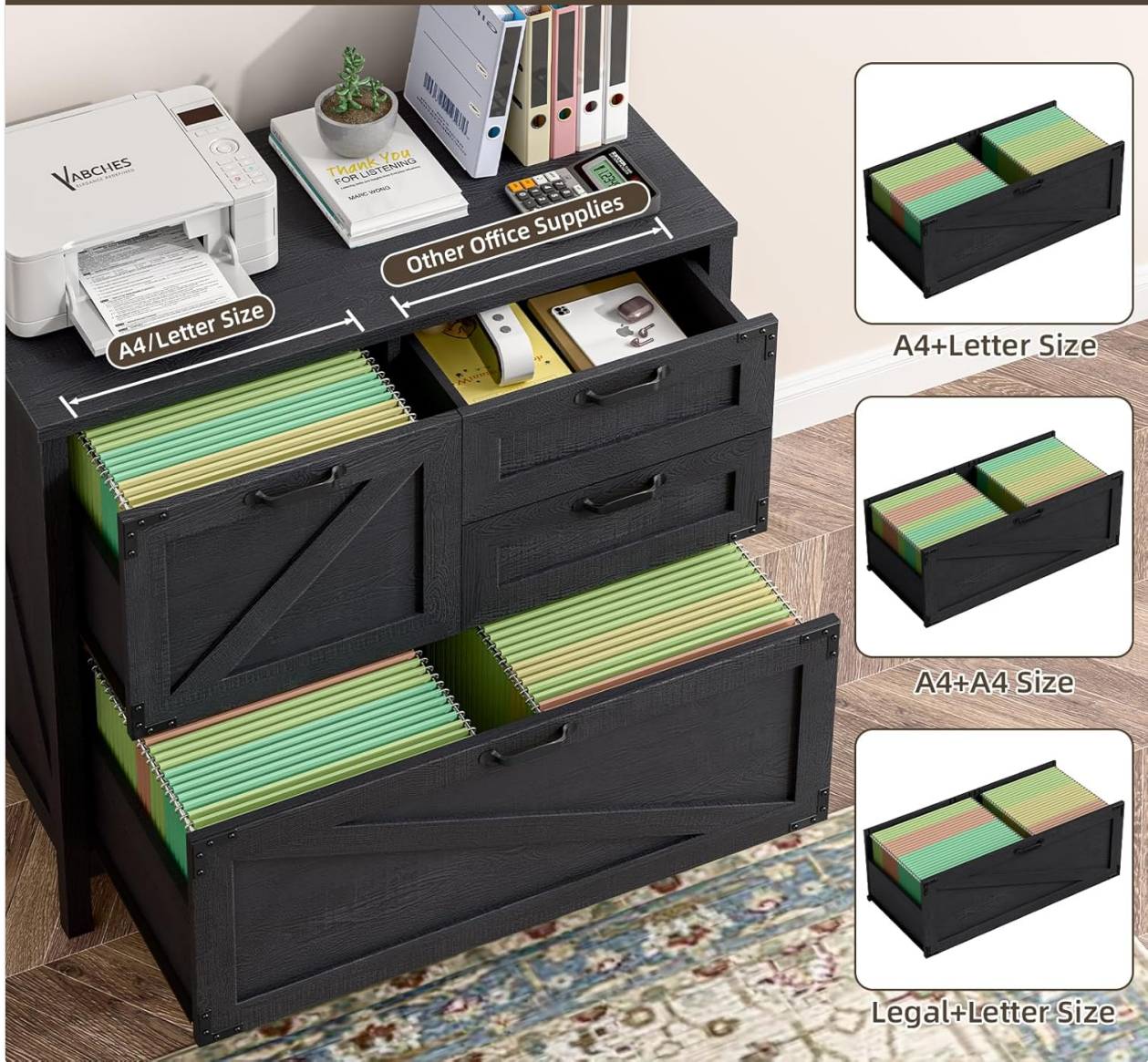
Figure 4: Cabinet used as a printer stand with files and office supplies stored within.