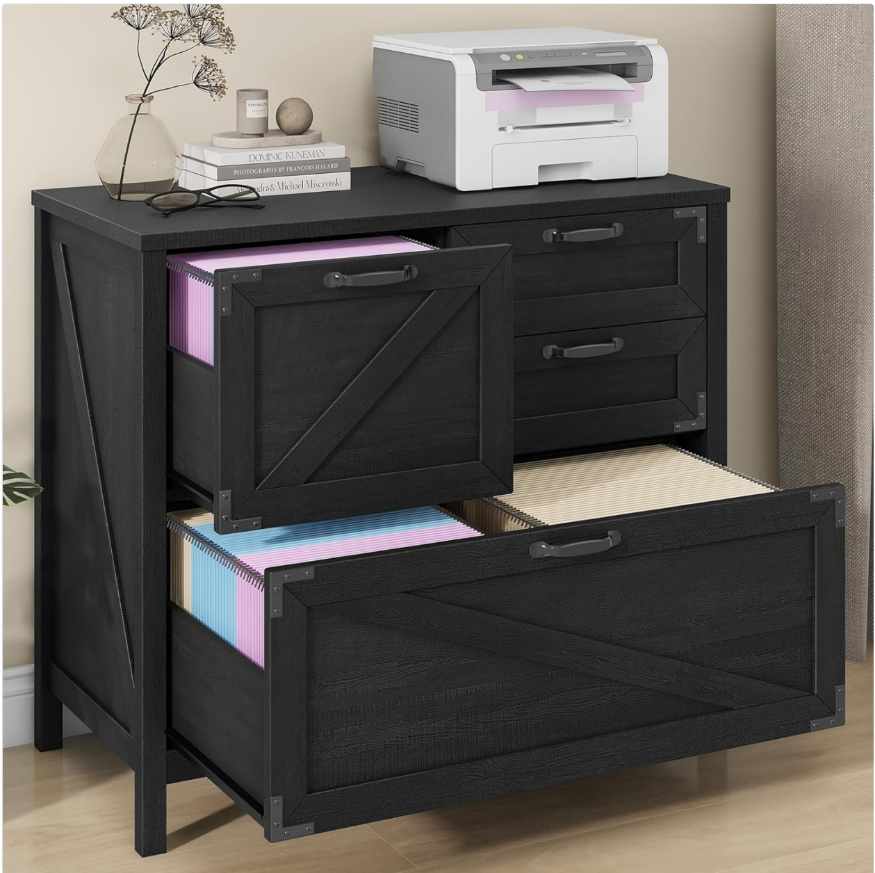
Figure 3: Open drawers demonstrating file organization for letter and A4 sizes.