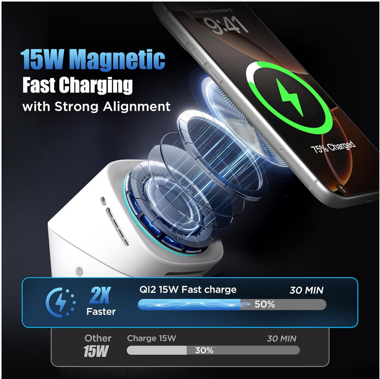
Image Description: An iPhone magnetically attached to the charging station, displaying the charging animation and indicating 15W fast charging.