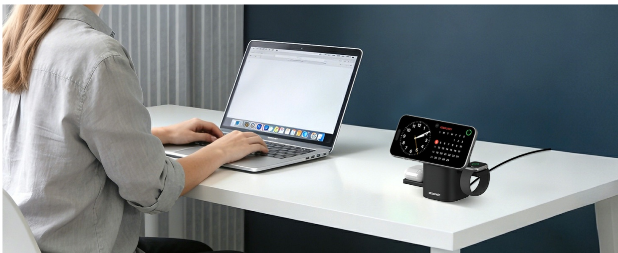
Image Description: The RESSONIC 3-in-1 Wireless Charging Station with its soft night light illuminated, positioned on a

The charging station features a soft night light integrated into its design. Press the dedicated button on the base to turn the light on or off. This provides gentle illumination without disturbing sleep.