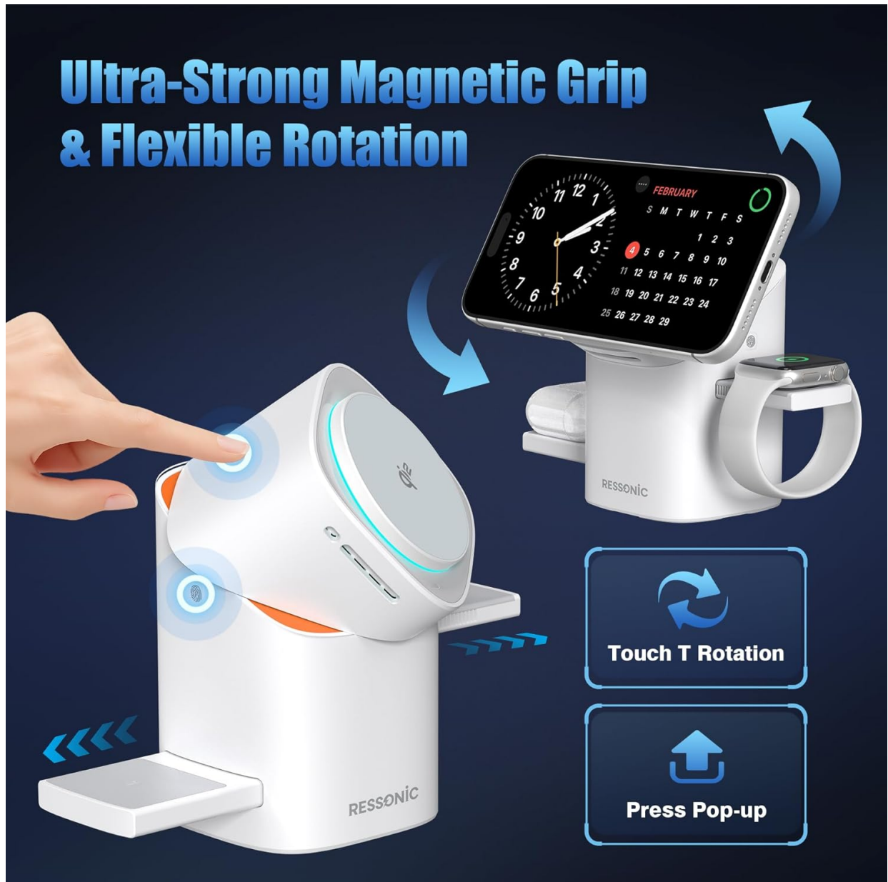
Image Description: The RESSONIC 3-in-1 Wireless Charging Station demonstrating its flexible rotation and foldable design for various viewing orientations, with an iPhone attached.

The charging station has a foldable structure for easy portability and storage. The magnetic charging pad can be rotated to support both vertical and horizontal MagSafe charging, allowing for flexible viewing angles for your iPhone.