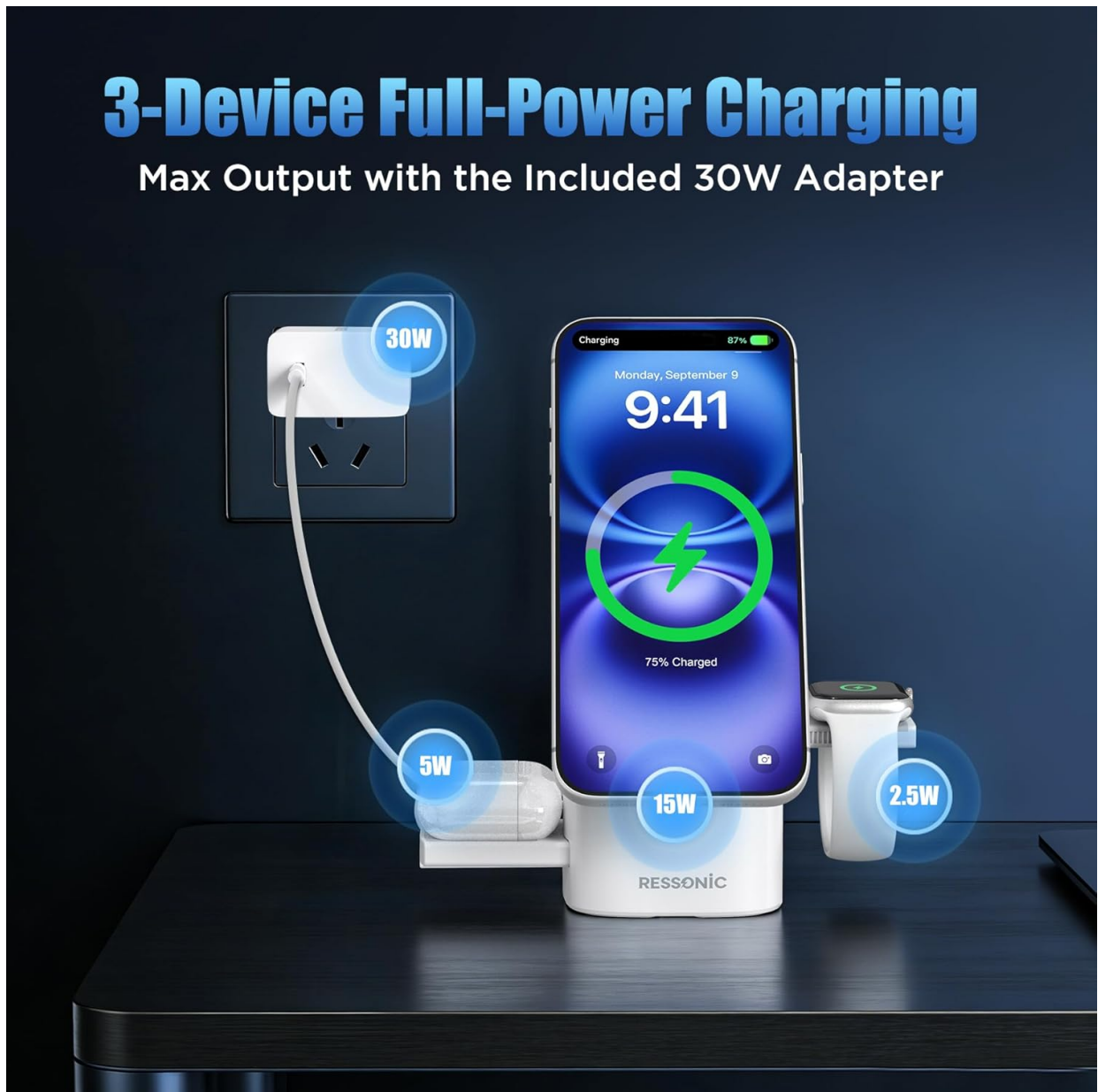
Image Description: The RESSONIC 3-in-1 Wireless Charging Station connected to a power outlet via its Type-C cable and 30W adapter, with devices charging.

Connect the provided Type-C cable to the charging station's input port and the 30W adapter. Plug the adapter securely into a standard wall power outlet.