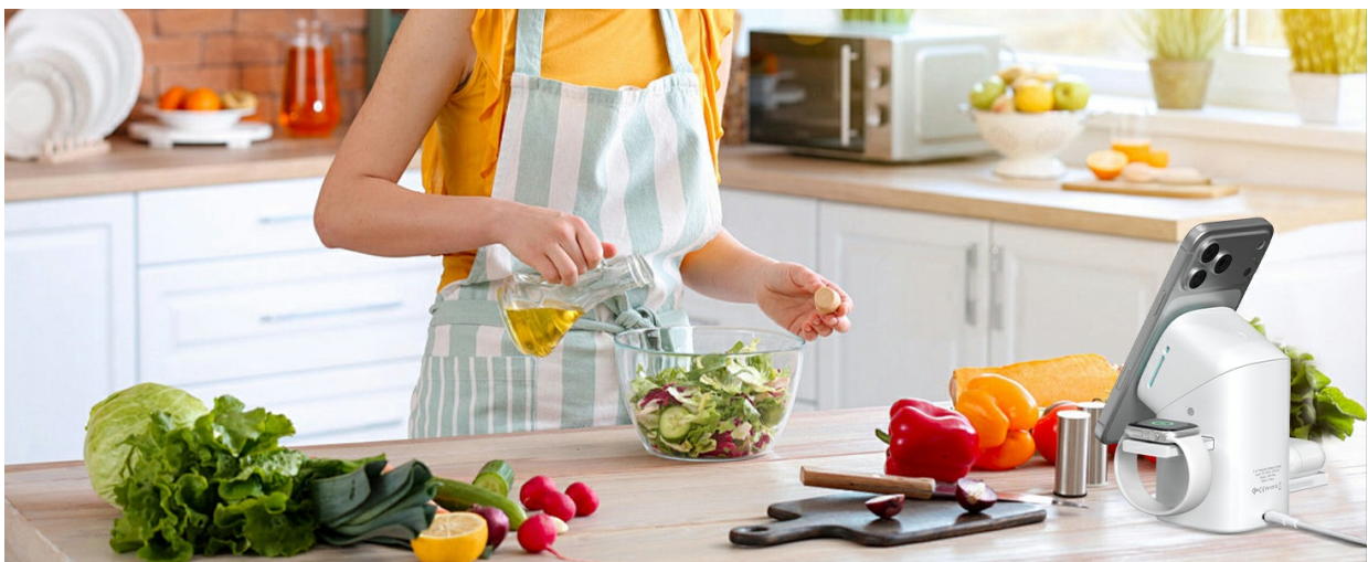
Image Description: The RESSONIC 3-in-1 Wireless Charging Station, 30W adapter, Type-C cable, and magnetic metal ring laid out as included in the package.