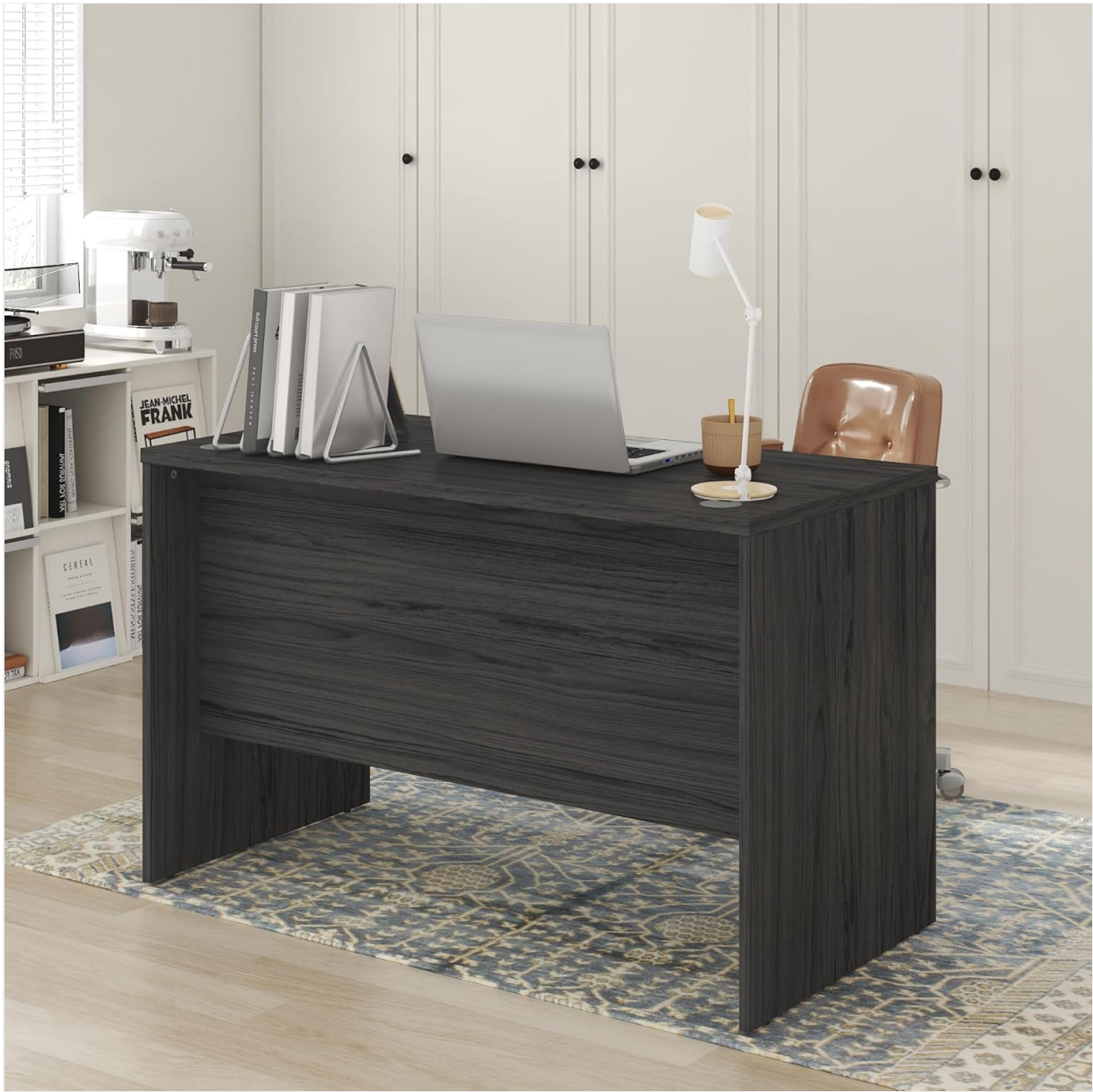
Image: The Furinno Roger 47-inch Computer Desk in Coastal Grey, shown with a laptop and accessories.