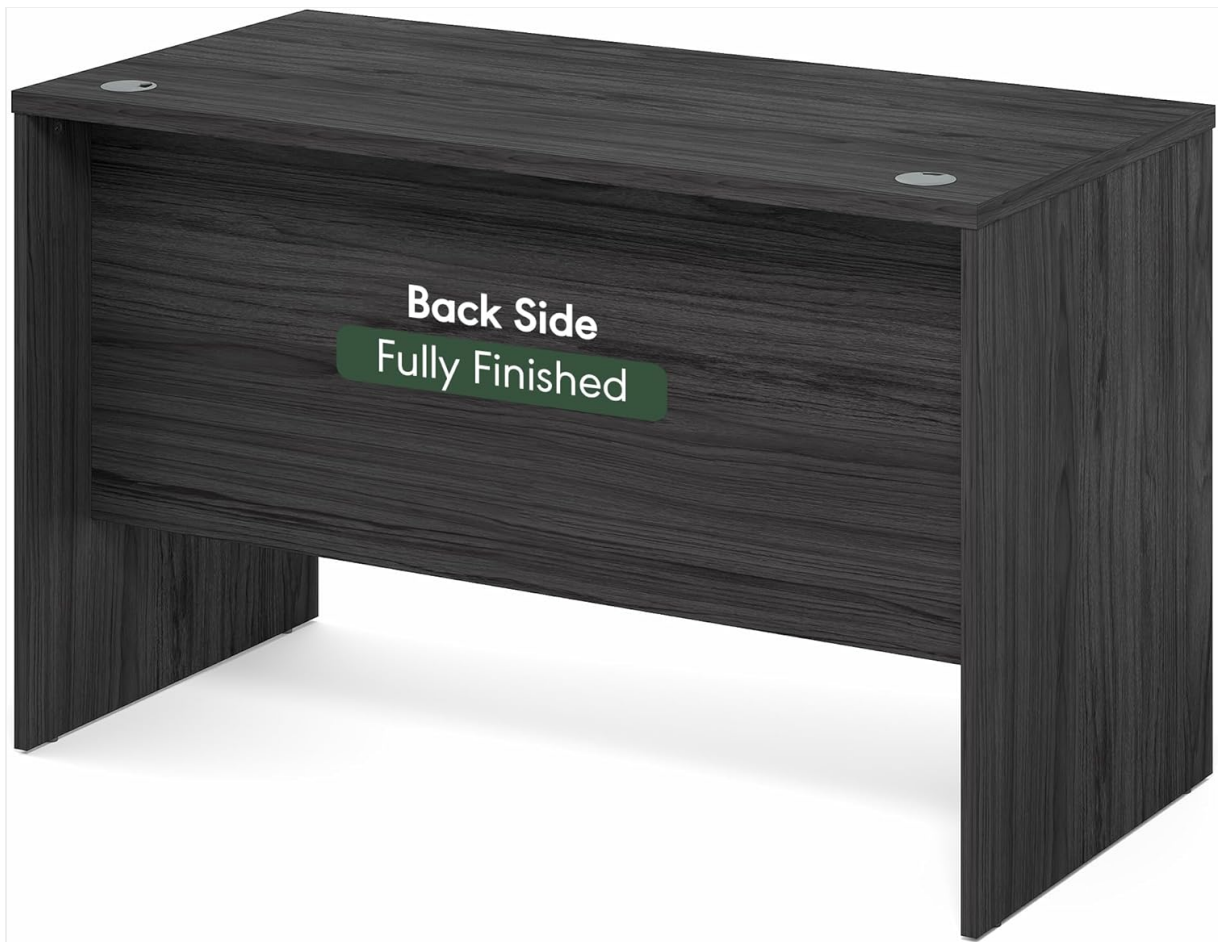
Image: Rear view of the desk, highlighting the fully finished back panel for versatile room placement.