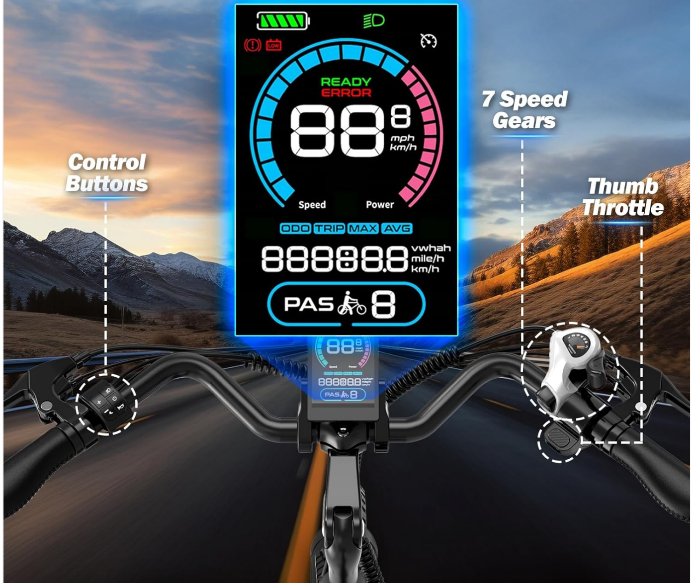
Image: The upgraded intelligent LCD display, showing speed, power, ODO, trip, and PAS mode, along with control buttons and thumb throttle.