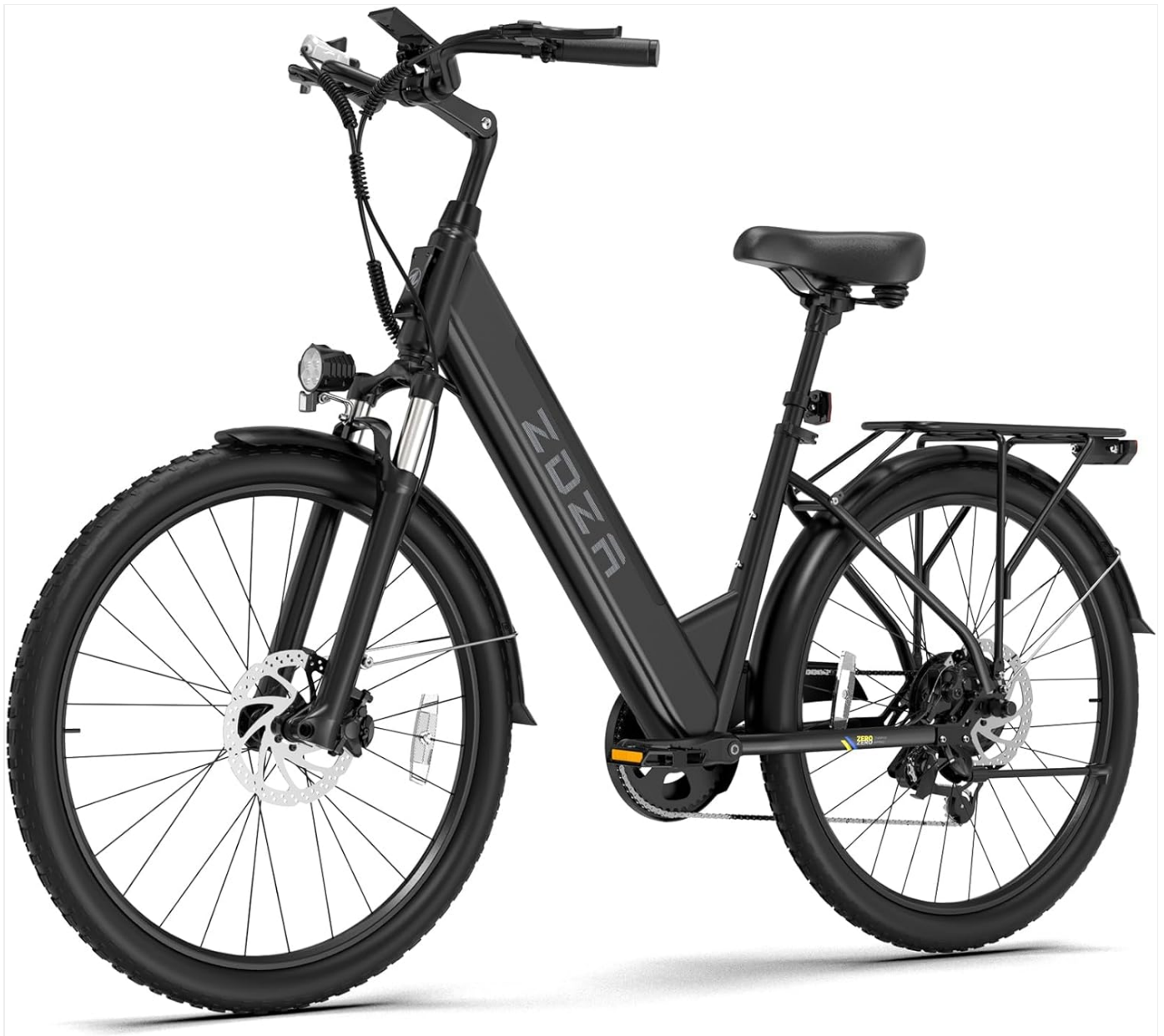
Image: The ZDZA ZA02 Electric Bike, a 26-inch model with a step-through frame, front suspension, and rear rack.