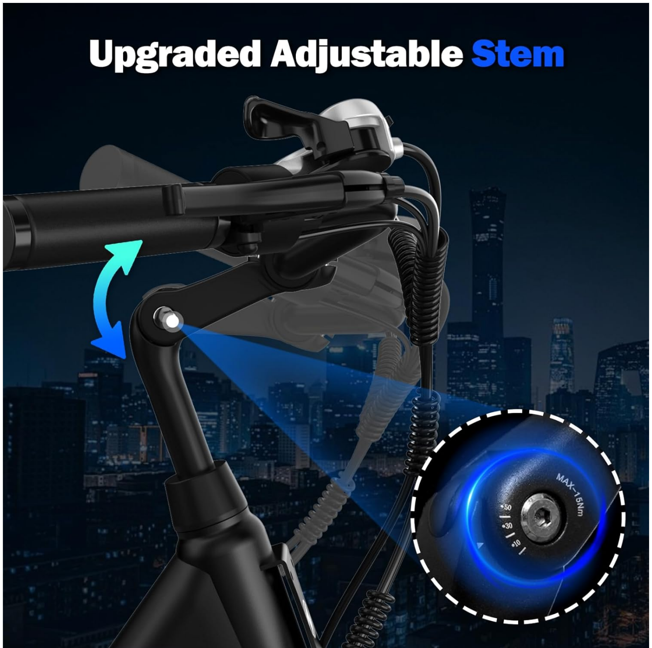
Image: Close-up of the adjustable stem, showing the mechanism for tailoring riding posture.