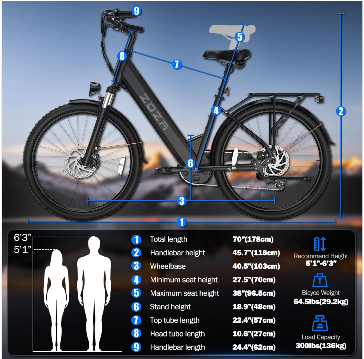
Image: Detailed diagram showing the dimensions of the ZDZA ZA02 Electric Bike, including total length, handlebar height, wheelbase, seat heights, and load capacity.