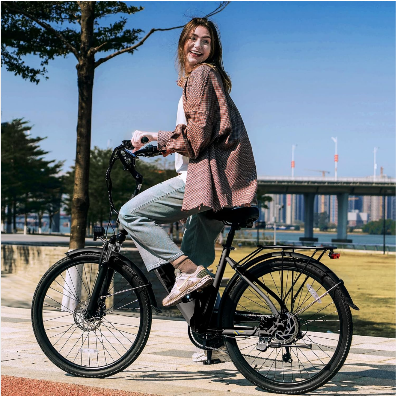
Image: The front wheel of the ZDZA ZA02 Electric Bike, highlighting the disc brake and front suspension.