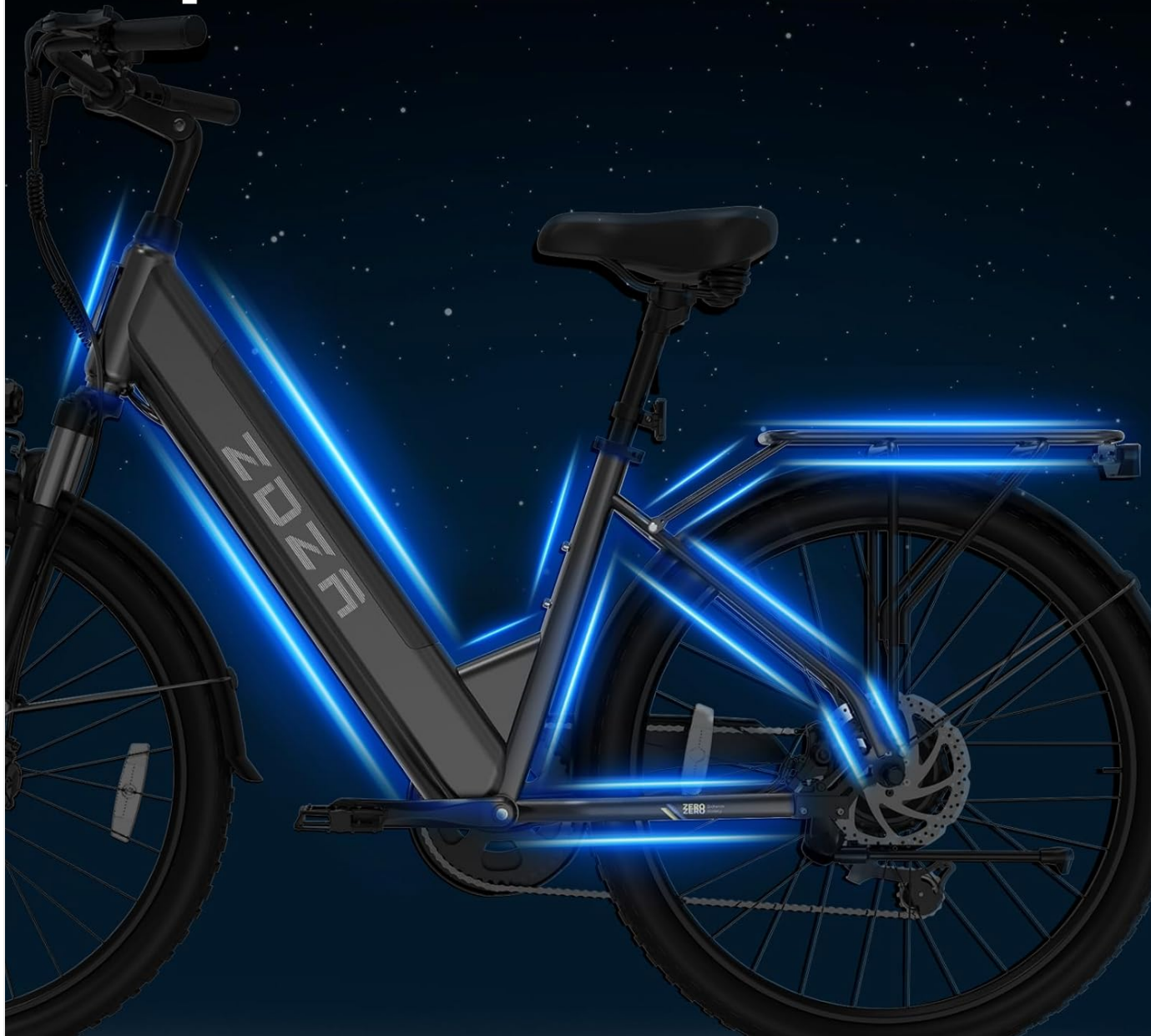
Image: The 26-inch puncture-resistant tires, shown suitable for snow, urban, mountain, and beach roads.