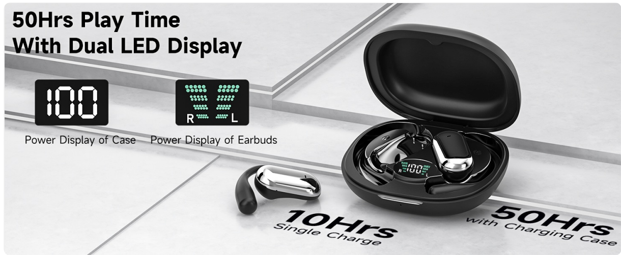
Image: Overview of the EUQQ Q16S Open Ear Headphones, including the earbuds, charging case, and charging cable.