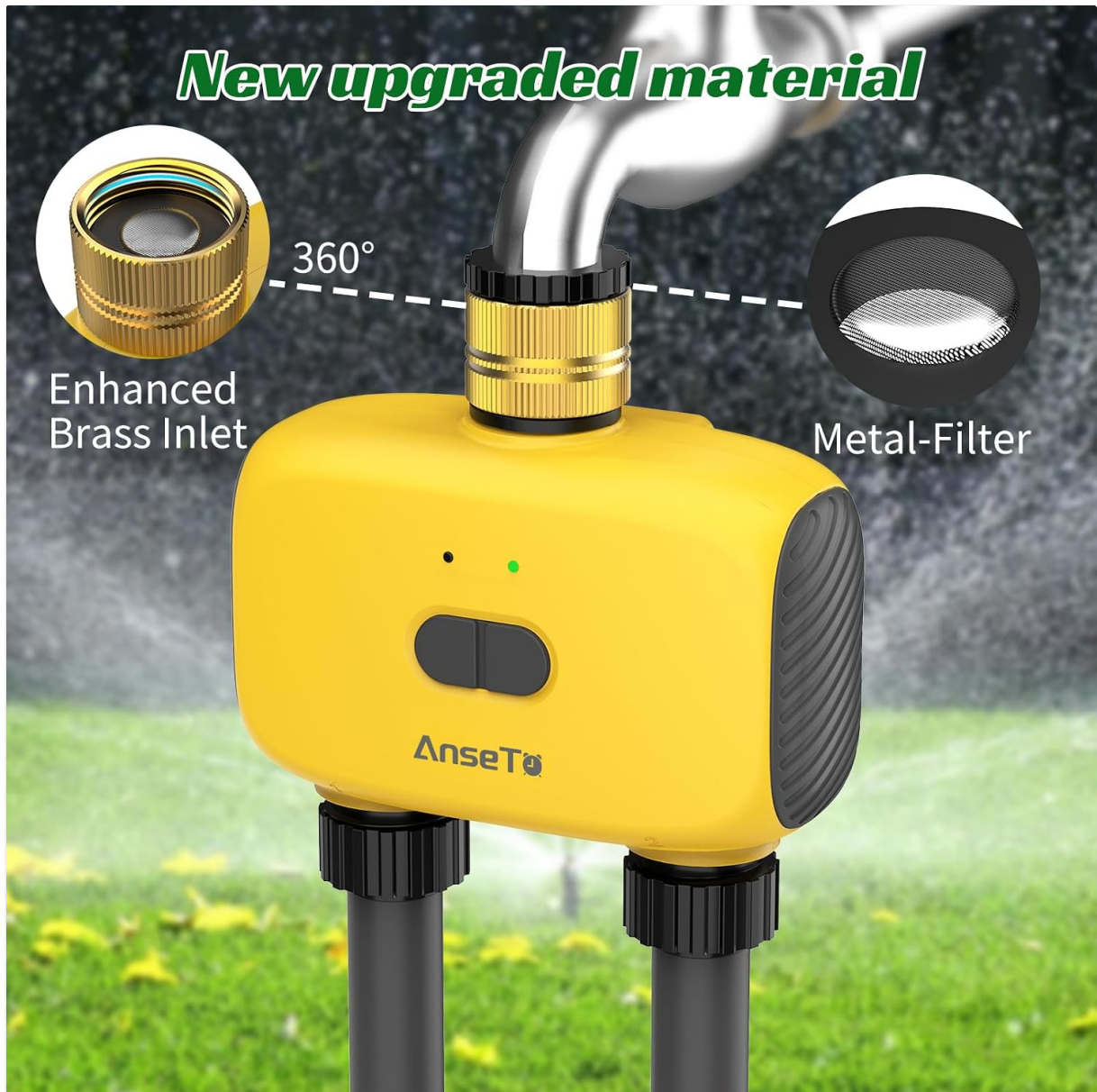
Image: Detail of the brass inlet and integrated metal filter for the AnseTo Sprinkler Timer.

Attach the sprinkler timer to your outdoor hose faucet. The device features an enhanced brass inlet for a secure and durable connection. Ensure the connection is tight to prevent leaks.