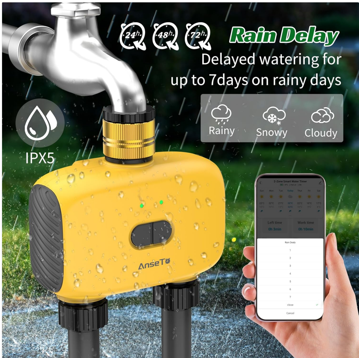
Image: The rain delay feature interface in the Smart Life app, showing options for delaying watering.