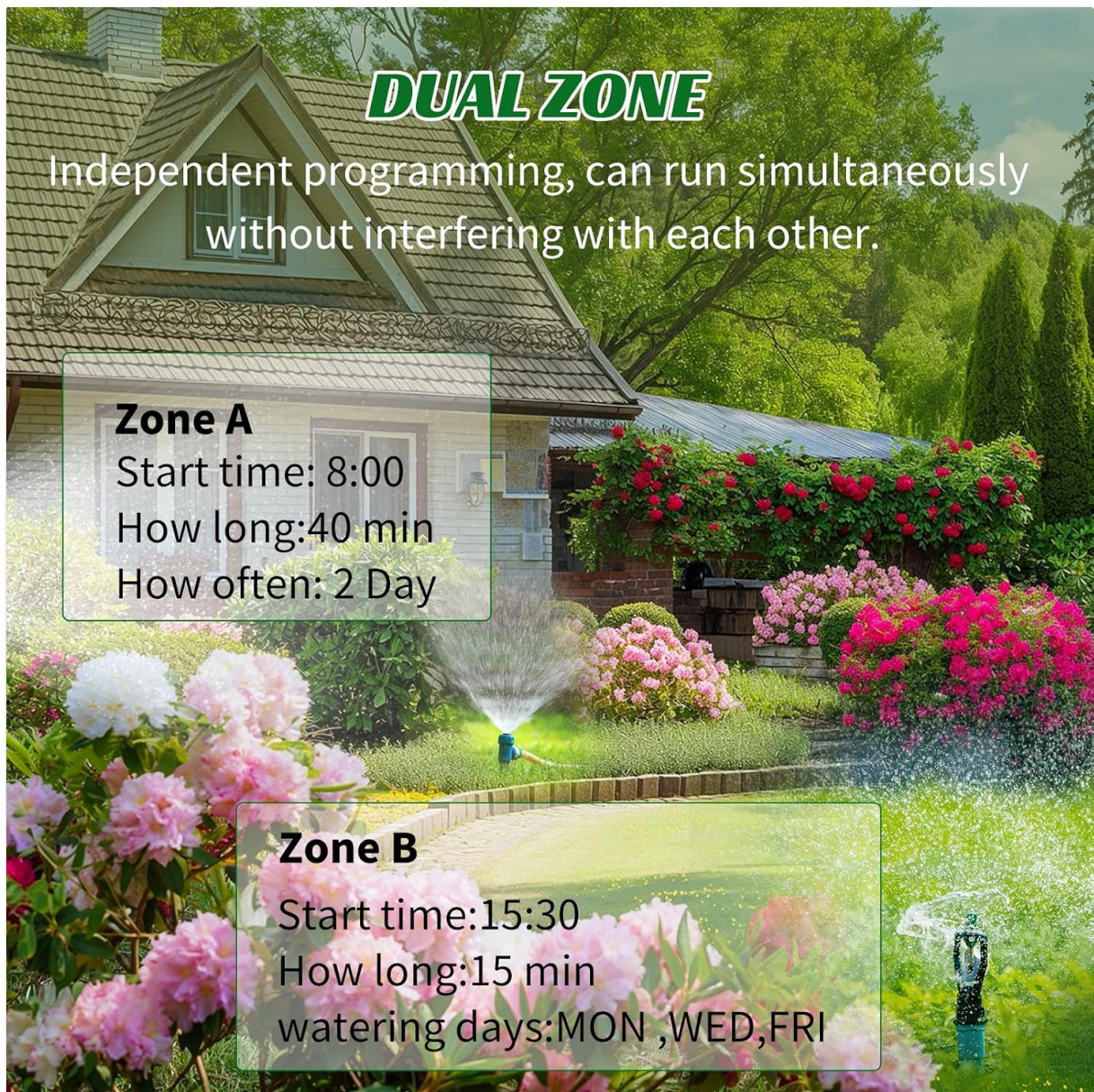
Image: Illustration of the dual-zone capability, showing independent programming for Zone A and Zone B.