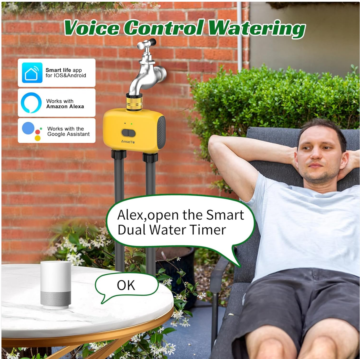
Image: Demonstrating voice control functionality with a smart speaker and the AnseTo Sprinkler Timer.