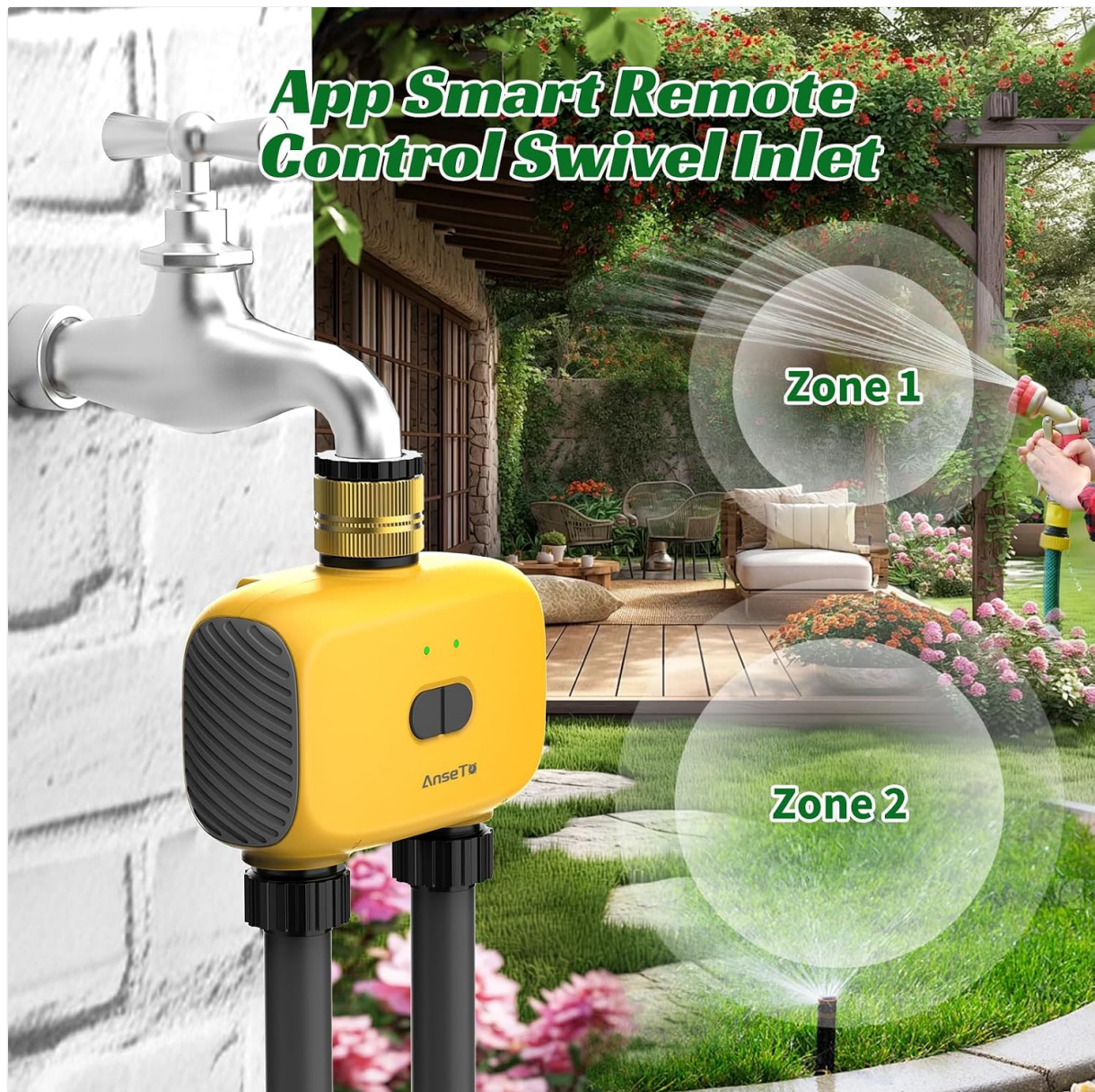
Image: AnseTo WiFi Sprinkler Timer installed on a faucet, illustrating its dual-zone watering capability for a garden.