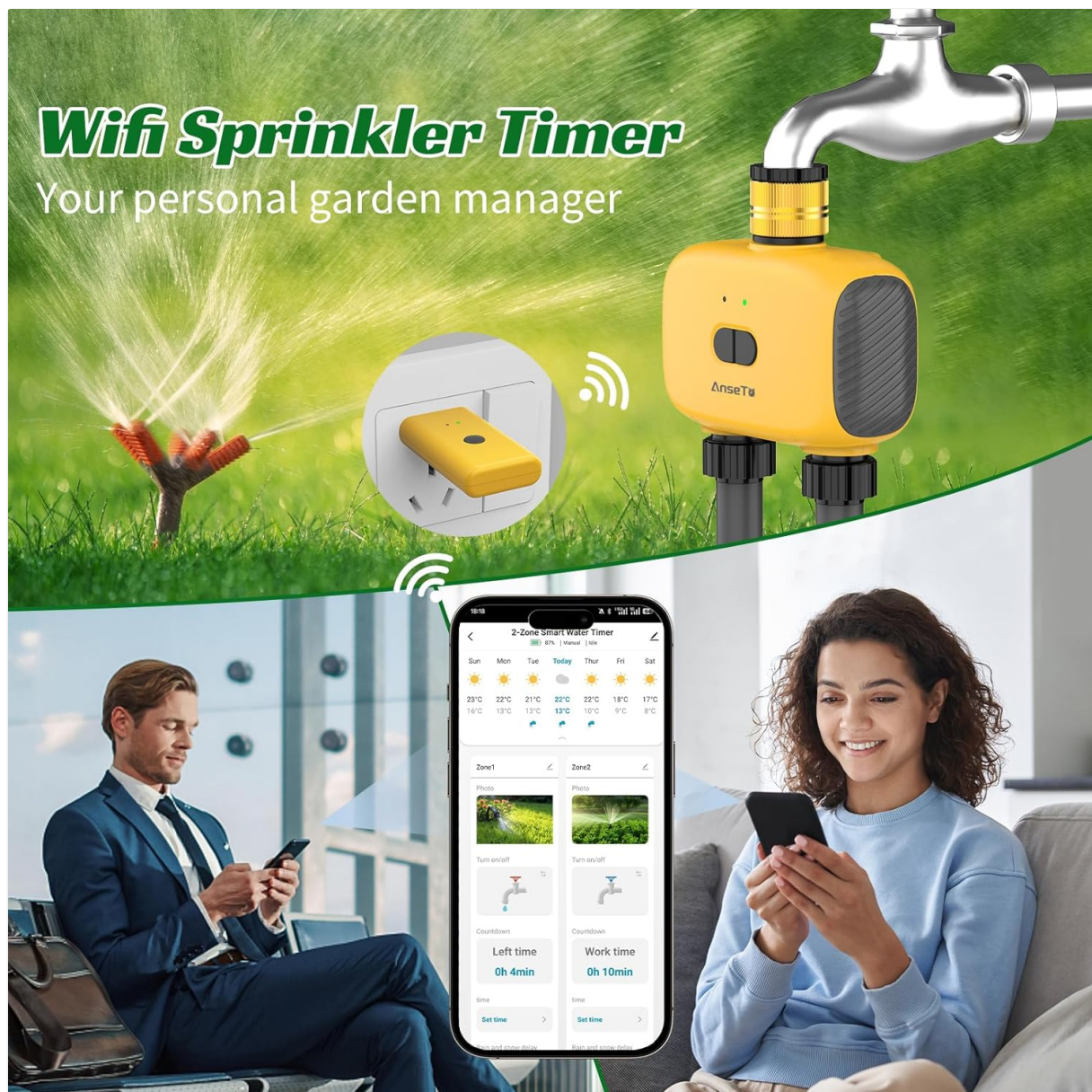
Image: The AnseTo WiFi Sprinkler Timer, its WiFi gateway, and the Smart Life app on a smartphone, demonstrating connectivity.

Your browser does not support the video tag.