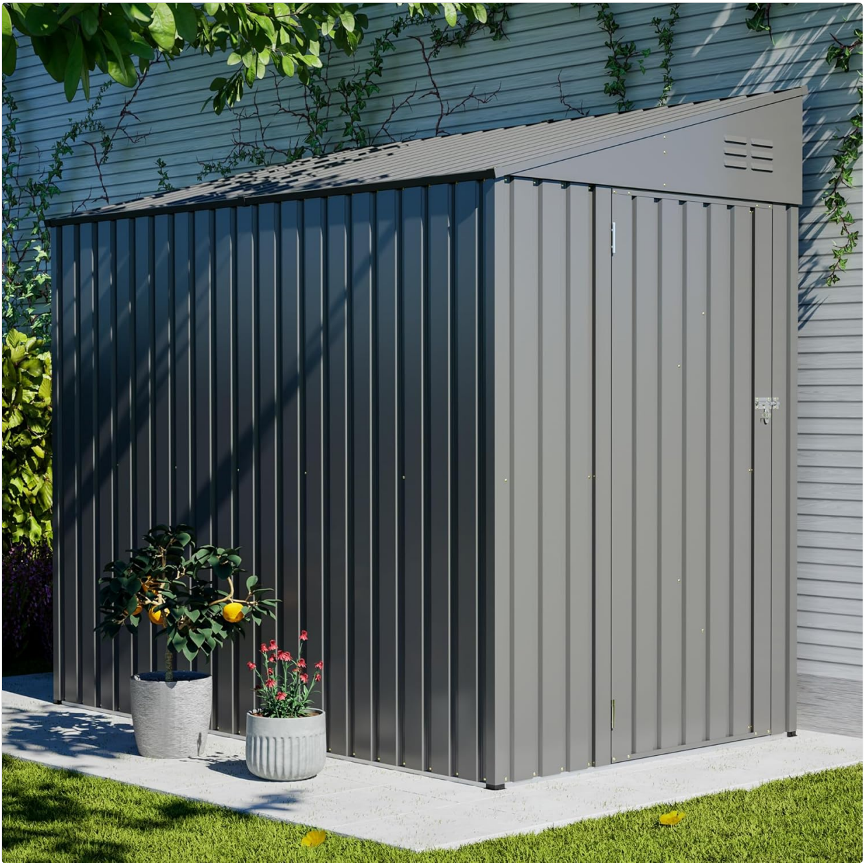
Image 1.1: YOPTO 4x7 FT Outdoor Storage Shed in a backyard setting.