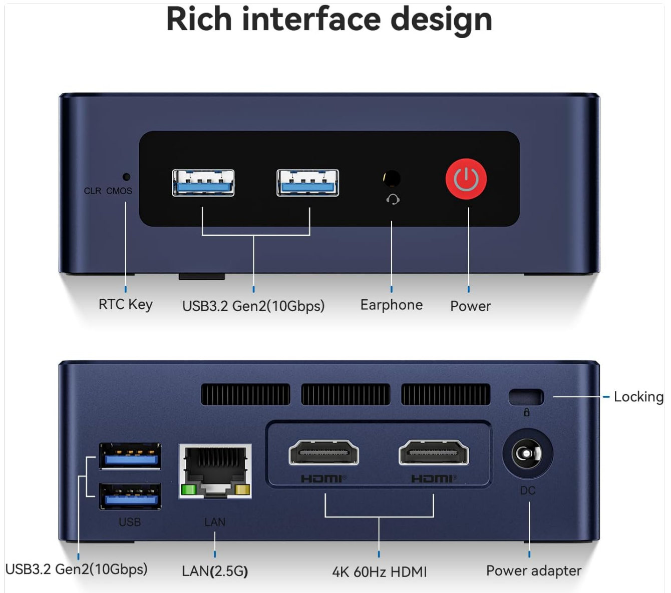
Figure 2: Front and Rear Interface Design of the Mini PC.

Upon unboxing, ensure all components are present. Connect your monitor(s), keyboard, mouse, and power adapter as shown below.