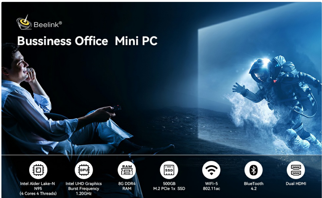
Figure 1: Key features of the Beelink MINI S12 Pro Mini PC.

The Beelink MINI S12 Pro Mini PC is a compact and powerful computing solution designed for various applications, from home entertainment to office productivity. Featuring the 12th Generation Intel N95 processor, it offers efficient performance in a small form factor.