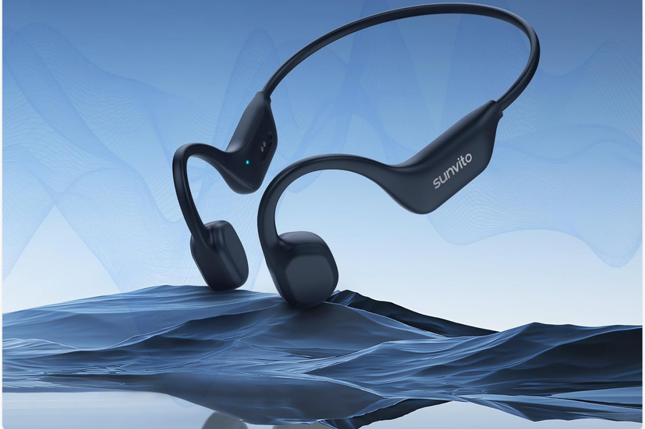
Image: The sunvito Bone Conduction Headphones X29, highlighting key features such as 25g super light design, Bluetooth 6.0 connectivity, clear sound, and IPX6 water resistance.