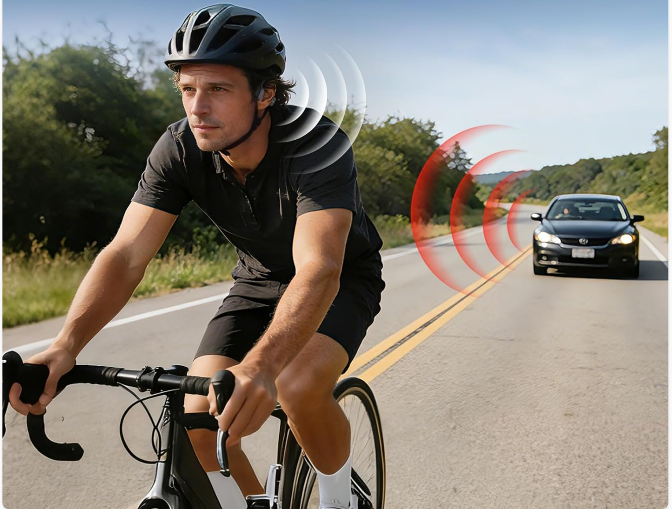
Image: Illustrates the open-ear design, allowing users to hear their surroundings for enhanced safety during activities like cycling.