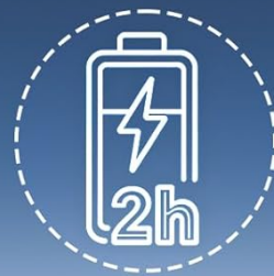
Fast Charging 2H

Image: Magnetic charging connection and battery life indicators.