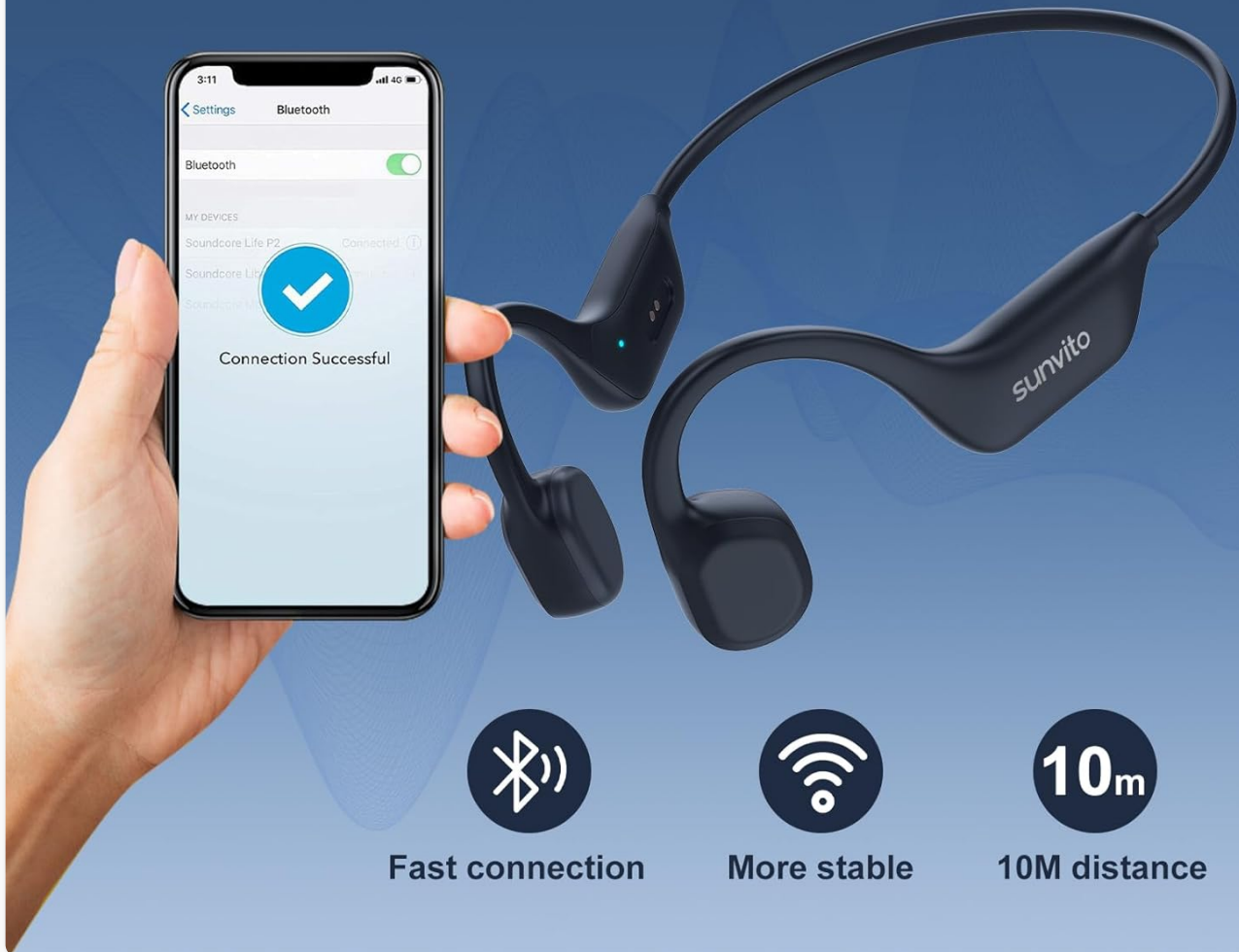
Image: Successful Bluetooth connection shown on a smartphone.