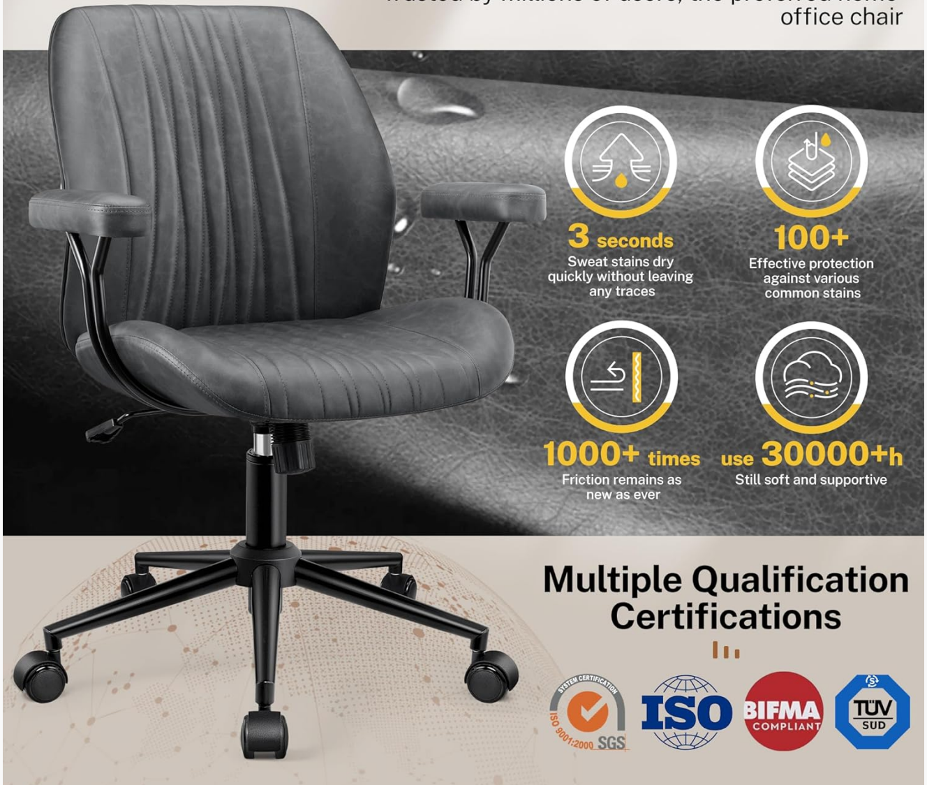
Image: The HeroSet RC2014 Leather Office Chair, dark gray, positioned in a contemporary home office environment, showcasing its design and ergonomic features.

Trusted by millions of users, the preferred home office chair