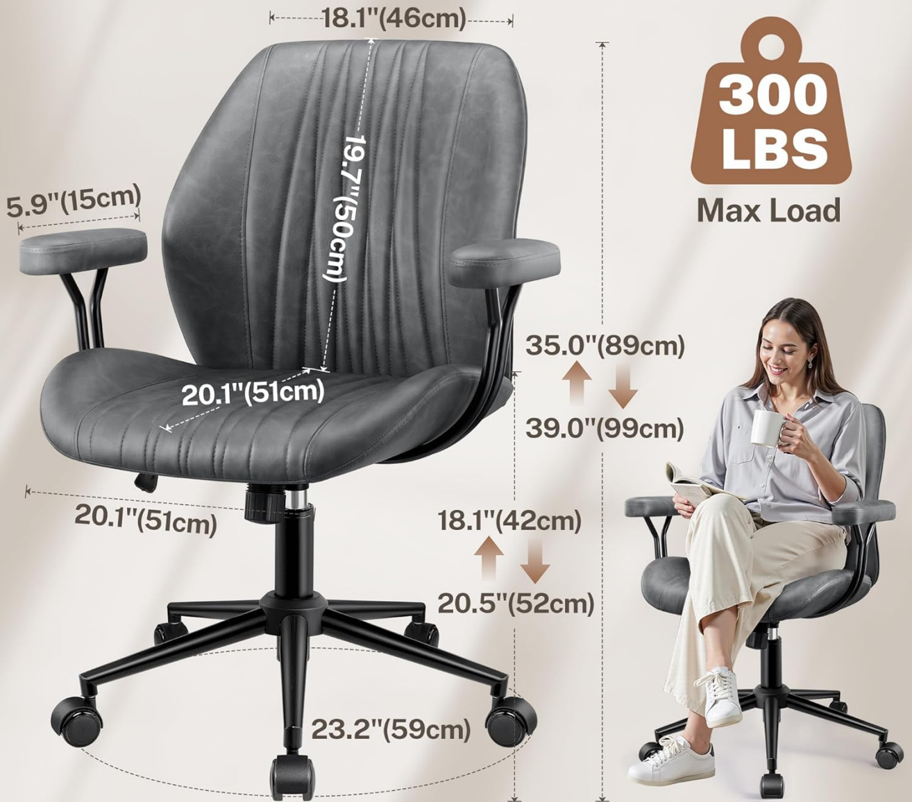
Image: A diagram illustrating the key dimensions of the chair, including height, width, and depth, along with maximum load capacity.