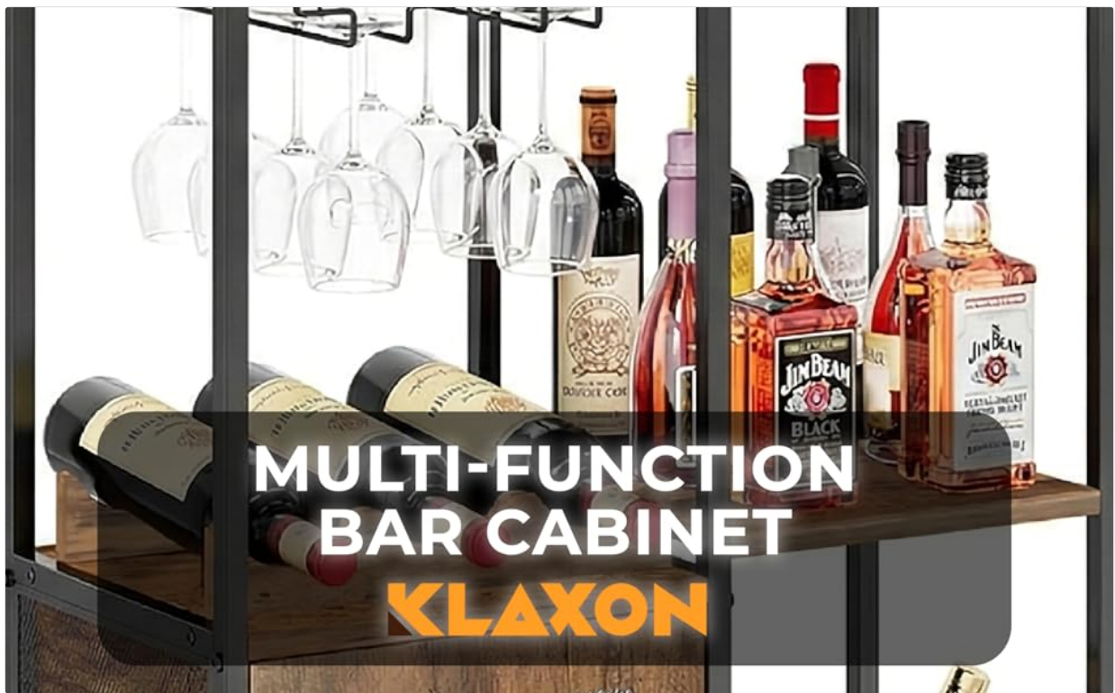
Figure 4: Detail of wine glass holders and wine rack. This image shows the capacity and design of the integrated storage for wine glasses and bottles.