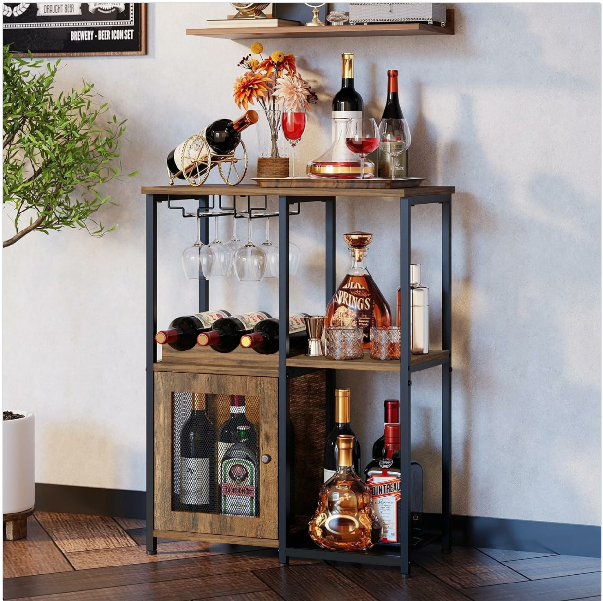
Figure 1: Klaxon Xylo Bar Cabinet, main view. This image displays the overall design and storage capabilities of the unit, including the top serving surface, glass rack, wine rack, and enclosed cabinet.