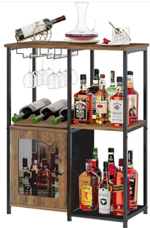
Figure 2: Feature breakdown of the bar cabinet. This diagram visually identifies the glass rack, wine rack, visual enclosed cabinet, and two open shelves.

Functions as a home bar, wine rack, or serving cabinet with a stylish industrial look.