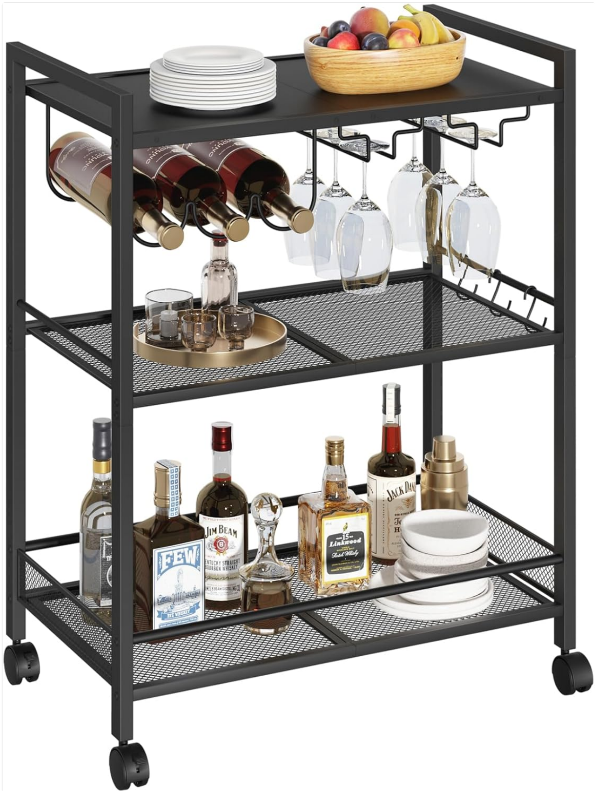
Image: The Joaxswe 3-Tier Bar Cart, showcasing its storage capacity for beverages, glassware, and decor.