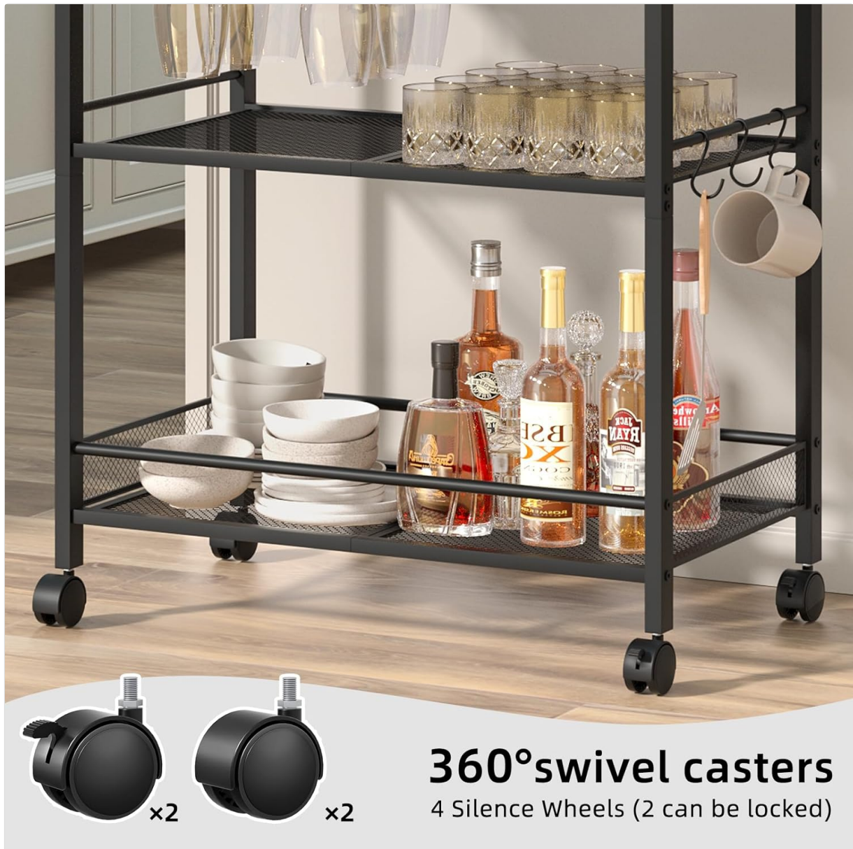
Image: Detail of the cart's 360-degree swivel casters, highlighting the two wheels equipped with locking mechanisms for stability.