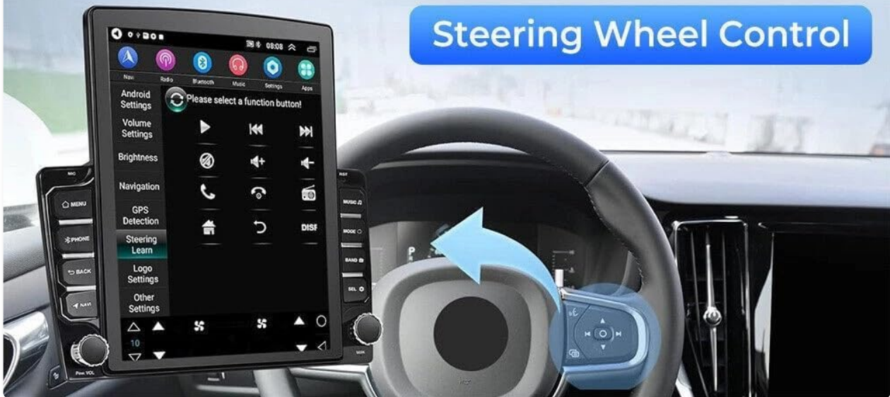
Image: Shows the AHD backup camera view on the display and the interface for configuring steering wheel controls.