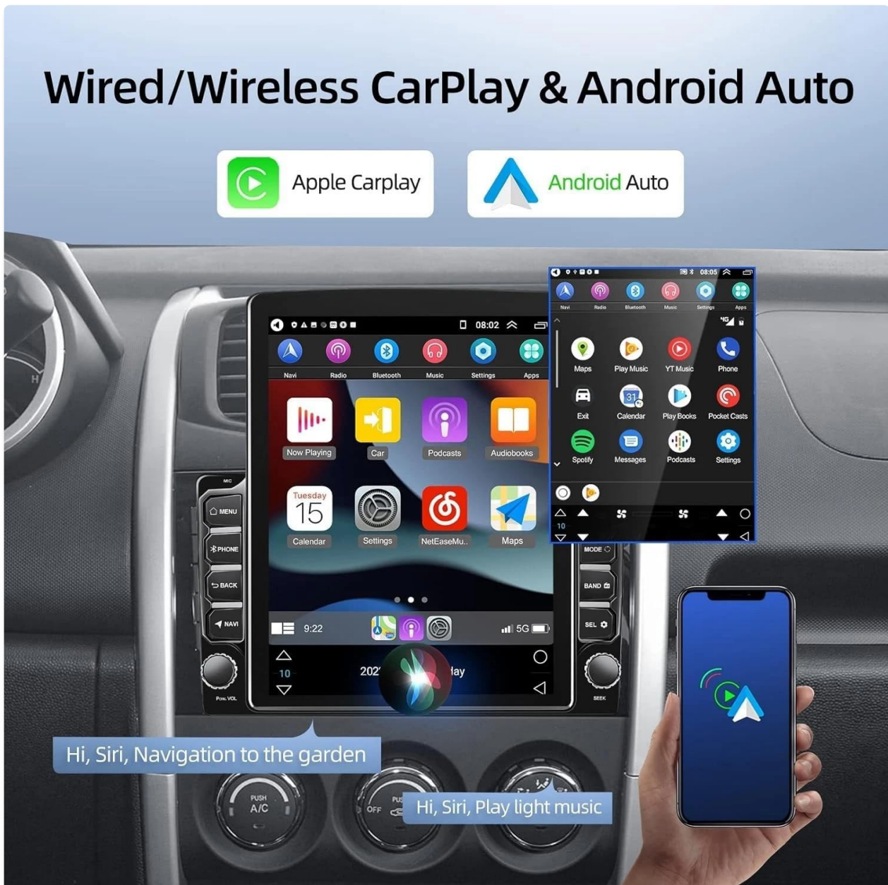
Image: Illustration of wired and wireless Apple CarPlay and Android Auto interfaces on the car stereo display.