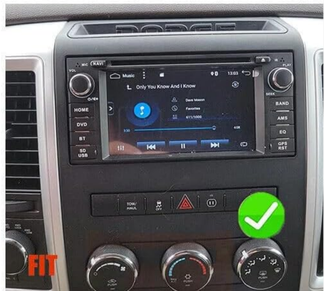
Image: Examples of compatible Dodge Ram dashboards, showing various factory stereo configurations that fit the Surakey unit.