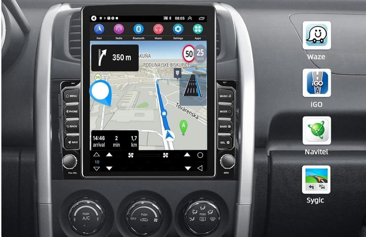
Image: Display showing GPS navigation with options for online and offline maps, including popular navigation apps.