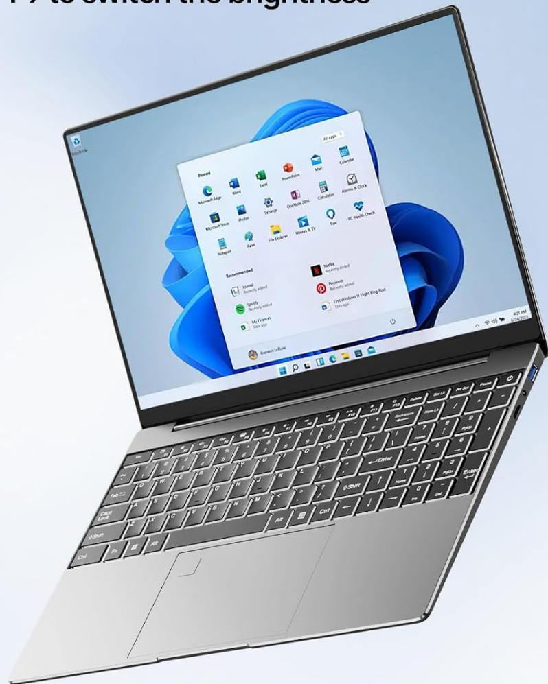
Image: Illustration of the backlit keyboard with brightness settings (Off, Dark, Light).