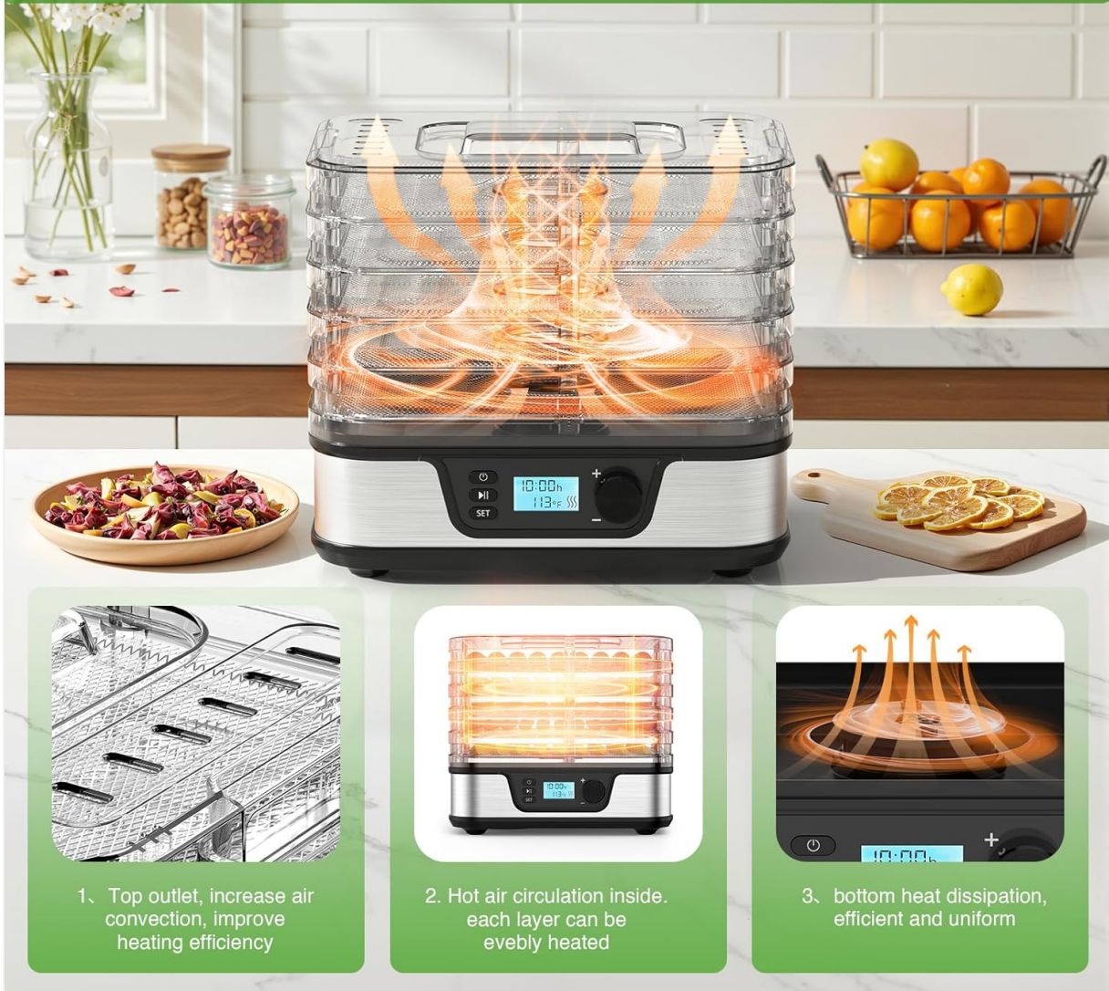
Figure 1: Digital Control Panel. Features a power button, start/pause button, set button, and a rotary knob for adjusting time and temperature.

The unit utilizes 360° hot air circulation for even drying across all trays, eliminating the need for manual rotation.