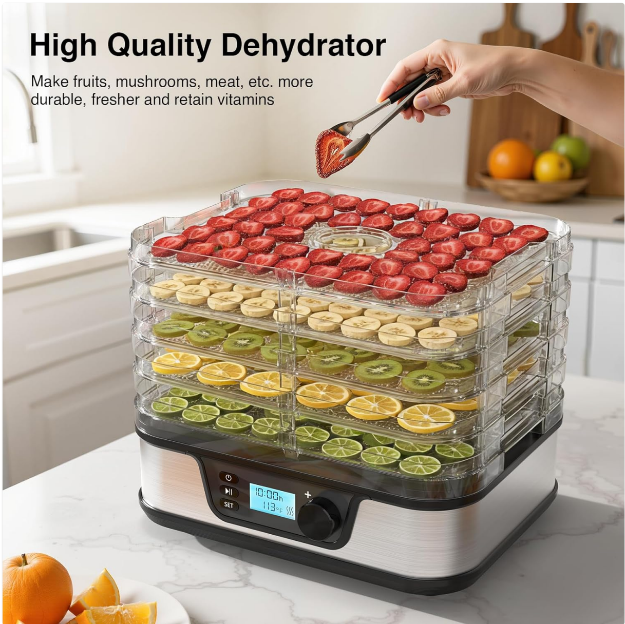
Figure 4: Preparing and loading food onto trays. Ensure even spacing for optimal drying.

Make fruits, mushrooms, meat, etc. more durable, fresher and retain vitamins