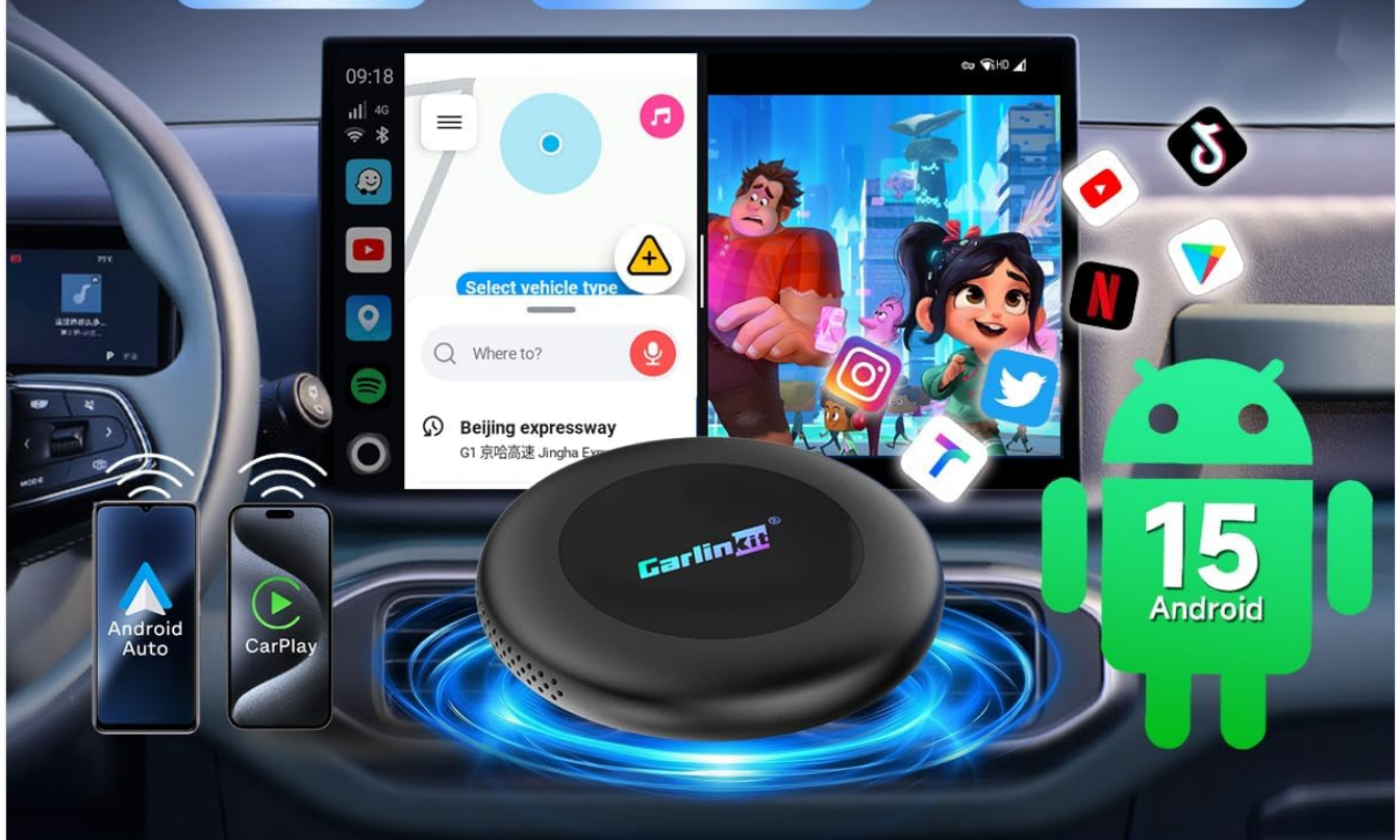
Image: Carlinkit Tbox Ultra device and car screen showing Android 15, Wireless Android Auto, and Wireless CarPlay interfaces.