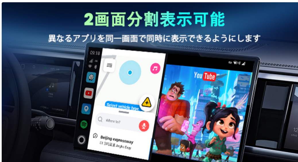
Image: Car screen showing a split display with navigation on one side and a video playing on the other.

The Tbox Ultra supports a 2-screen split display, allowing you to run two applications simultaneously. For example, you can have navigation on one side and a video streaming app on the other without interrupting playback.