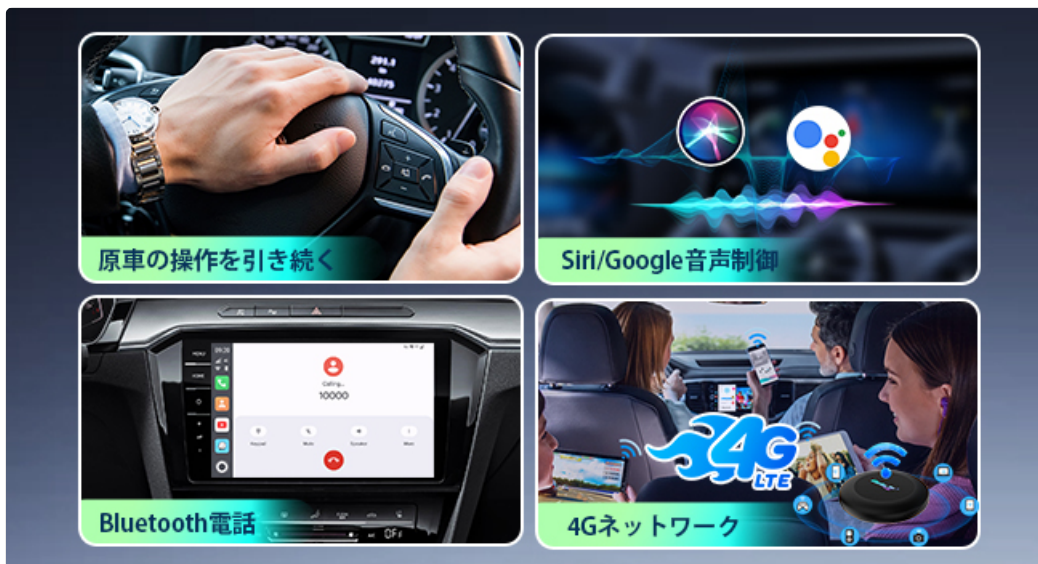
Image: Illustrations of voice control, Bluetooth phone calls, and 4G network connectivity features.