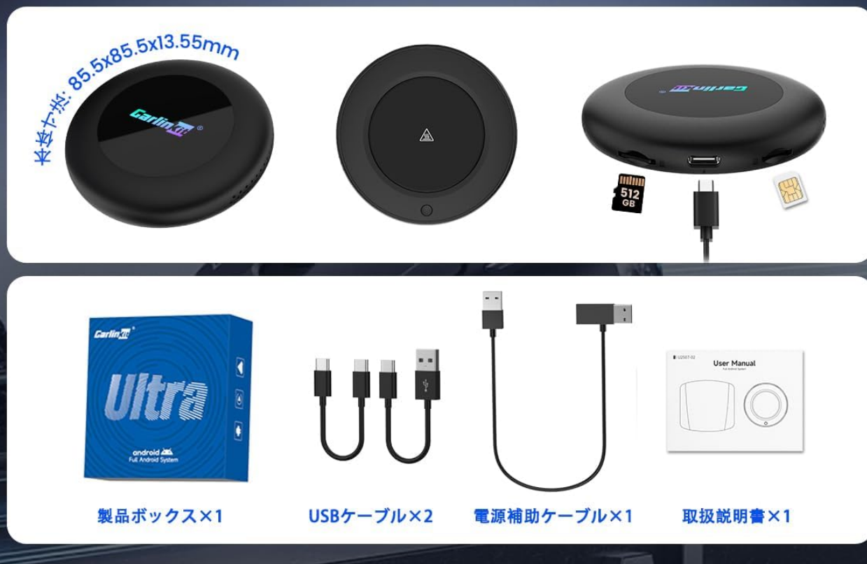
Image: Contents of the Carlinkit Tbox Ultra package, including the main unit, cables, and user manual.