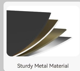
Sturdy Metal Material