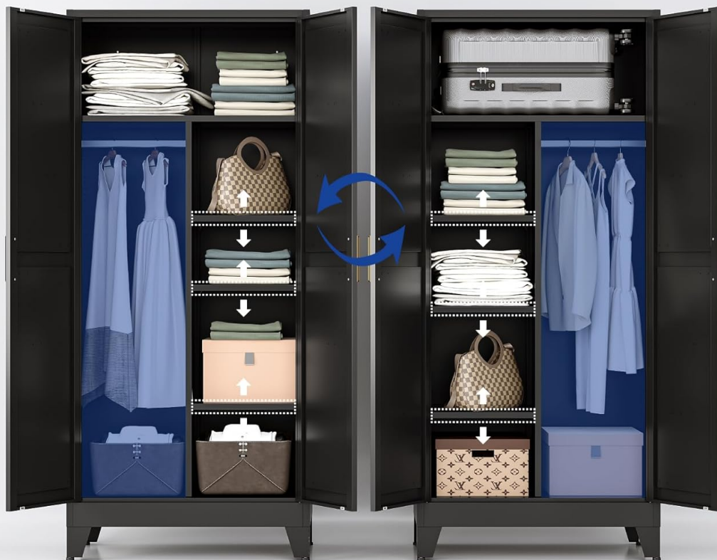
Image: Illustration demonstrating two possible interior configurations for the COFaR Wardrobe Closet, highlighting the flexibility of adjustable shelves and hanging rod placement.