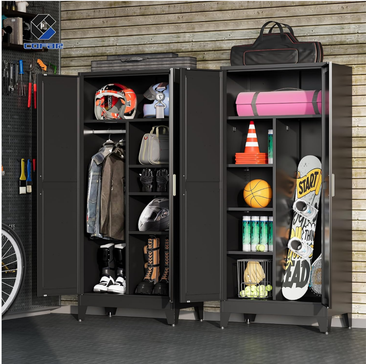
Image: A visual representation of the COFaR Wardrobe Closet's dimensions (height, width, depth) and key features such as its sturdy metal construction and adjustable shelving.