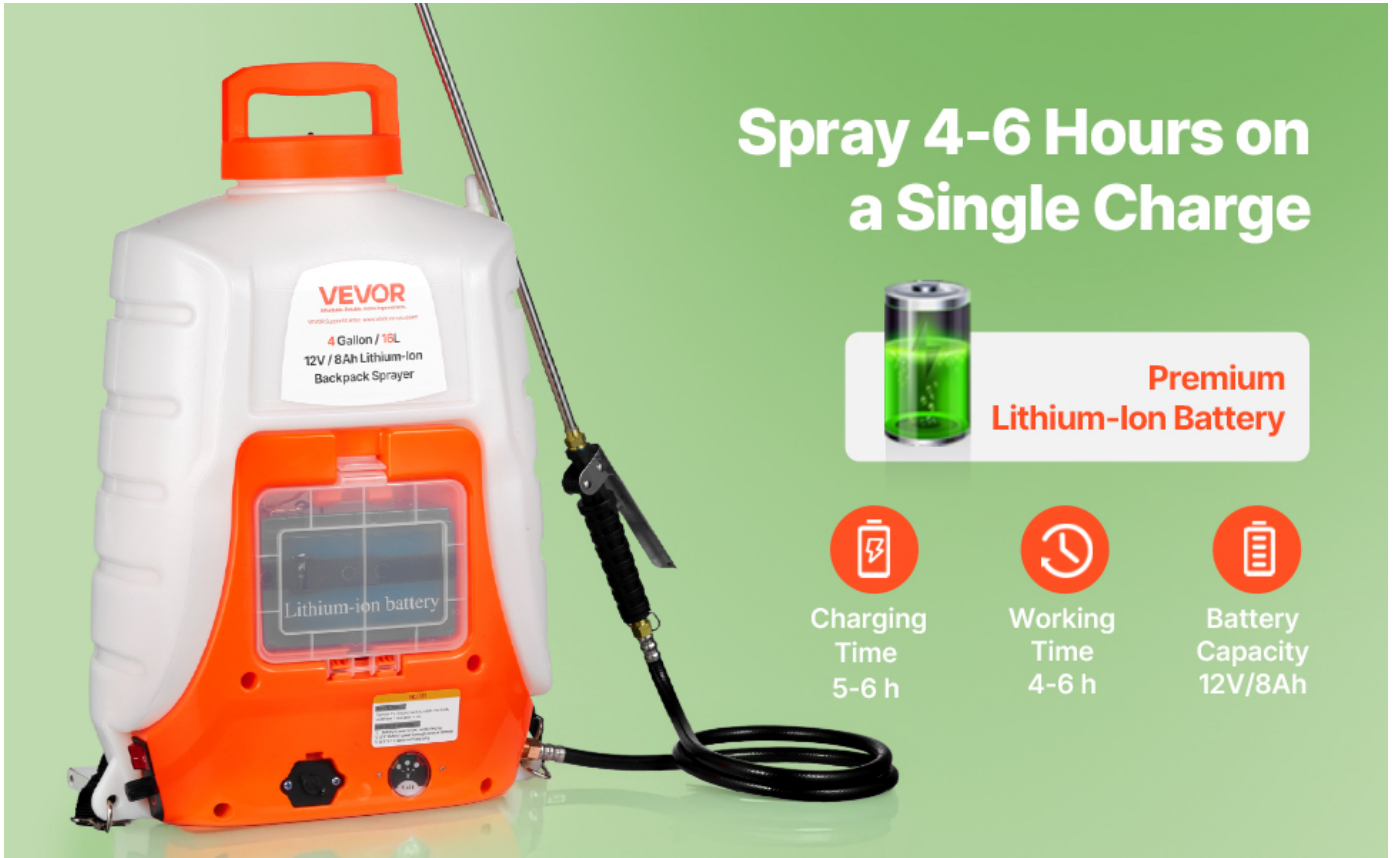
Image: The VEVOR backpack sprayer in use, demonstrating its battery-powered operation and efficiency for tasks like hedge spraying. The image also highlights the long-lasting battery, efficiency, time-saving, and ease of operation.