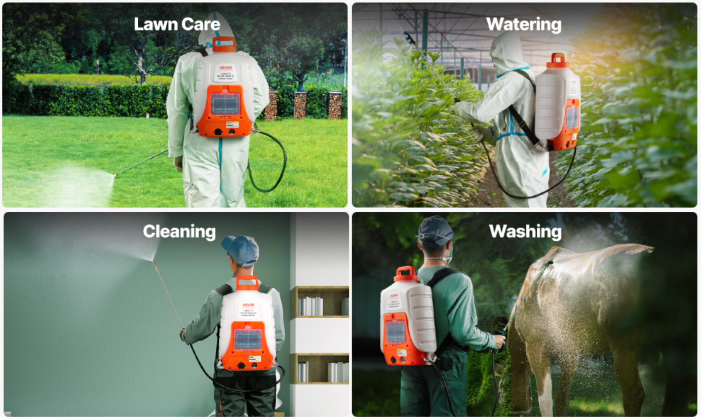
Image: A multi-panel image demonstrating the diverse applications of the VEVOR backpack sprayer, including lawn care, watering plants, general cleaning, and washing tasks.