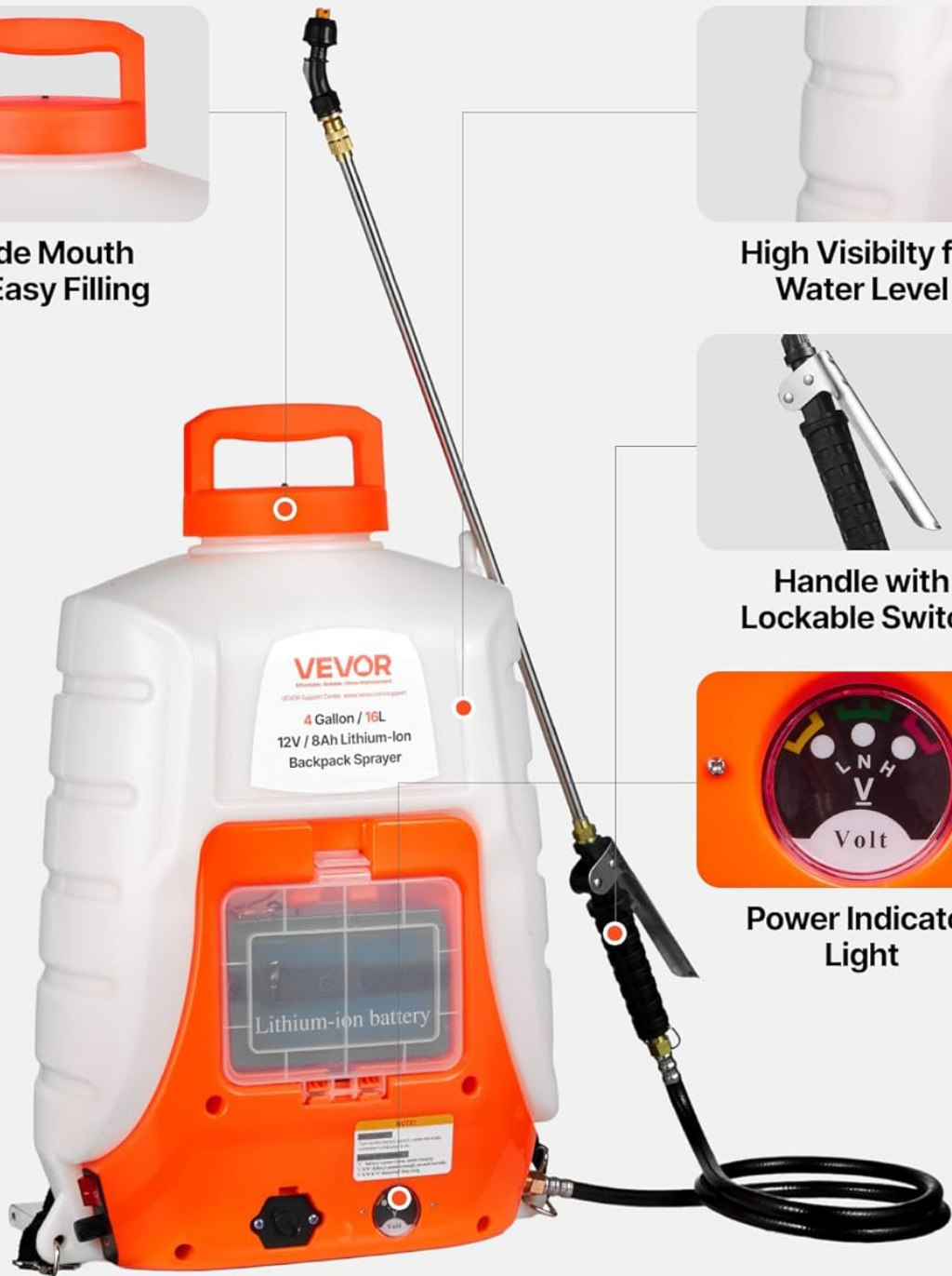
Image: An illustration highlighting the user-friendly design elements of the sprayer, such as the wide mouth for easy filling, high visibility for water level, a handle with a lockable switch for continuous spraying, and a power indicator light.