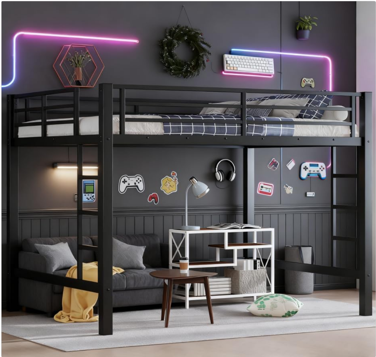
Image: The Bellemave Queen Metal Loft Bed installed in a room, demonstrating the open space beneath the bed being utilized with a sofa and a small desk, highlighting its space-saving design.