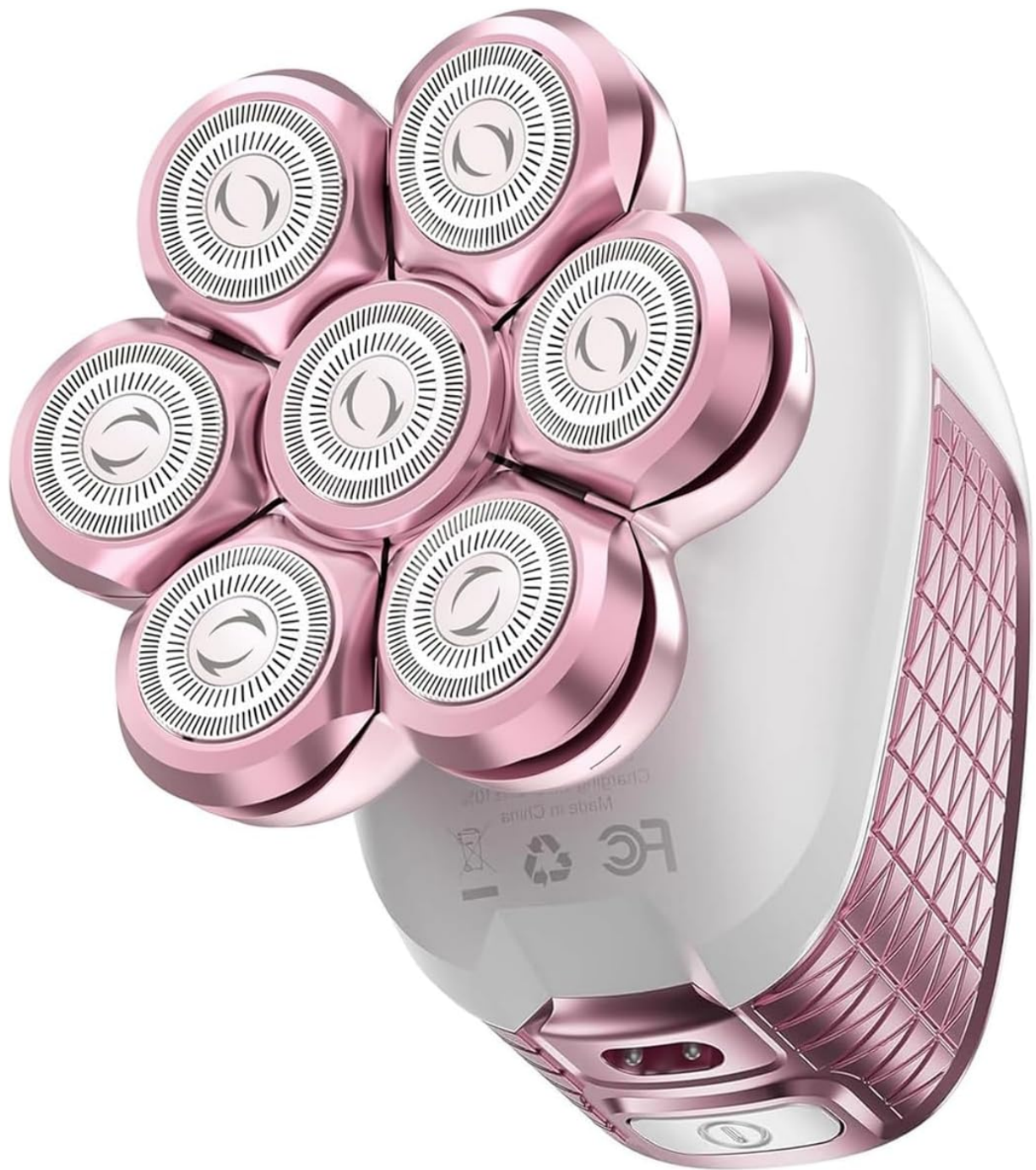
Image: The Wyklus 5-in-1 Electric Shaver, showcasing its ergonomic design and 7D shaving head.