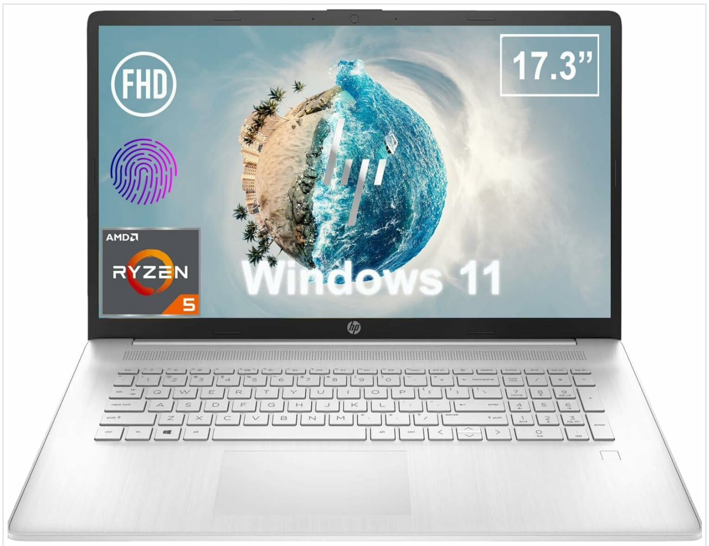
Figure 1.1: Front view of the HP 17.3 Inch FHD Business Laptop, showcasing the large display and keyboard.