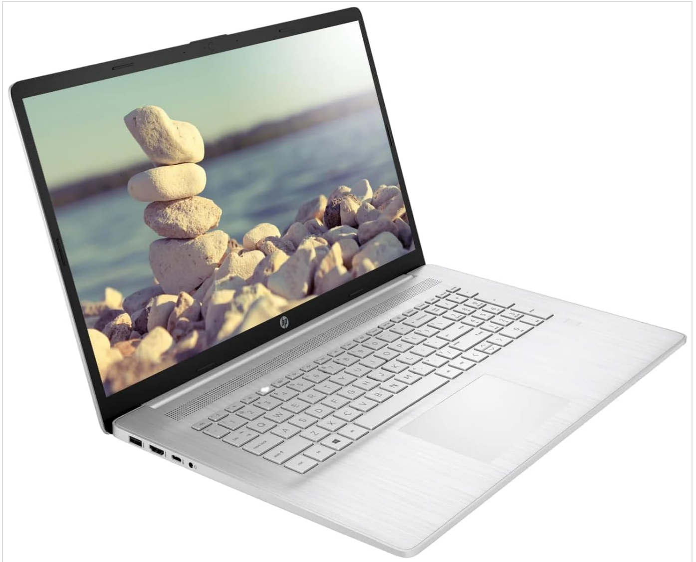
Figure 3.1: Open view of the laptop, highlighting the keyboard and touchpad area.