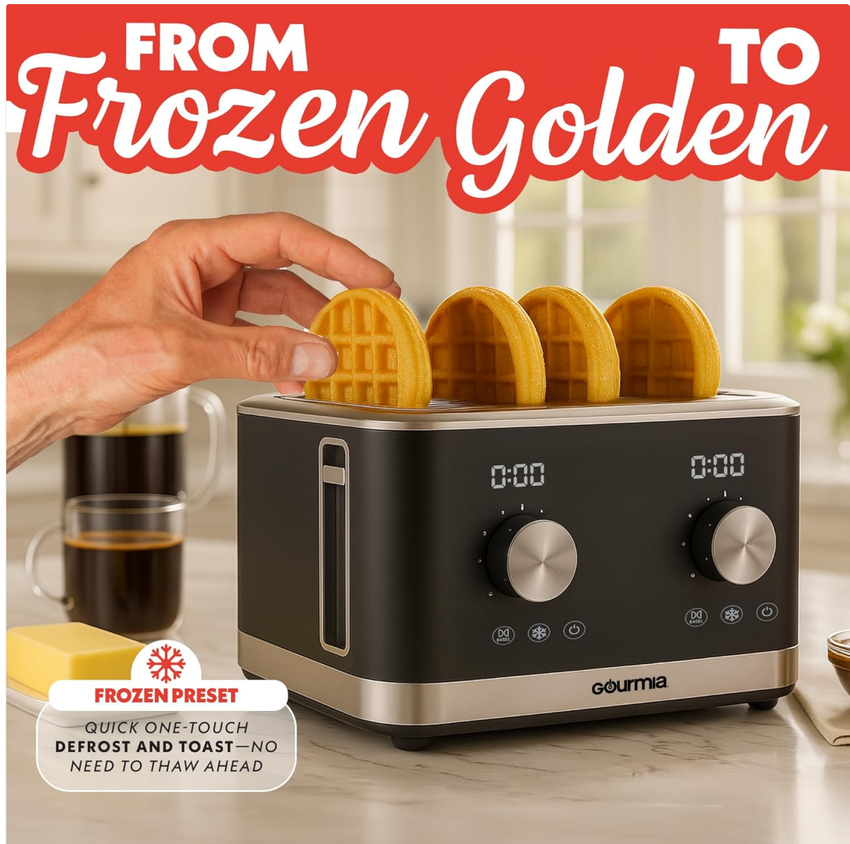
Using the Defrost preset for frozen items like waffles.