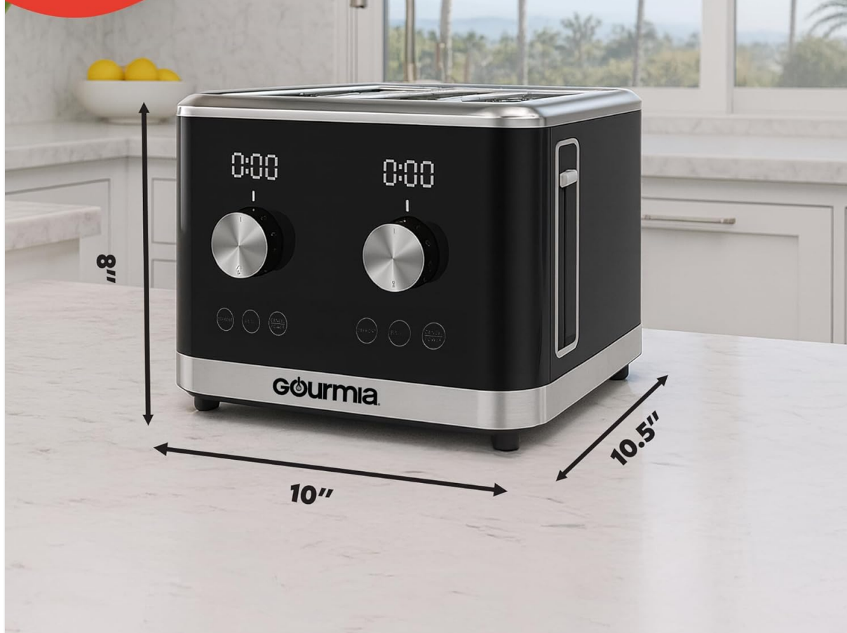
Dimensions of the Gourmia 4-Slice Toaster for counter space planning.