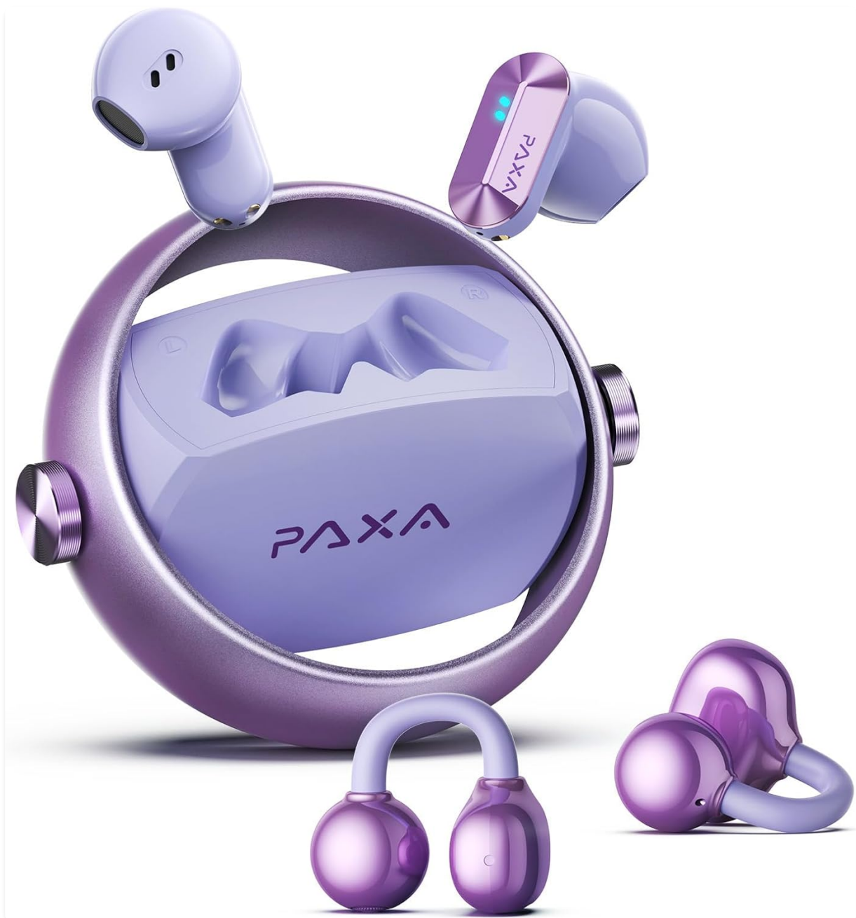
Image: The PAXA 2-in-1 Clip-on Open Ear Earbuds displayed in their unique circular charging case, along with the separate clip-on ear hooks, showcasing the versatility of the design.