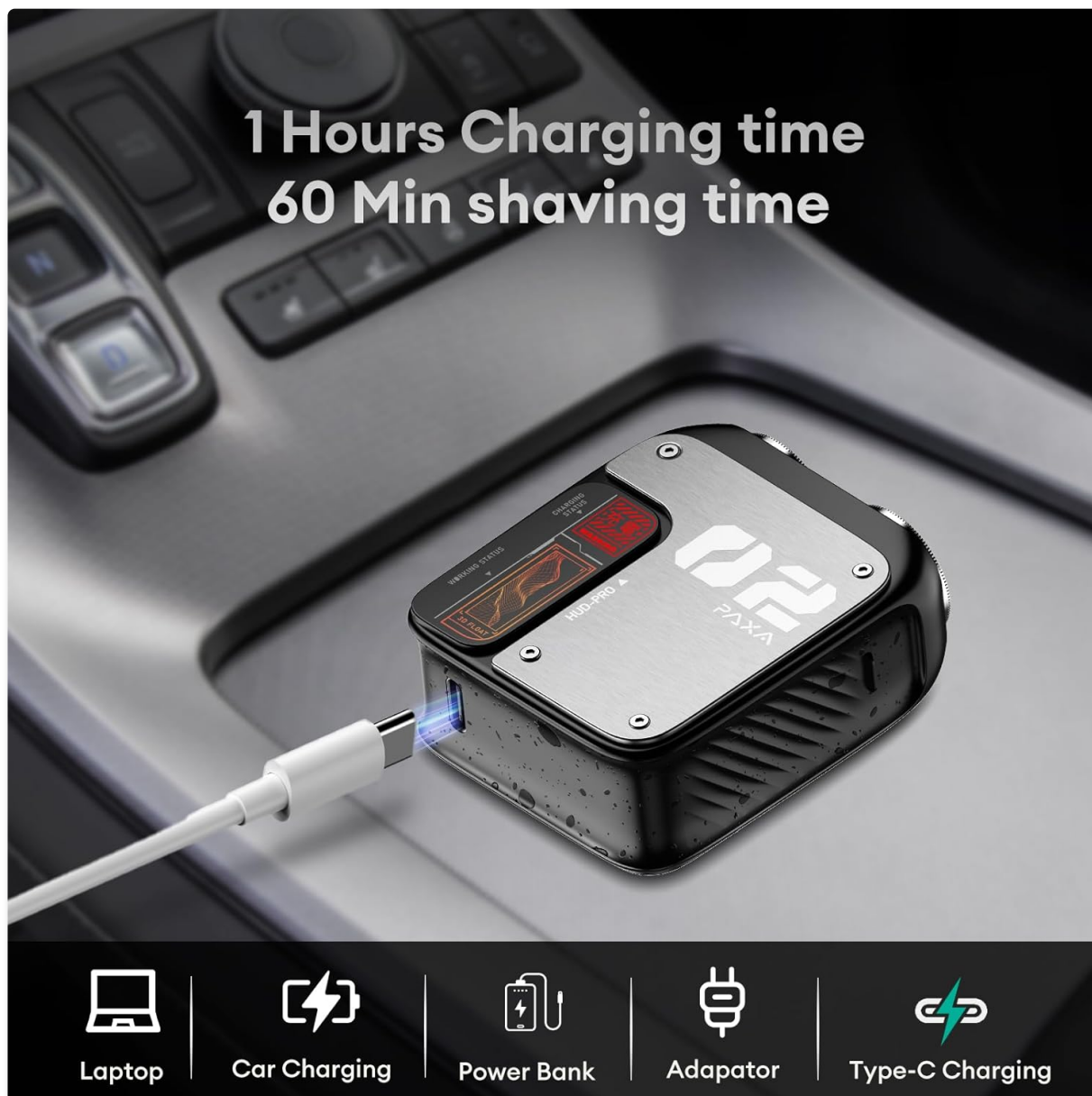
Image: The PAXA Mini Electric Shaver connected to a USB-C cable for charging, demonstrating its compatibility with various power sources like laptops, car chargers, and power banks.

the device for specific instructions on activating/deactivating the lock.