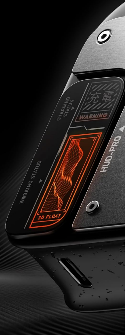
Image: A detailed view of the PAXA Mini Electric Shaver's internal components, highlighting its dual-ring floating blade mesh, Martensitic steel blade capable of 10,800 cuts per minute, and a 9,000 RPM high-torque speed motor.