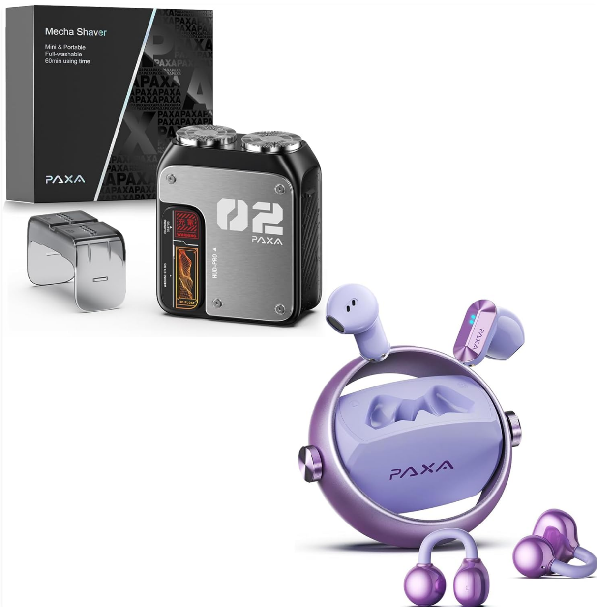
Image: The PAXA Mini Portable Electric Shaver and the 2-in-1 Clip-on Open Ear Headphones, presented together as a complete product bundle.