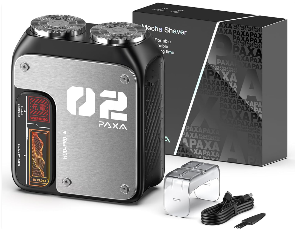
Image: The PAXA Mini Portable Electric Shaver displayed alongside its retail packaging and included accessories, such as the cleaning brush and charging cable.