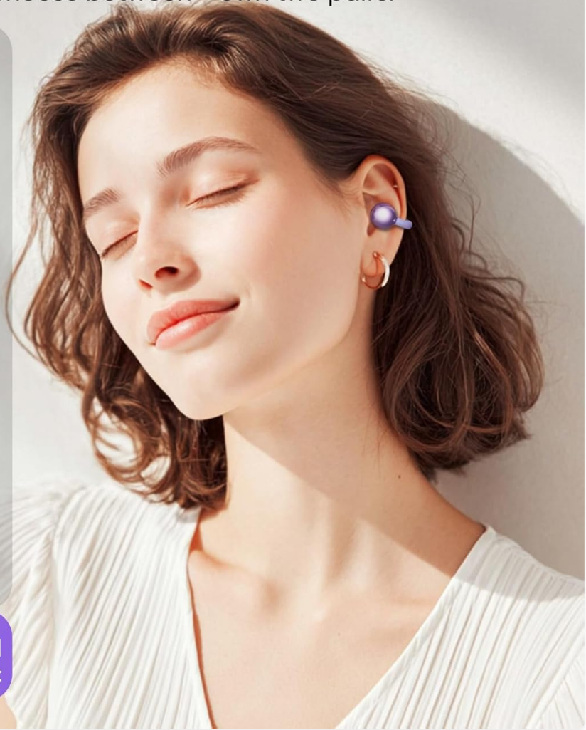
Image: A person wearing the PAXA 2-in-1 Clip-on Open Ear Earbuds, illustrating the ease of switching between the in-ear and clip-on configurations for different preferences and activities.

Ergonomically Designed for all day Wearing Comfort