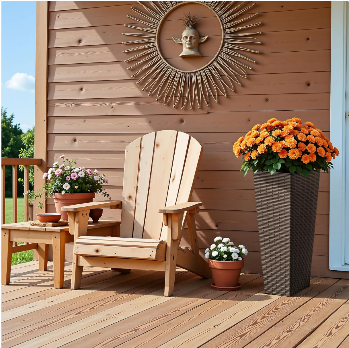
Image: A Devoko planter positioned on a porch, demonstrating its use in an outdoor setting.