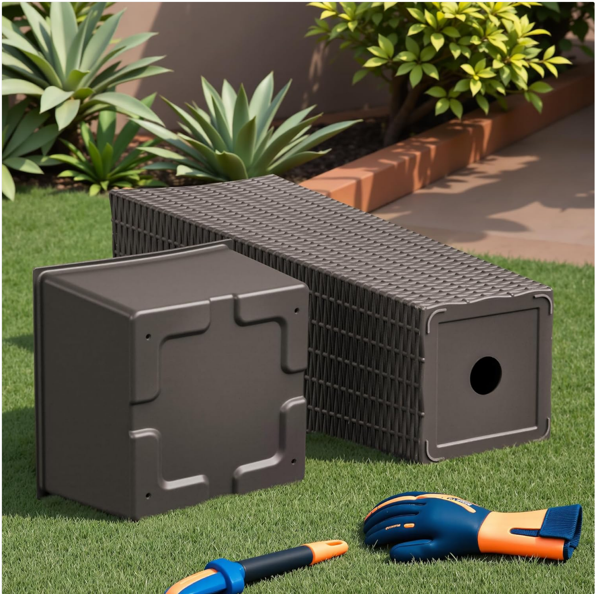
Image: The removable inner pot and the outer planter, ready for planting.