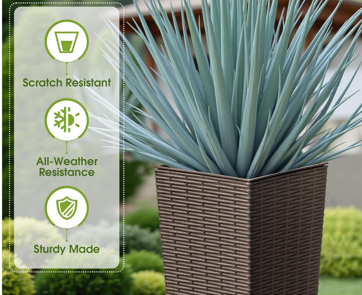
Image: A pair of Devoko tall planters showcasing their design and suitability for outdoor environments.