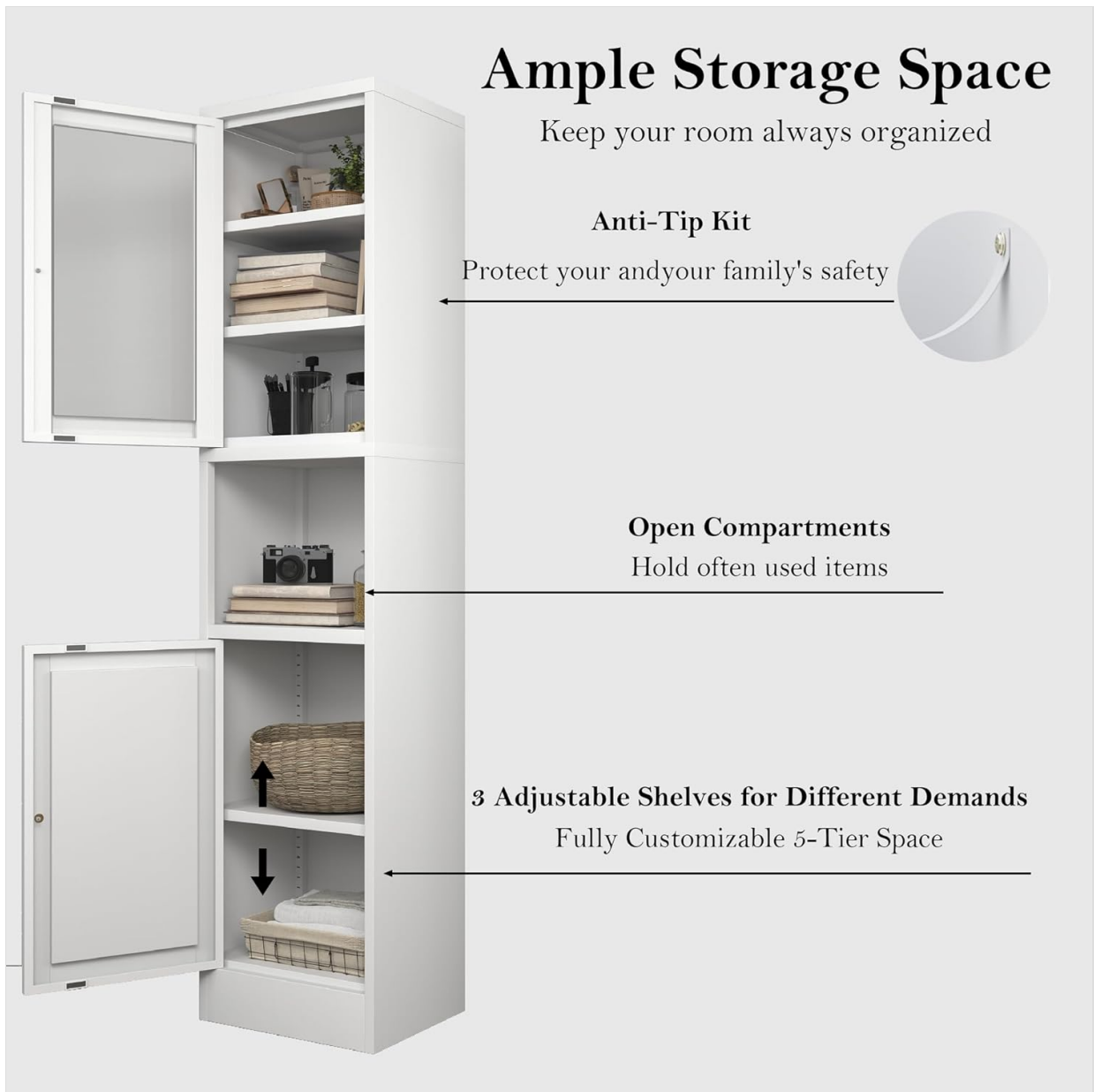
Image: Interior view highlighting adjustable shelves, anti-tip kit, and open compartments.