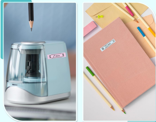
Image: Labels used for school essentials, such as on books and classroom supplies, aiding in organization for students.