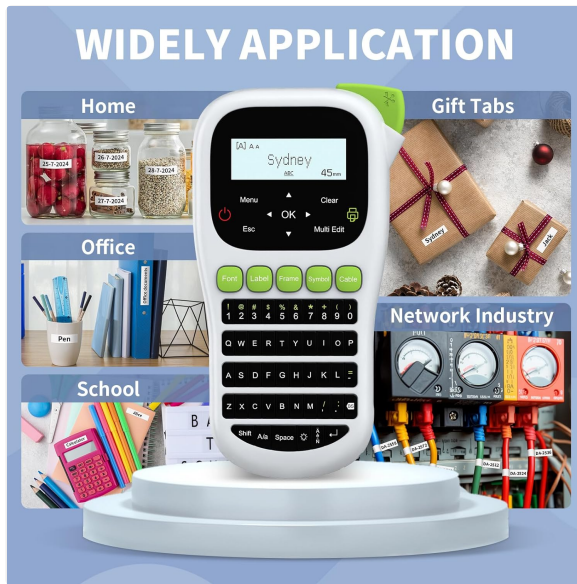
Image: The VolenGo H1100 label maker shown in diverse usage scenarios, including organizing items at home, labeling files in an office, marking school supplies, and identifying cables in a network setup.

Image: Labels applied for professional office organization, including on file folders and electronic devices, promoting a streamlined workspace.