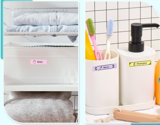
Image: Labels applied for home organization, including on storage drawers and shampoo bottles, demonstrating clear and neat labeling.