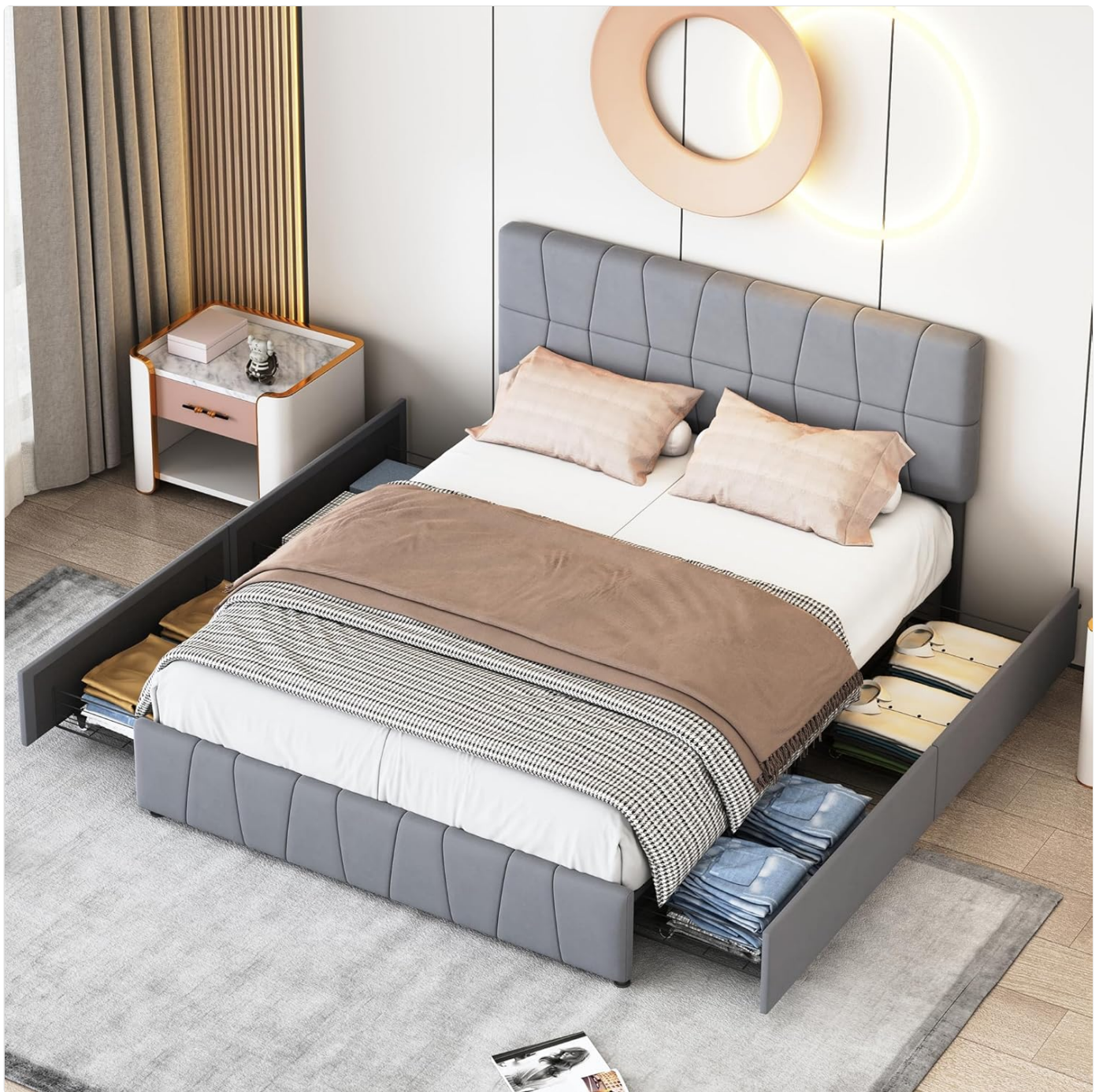
Figure 4: Storage drawers in use, providing ample space for various items.