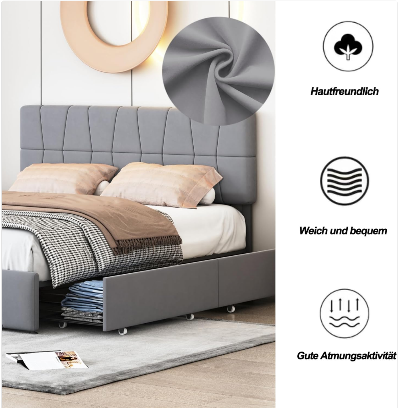
Figure 5: The bed's fabric is designed to be skin-friendly, soft, comfortable, and breathable, requiring gentle care.

Regularly dust the bed frame with a soft, dry cloth. For the upholstered parts (velvet/linen), use a soft brush or a vacuum cleaner with an upholstery attachment to remove dust and debris.