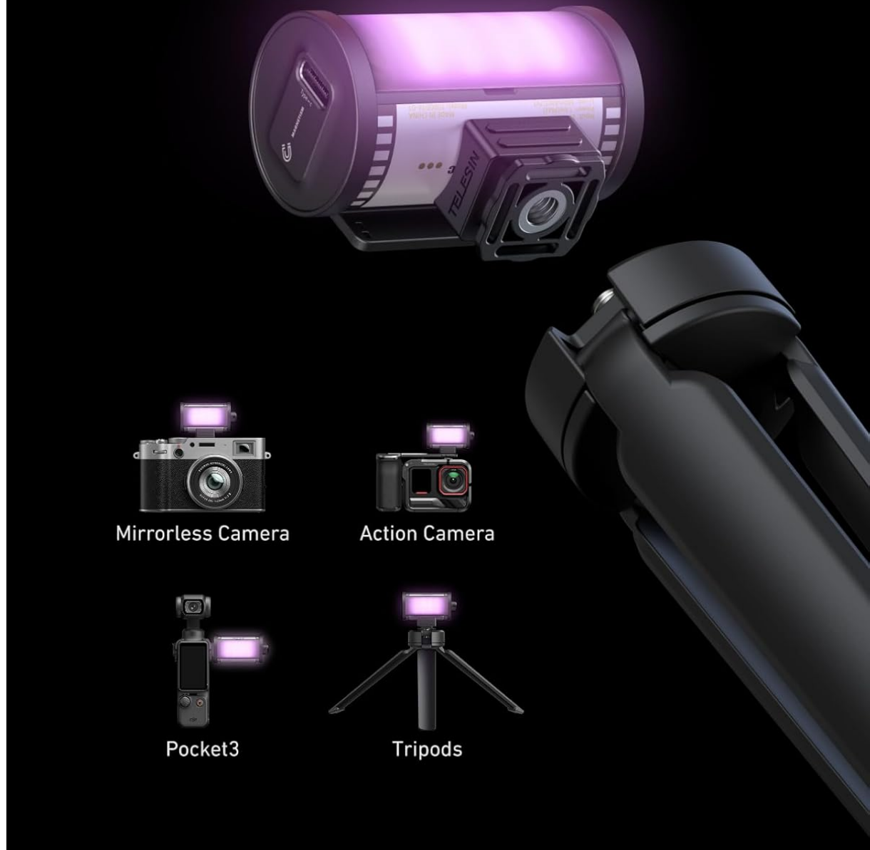
Figure 4.3: Universal Mounting. The image illustrates the light mounted on different devices such as a mirrorless camera, action camera, Pocket3, and a tripod.