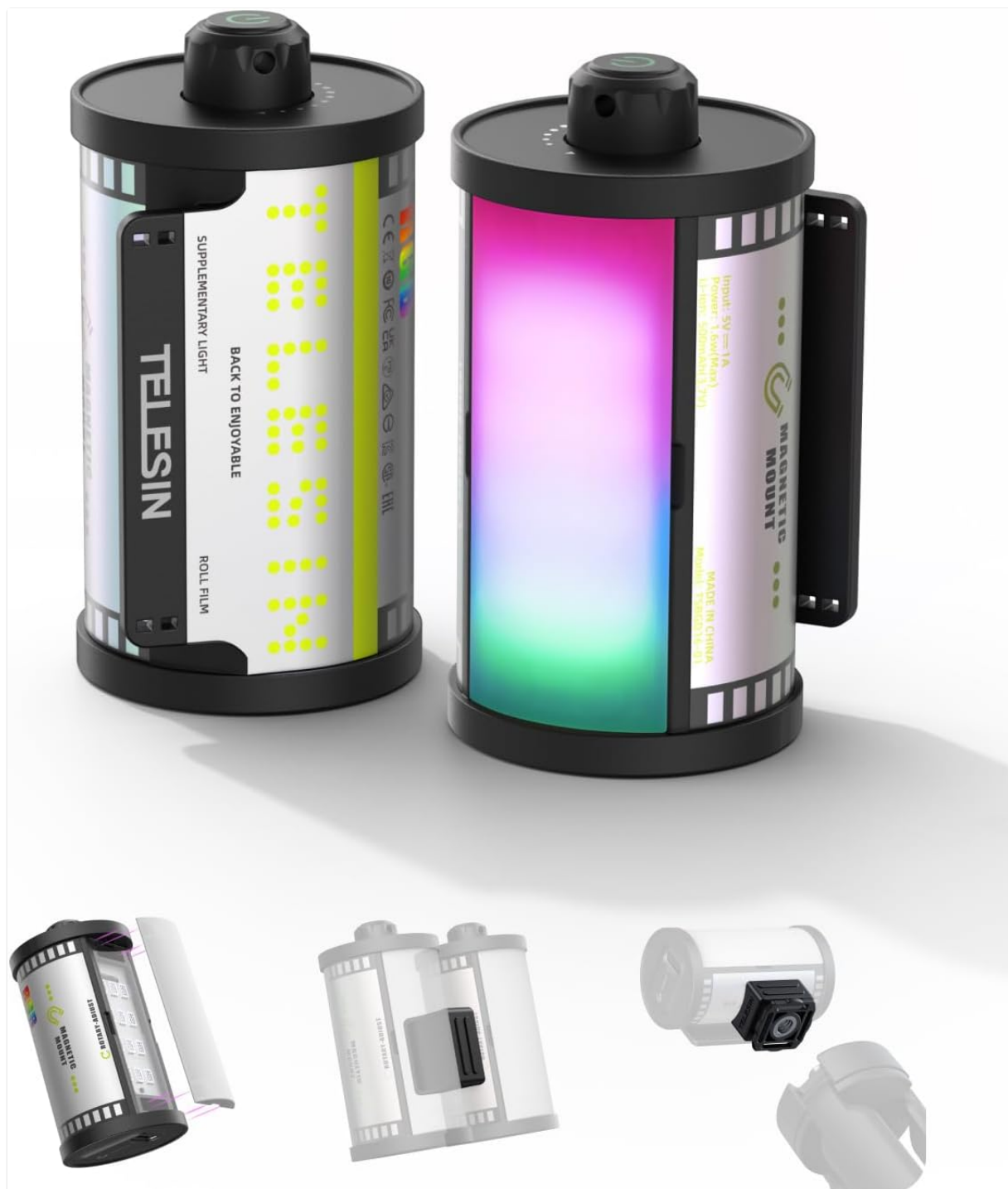
Figure 3.1: TELESIN Magnetic RGB Video Light. The light is shown with its unique film roll aesthetic and a magnetic attachment point on its side.