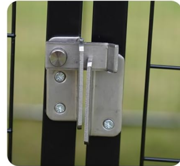
Lockable Design Safety

Image: Detailed display highlighting the durable metal bottom for stability, strong panel connection buttons, and the secure lockable gate design.