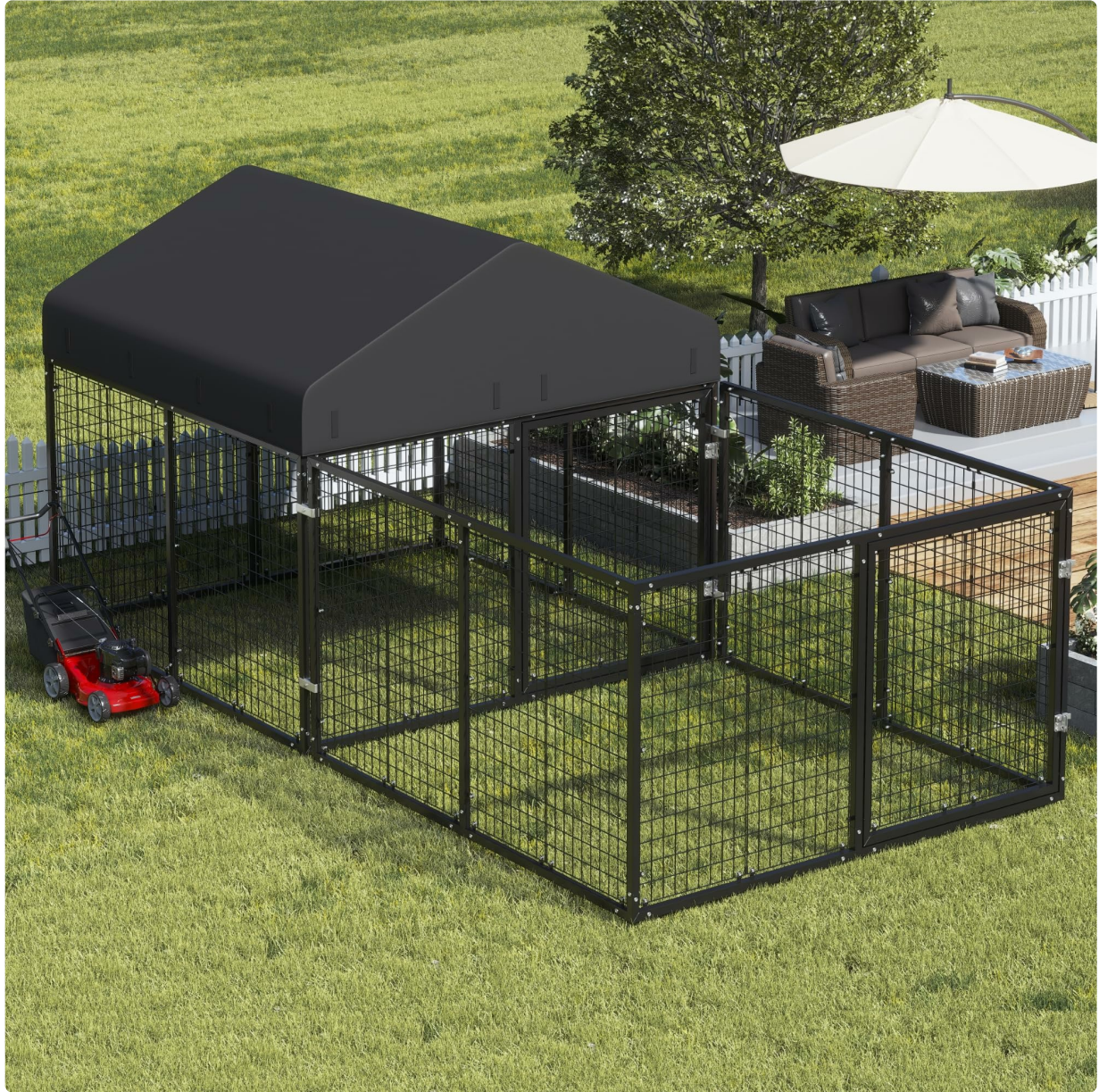
Image: A complete view of the ATTAV Outdoor Dog Kennel, showcasing the installed roof and the integrated pen.