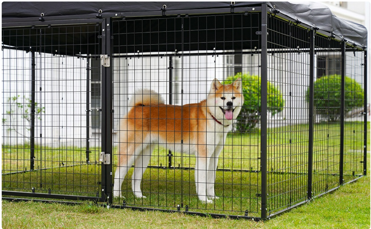
Image: The ATTAV Outdoor Dog Kennel with its integrated pen and roof, situated in a green outdoor space, providing a secure area for a dog.