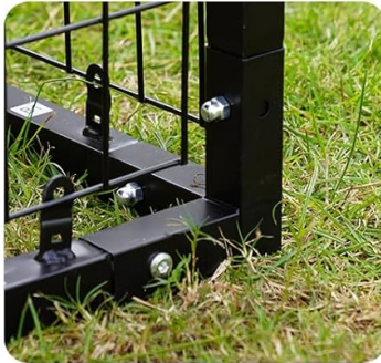
Durable Metal Bottom