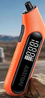
Image: The digital screen of the gauge displaying a tire pressure reading in PSI.