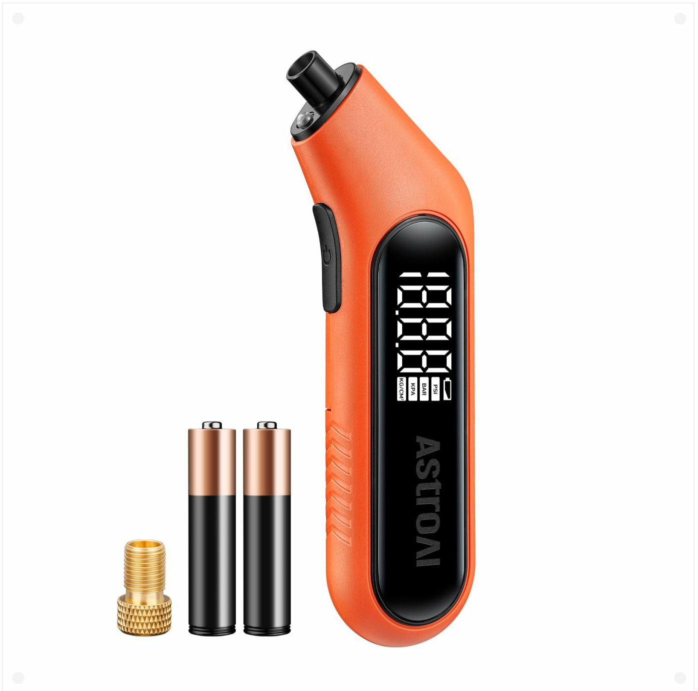
Image: The AstroAI Digital Tire Pressure Gauge in orange, showing its ergonomic design.