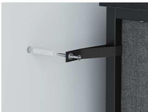
Image: Anti-tipping kit installation. This kit must be installed to ensure the dresser's stability and prevent accidents.