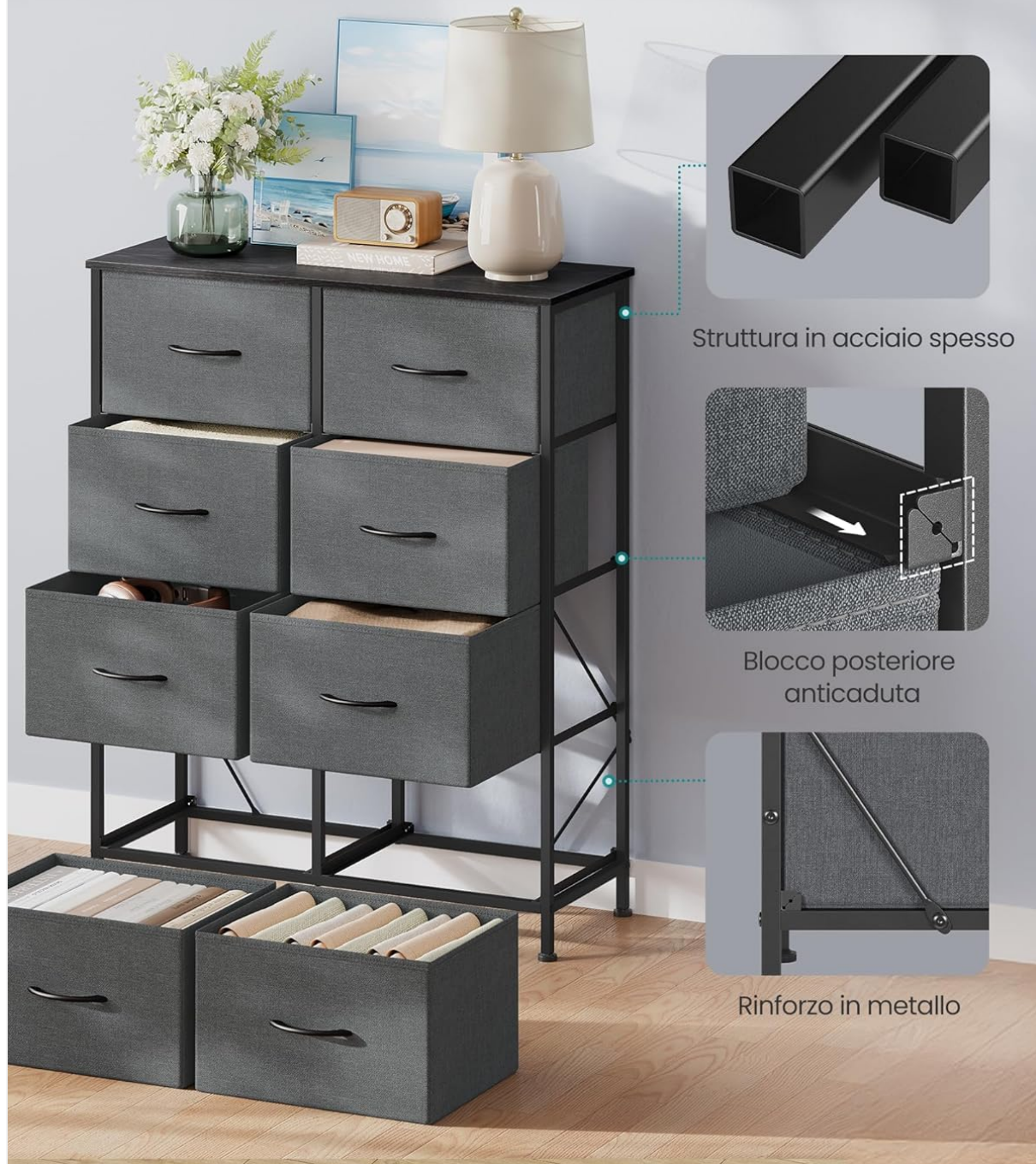
Image: Robust construction details. Note the thick steel frame and anti-tipping block for enhanced safety.