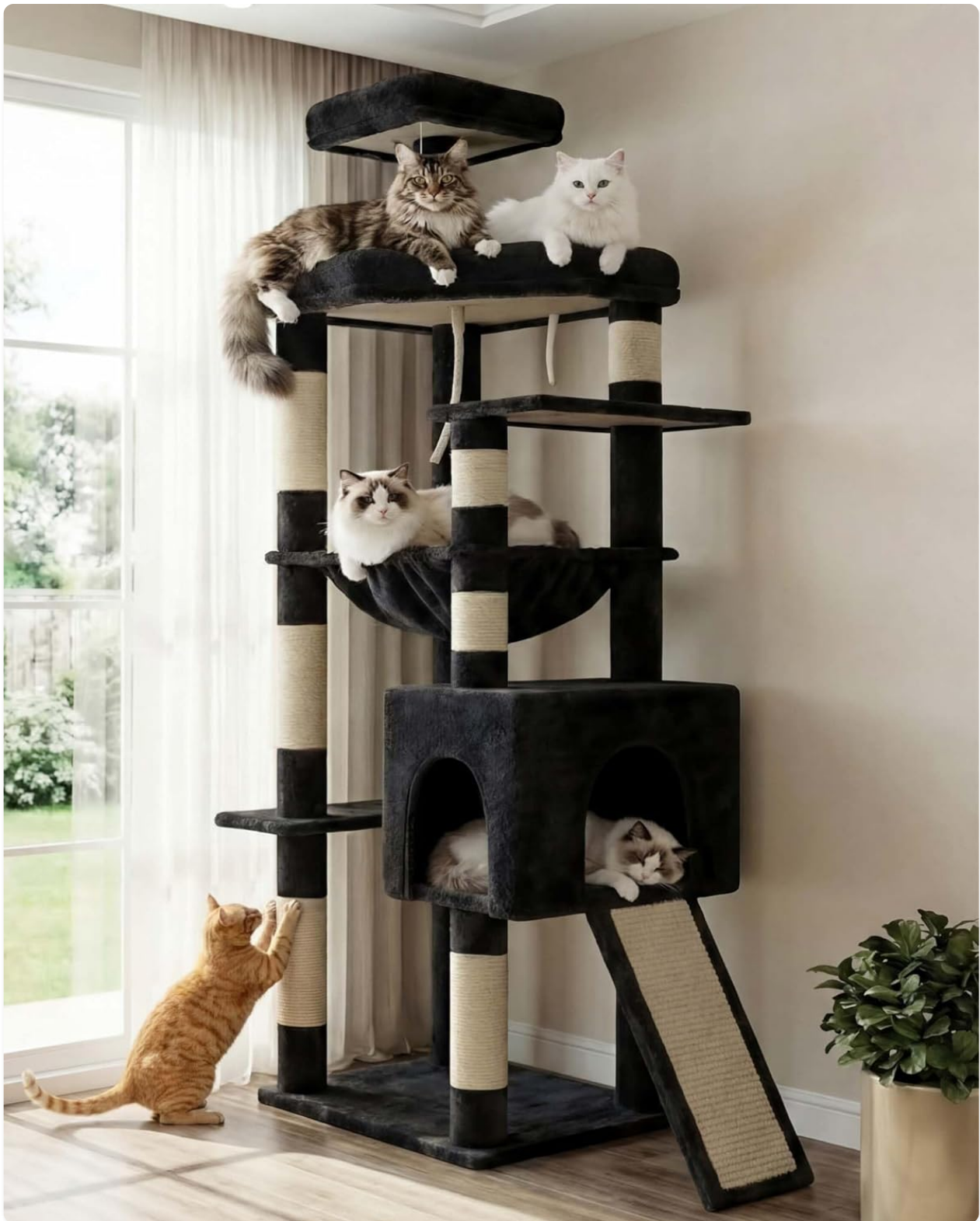
An assembled Heybly HCT027G cat tree, showcasing its multi-level design, scratching posts, hammock, and condo, with several cats enjoying the structure.