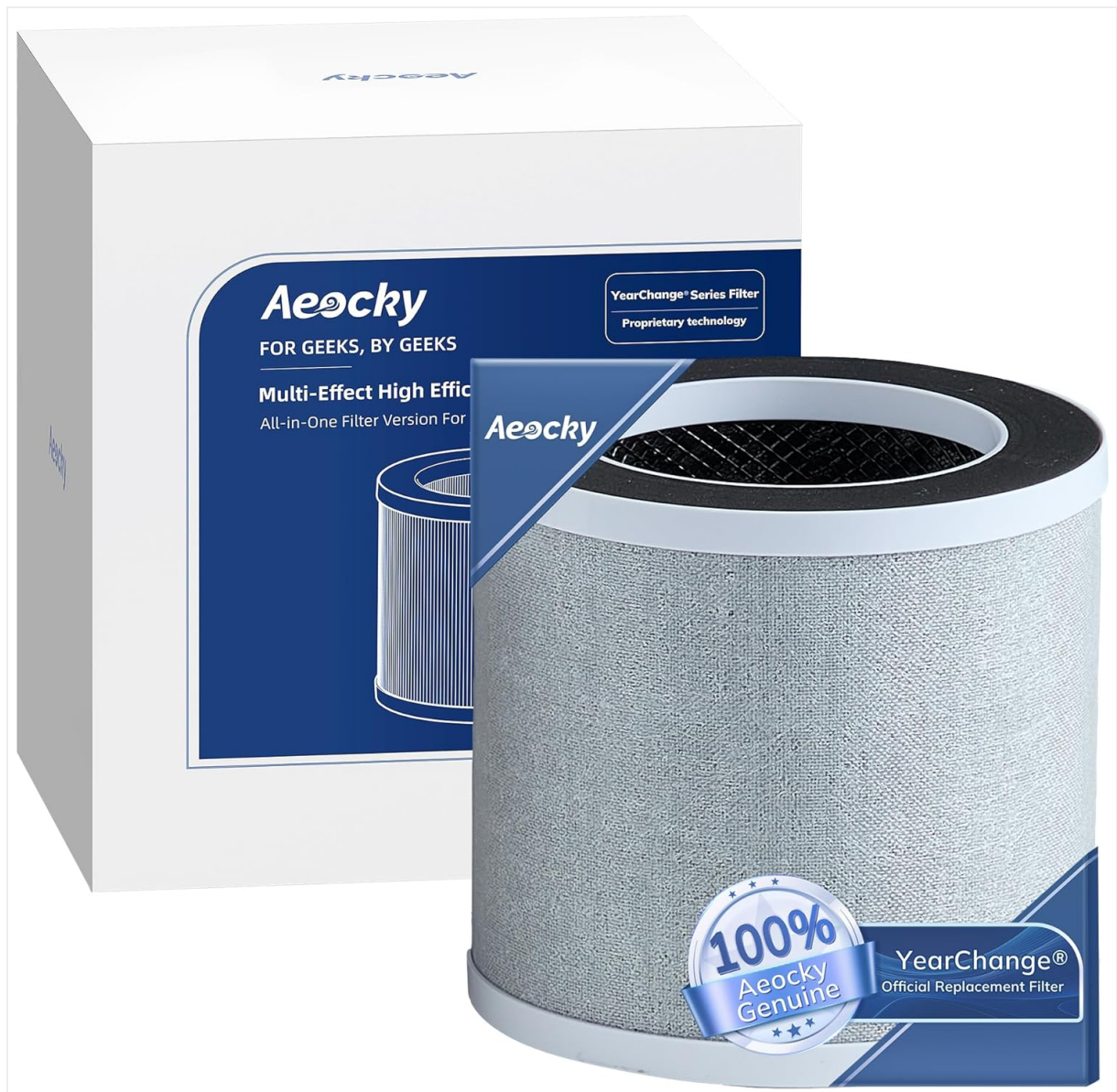
Image 4.1: The AEOCKY YearChange Series Filter and its packaging, demonstrating the filter's design.