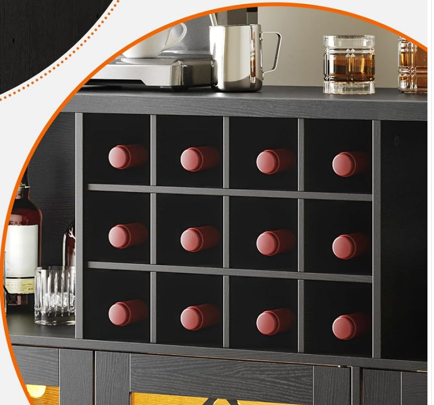
Image 6.3: Detailed view of the 12-bottle wine rack and 3-row glass holder.

A dedicated space to store and display your wine bottles.