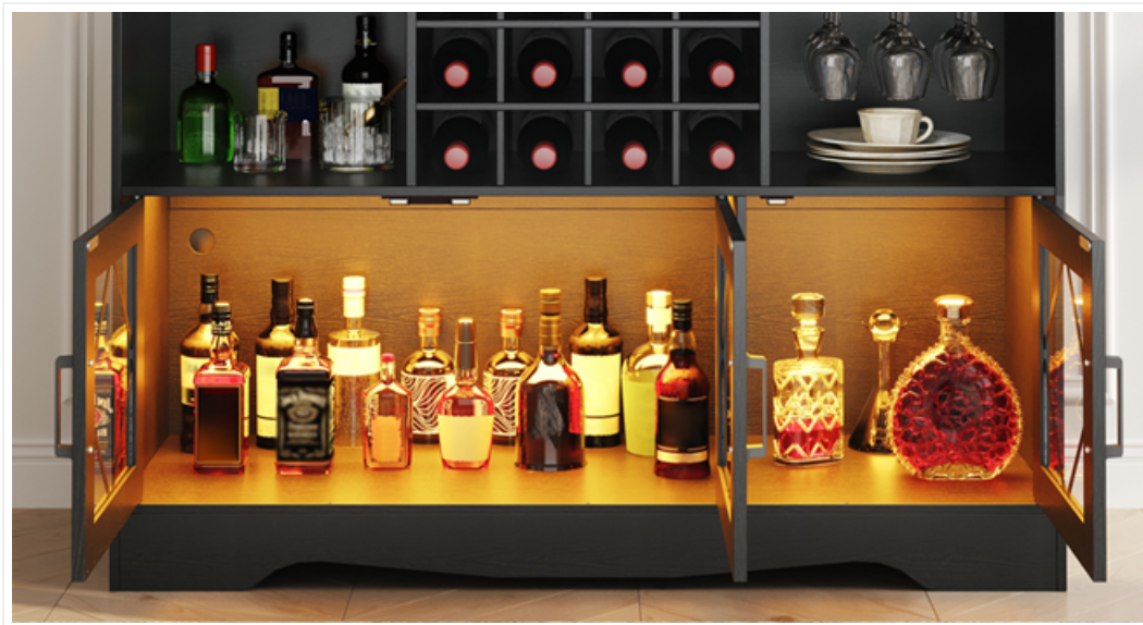
Image 6.2: Adjustable LED lights with remote and app control for customizable ambiance.