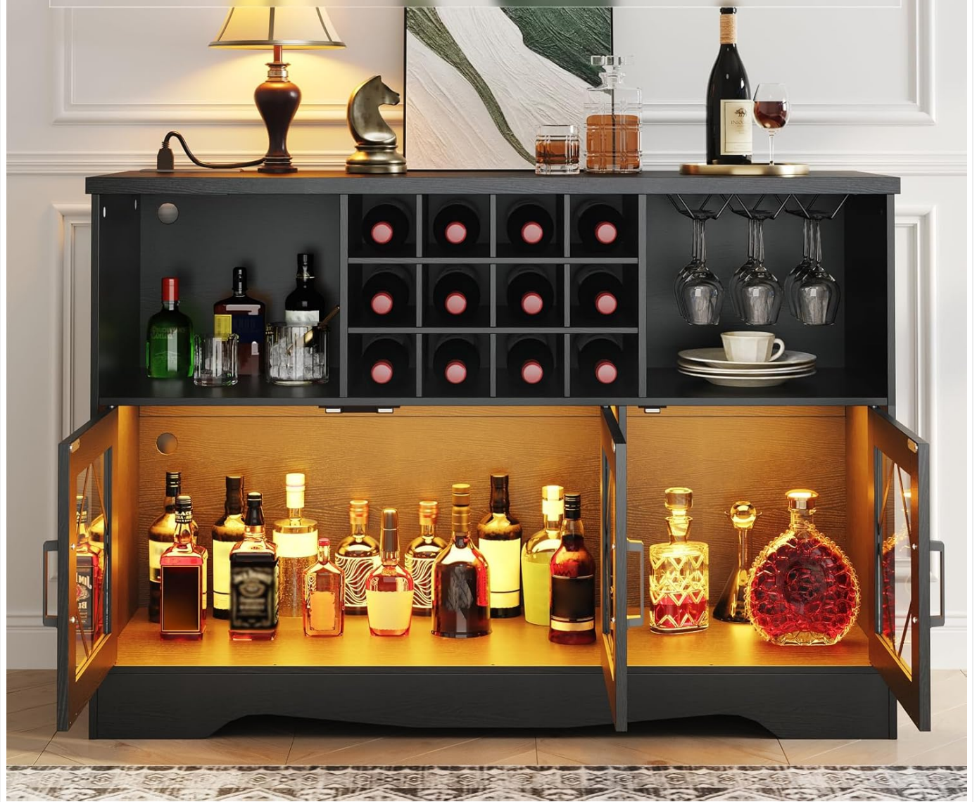
Image 6.4: Enclosed storage compartments with glass doors, ideal for protecting items from dust.

Keeps kitchenware and daily items protected from dust inside the cabinet.