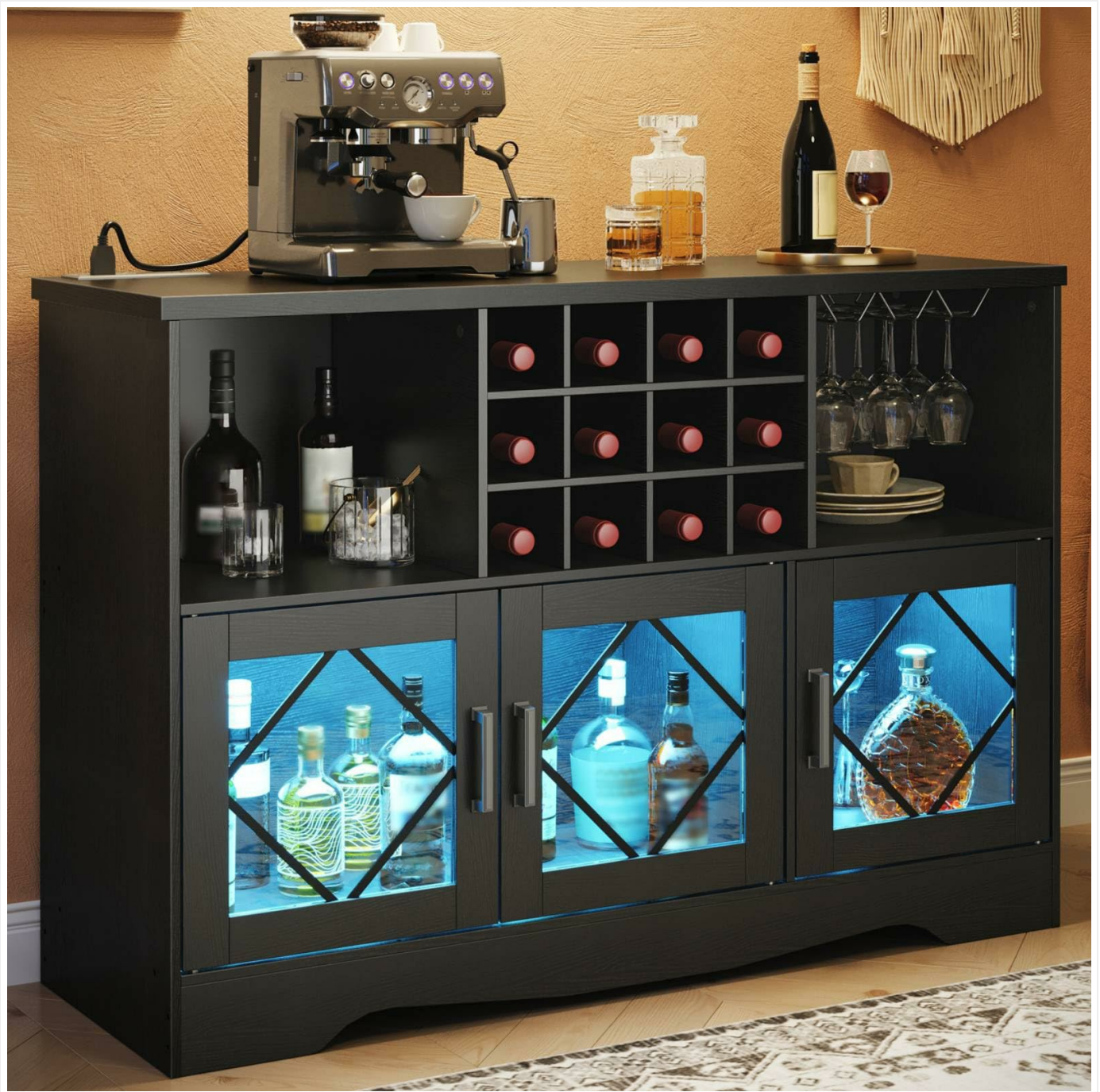
Image 1.1: The HOOBRO BK24UDJG01 Bar Cabinet, showcasing its design and storage capabilities.