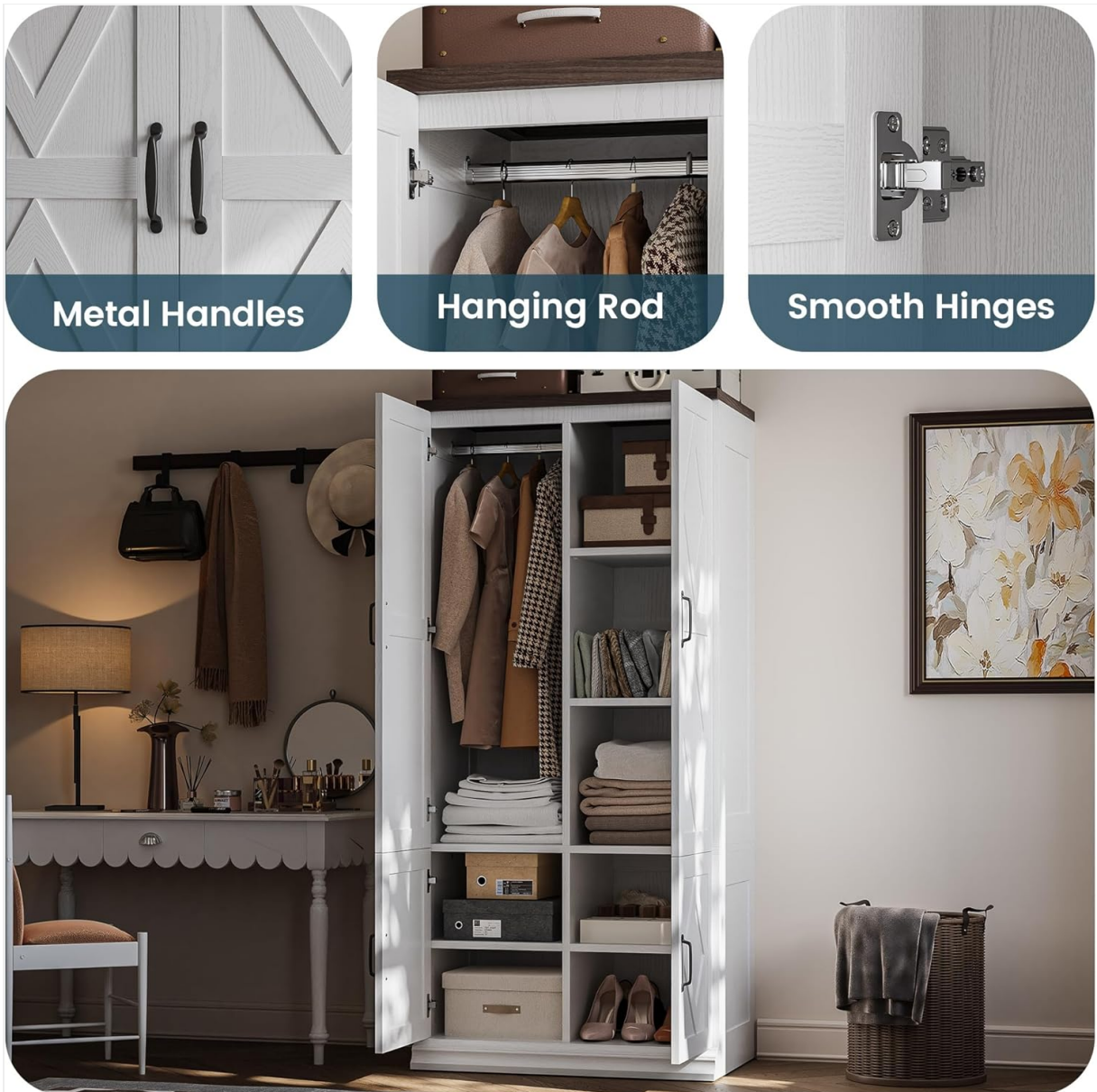
Image: Details of the wardrobe's metal handles, sturdy hanging rod, and smooth hinges, highlighting quality components.