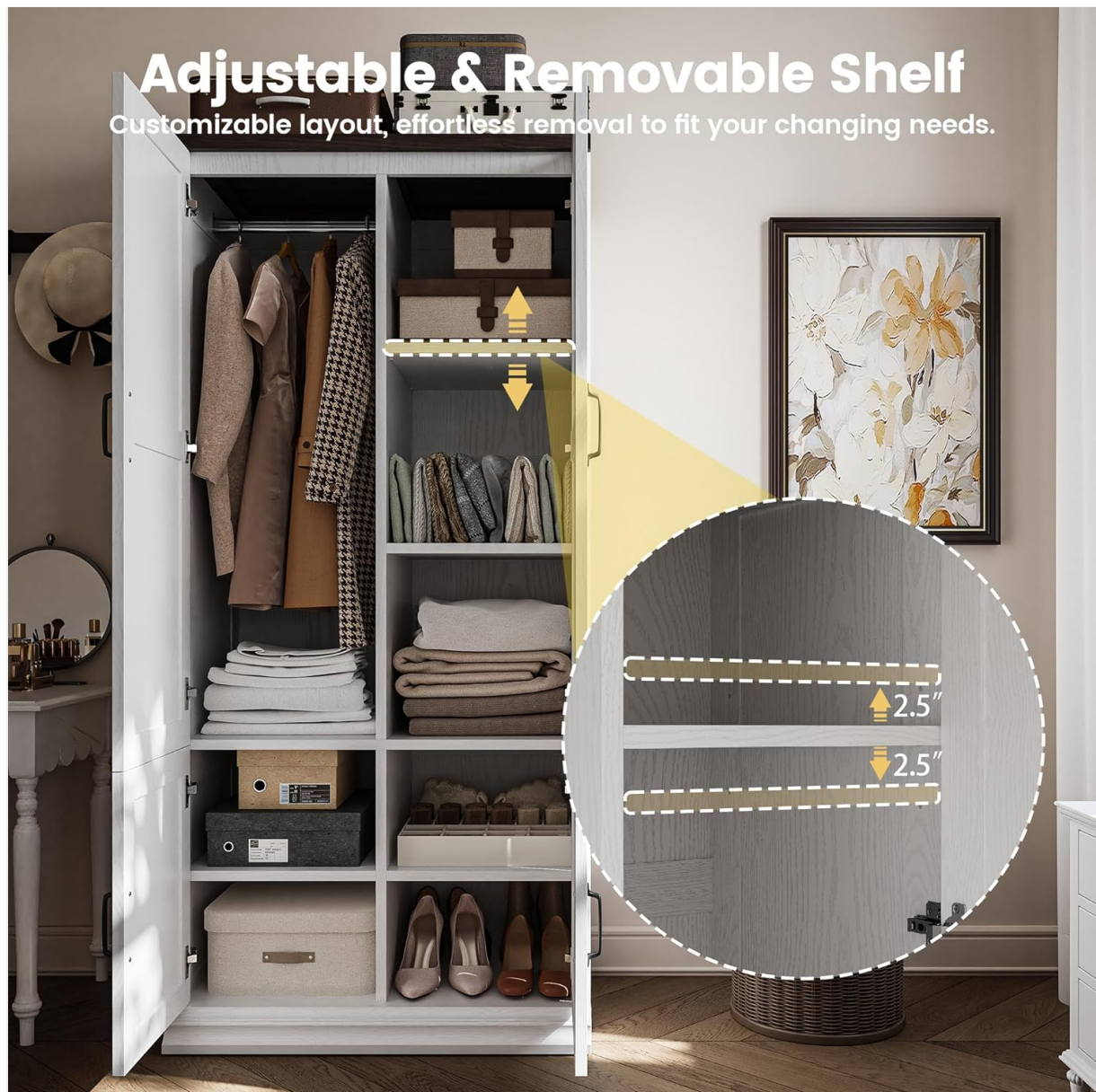
Image: This image highlights the adjustable and removable shelf feature, allowing for customizable interior layouts to fit changing storage needs.