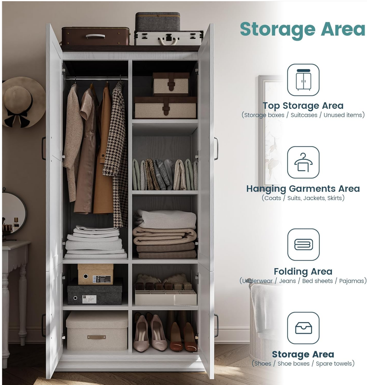
Image: An open wardrobe displaying its various storage zones, including a top area for boxes, a hanging section for clothes, shelves for folded items, and a bottom area for shoes or additional storage.