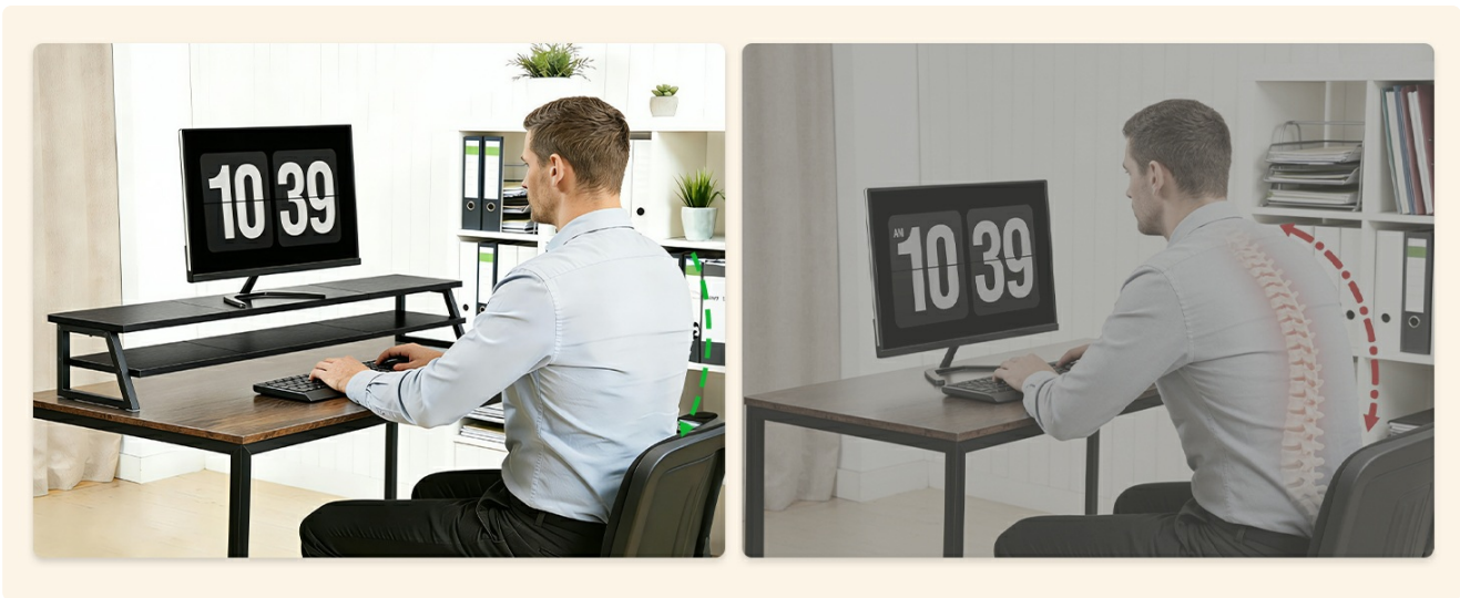
Image: Visual comparison demonstrating improved ergonomic posture when using the monitor stand versus not using it.