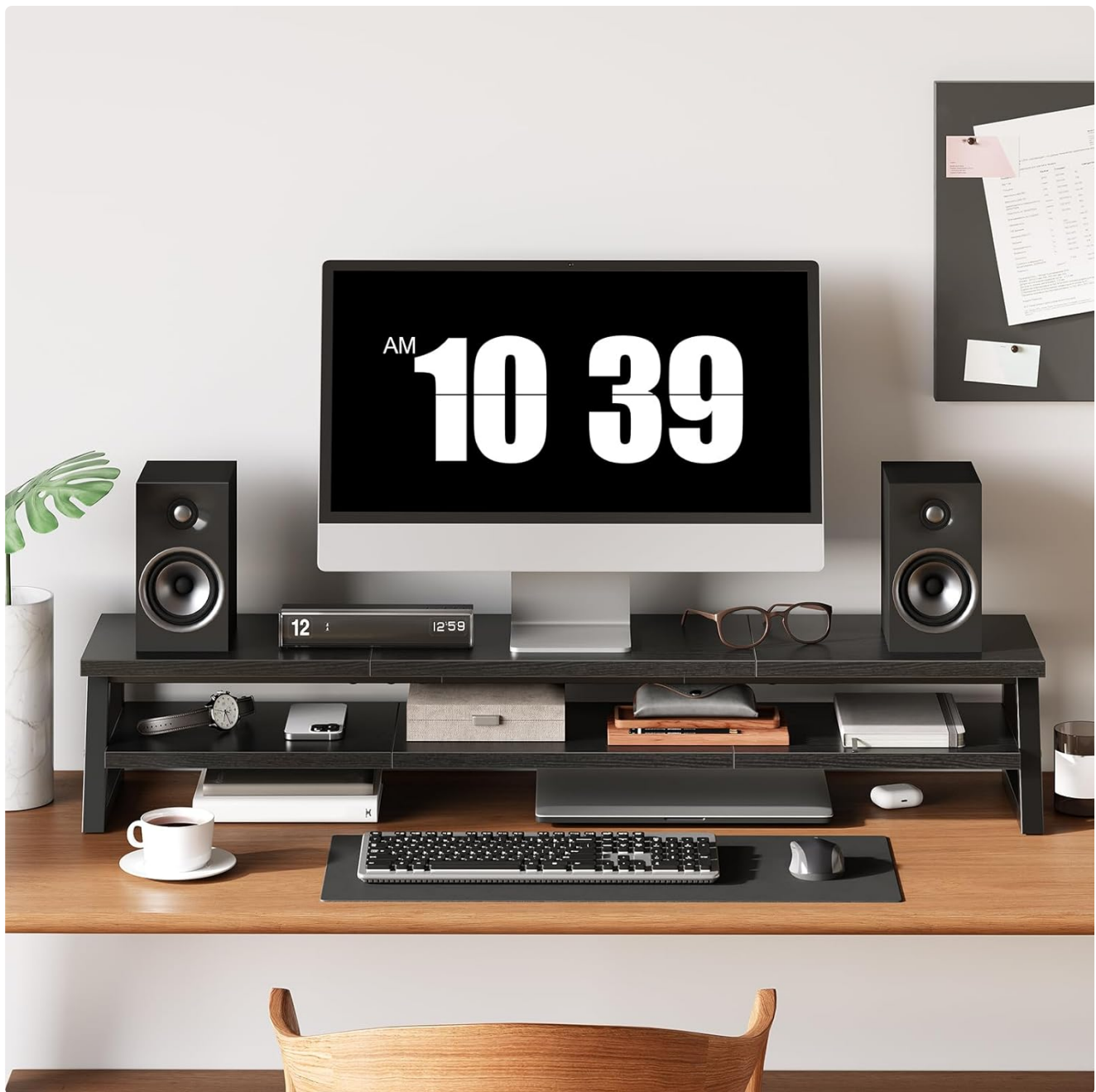
Image: The HOOBRO EBB122CJ01 monitor stand in use, showcasing its ability to organize a desk with a single monitor and various accessories.