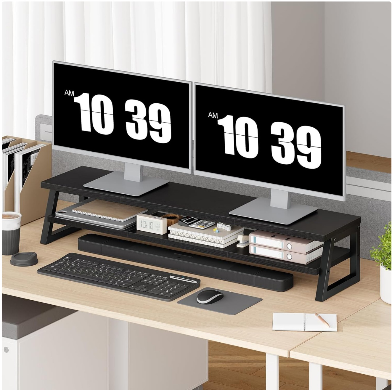
Image: The monitor stand effectively supporting two monitors and providing organized storage for desk items.