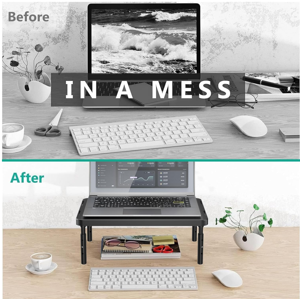
Image 1.3: A visual representation of a desk before and after implementing the monitor stand, highlighting the increased storage space and improved organization.