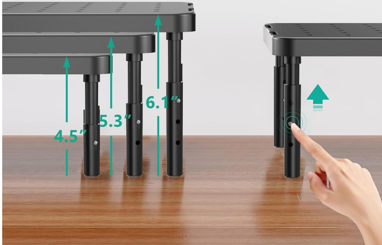
Image 3.1: A detailed illustration of the adjustable legs, highlighting the button mechanism and the three distinct height options available for customization.

Press the bottom and adjust to personal preference