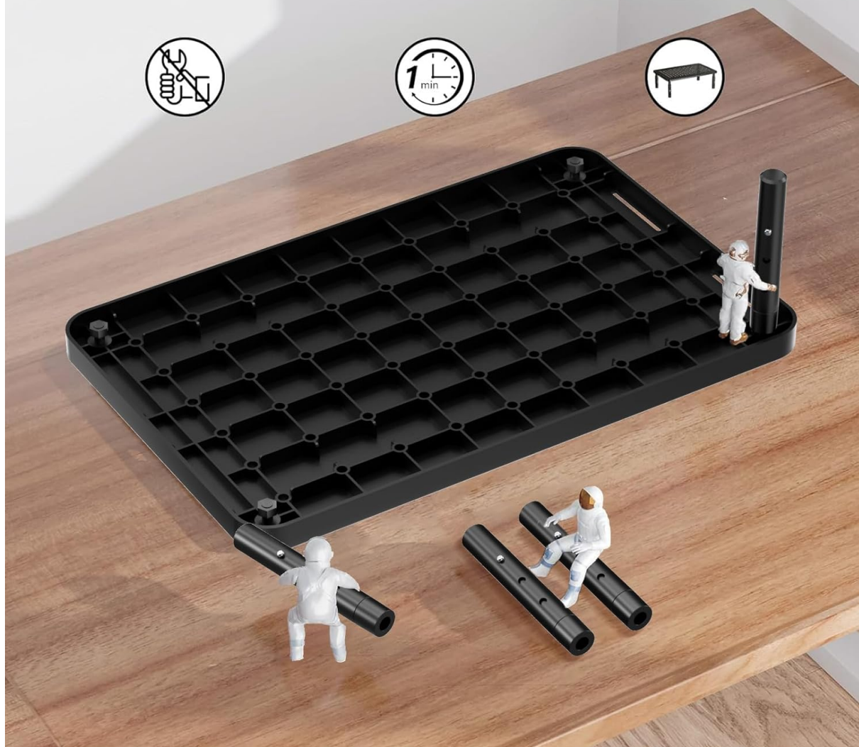
Image 2.1: A visual guide demonstrating the straightforward process of screwing the adjustable legs into the main platform for assembly.