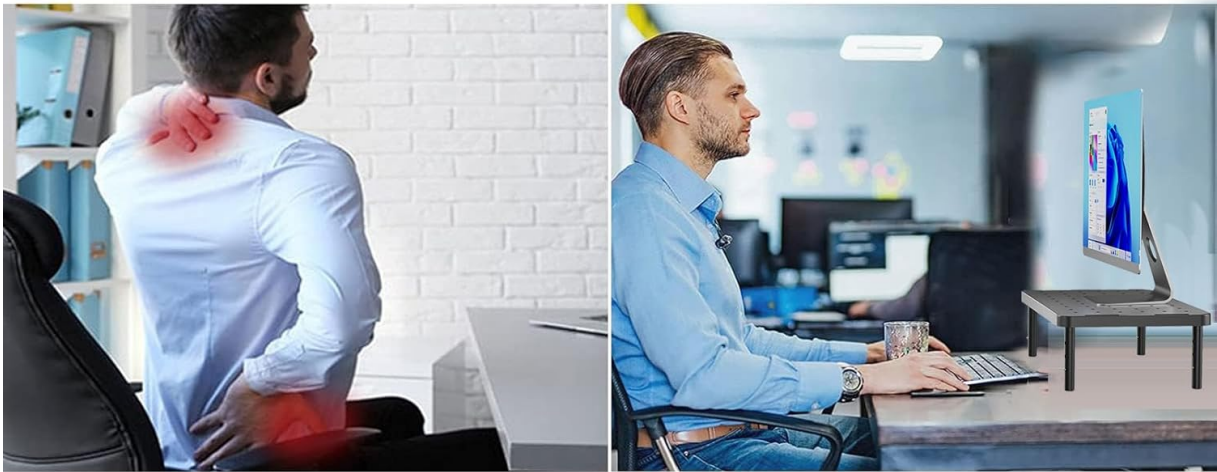
Image 1.2: Visual comparison illustrating the ergonomic benefits of using the monitor stand to achieve a proper viewing angle and reduce neck and back strain.