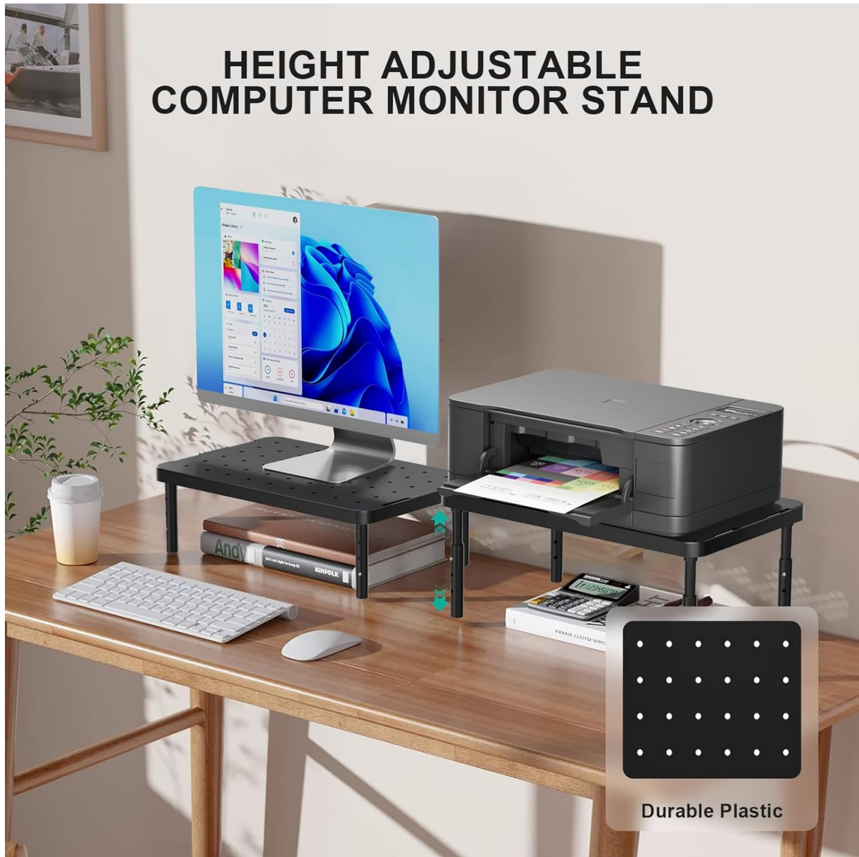
Image 1.1: The WALI PTT001-B monitor stand in use, supporting a monitor and a printer, demonstrating its versatility and space-saving design.