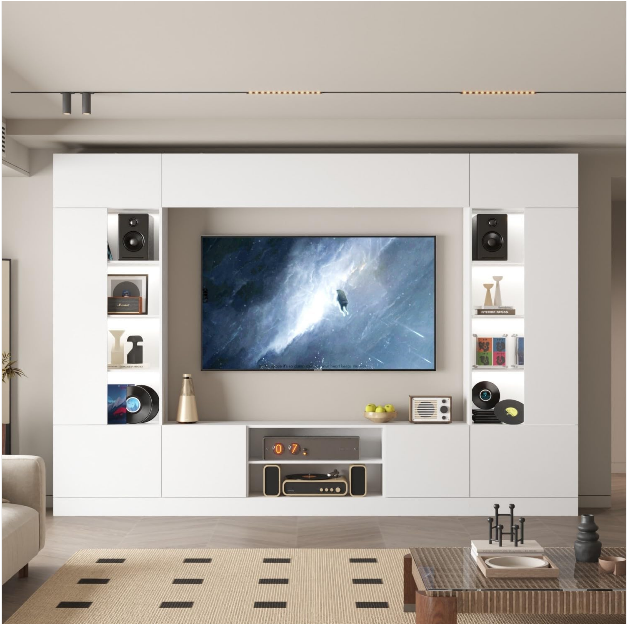
Image: The FAMAPY entertainment center fully assembled and decorated, showing the central TV area, side shelves with lighting, and closed cabinets.

An example of the product in use, showcasing the lighting and storage: