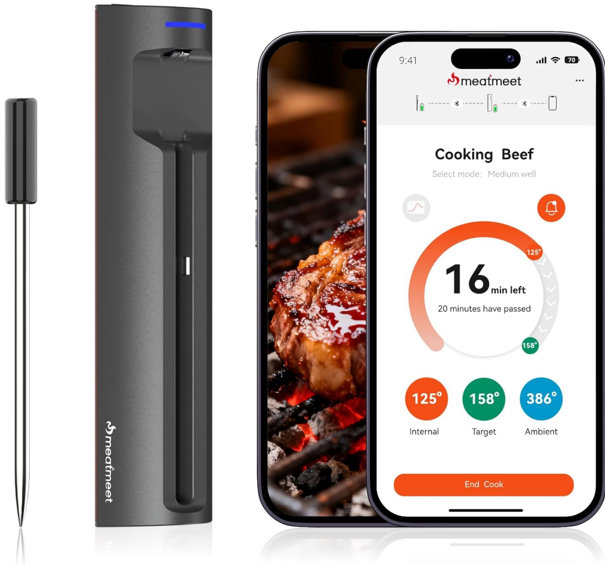
Image: The Meatmeet Pro wireless meat thermometer system, including the probe, booster, and a smartphone displaying the app interface.